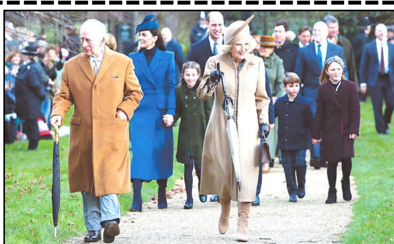
King Charles, Queen Camilla, Prince William, Princess Catherine, Princes George and Louis, and Princess Charlotte, arrive at St Mary Magdalene's church to attend the royal family's Christmas service.

Monitoring Desk NEW DELHI: India's navy will deploy guided missile destroyer ships in the Arabian Sea after an Israel-affiliated merchant vessel was struck off the Indian coast over the weekend, in an effort to "maintain a deterrent presence," it said late on Monday. The Indian navy was investigating the nature of the attack on the vessel, MV Chem Pluto, which docked in Mumbai on Monday, and initial reports pointed to a drone attack, the statement said. "Further forensic and technical analysis will be required to establish the vector of attack, including type and amount of explosive used," the statement added. A spokesperson for Iran's foreign ministry on Monday called a US claim that Iran had attacked the ship near India "baseless".