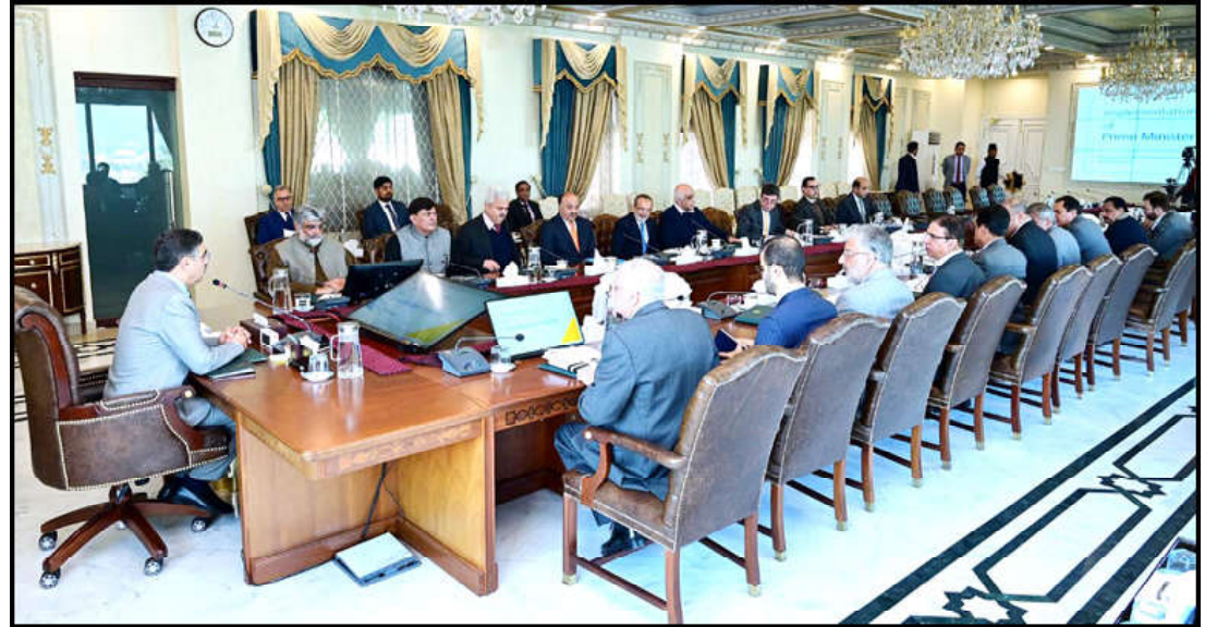
ISLAMABAD: Caretaker Prime Minister Anwaar-ul-Haq Kakar chairs a meeting on matters related to Balochistan.

The chief secretary gave a briefing over different projects of the province. The prime minister further directed for expediting the matters related to the construction of a two-lane highway from Khuzdar to Karachi and observed that with its construction, the different parts of the country would get an alternate leeway, besides strengthening of the linkages. He also asked for an immediate resolution of the financial issues faced by the universities in the province.