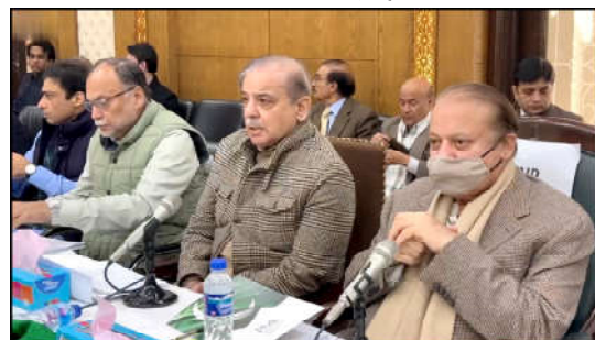
LAHORE: PML-N Quaid Muhammad Nawaz Sharif and President Muhammad Shahbaz Sharif presiding over 16th meeting of Parliamentary Board.