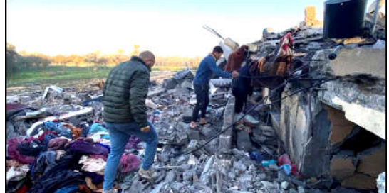
Palestinians inspect the site of an Israeli strike on a house, amid the ongoing conflict between Israel and Hamas, in Khan Younis in the southern Gaza Strip.

strikes in a call with Austin and other national security officials after ordering the Defense Department to prepare a response, the statement said. Biden "places no higher priority than the protection of American personnel serving in harm's way. The United States will act at a time and in a manner of our choosing should these attacks continue," the statement added. The drone attack was claimed by the Islamic Resistance in Iraq, a loose formation of armed groups affiliated with the Hashed al-Shaabi coalition of former paramilitaries that are now integrated into Iraq's regular armed forces.