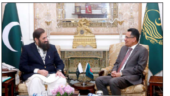
LAHORE: Bangladesh High Commissioner in Pakistan Ruhul Alam Siddique meeting with Punjab Governor Muhammad Balighur-Rehman.

entire route, including the construction of bridges. In response, the CM issued directives for the expeditious completion of the project. During a meeting at the FWO (Frontier Works Organisation) camp office chaired by Chief Minister Mohsin Naqvi, Colonel Jamal and Colonel Ahmed provided a detailed briefing on the project's progress. The meeting addressed various issues related to the project. Chief Minister Mohsin Naqvi emphasized that the completion of Ring Road Southern Loop 3 would enhance transportation facilities for the public.