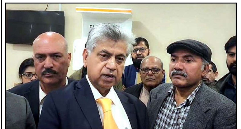
ISLAMABAD: Caretaker Federal Minister for Information Murtaza Solangi talking with media men.

It may be mentioned that the ECP on December 22 declared the intra-party elections of the PTI null and void, besides revocation of its election symbol 'bat'.