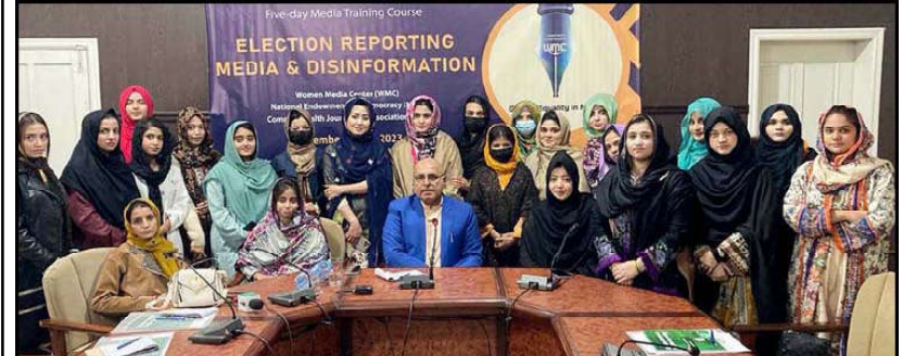
QUETTA: Caretaker Information Minister Jan Achakzai photographed with participants of a workshop organized by Women Media Center

Further, he highlighted the achievements of students in various events held at national and international levels. He highlighted the opportunities provided to the students at different forums in order to groom and nurture the young engineers. The ceremony was attended by a large number of military and civil dignitaries and parents of graduating students.