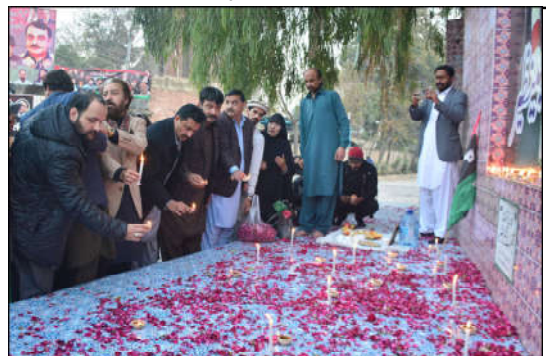
RAWALPINDI: Workers of Pakistan Peoples Party light up the candles in memorandum of Former Prime Minister Benazir Bhutto (Shaheed), at her targeting place, Liaquat Bagh in City.

stalwarts of Pakistan Peoples Party (PPP), Pakistan Muslim League-N (PML-N), Awami National Party (ANP), Jamiatul Ulema Islam-F (JUI-F), Jamaat Islami Pakistan and Pakistan Tehreek e Insaaf (PTI) have mostly fielded political heavyweights to clinch maximum seats from Khyber Pakhtunkhwa and form government for next five years. On NA-28 Peshawar-I, a total of 33 candidates filed papers including former member national assembly, Noor Alam Khan of JUI-F, former minister KP, Taimur Salim Jhagra of PTI and ex-speaker KP assembly.