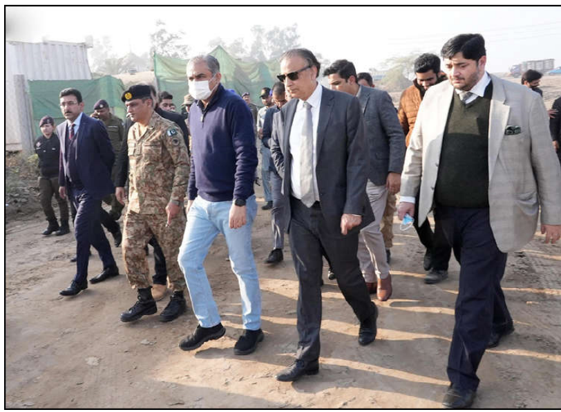
LAHORE: Caretaker Chief Minister Punjab Mohsin Naqvi inspecting the under construction work of Lahore Ring Road Southern Loop-III Project.

translated into even stronger economic, trade, investment, educational, and cultural linkages to the benefit of both nations. He said it is heartening to know that Pakistani medical and dental students are studying in Bangladesh on scholarships. He said that there should be maximum exchange of student delegations in the educational institutions of the two countries. He said that he would also talk to the Higher Education Commission for scholarships for Bangladeshi students in Pakistani educational institutions.