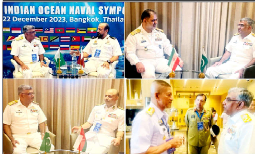
Chief of the Naval Staff Admiral Naveed Ashraf interacting with Heads of various Navies during 8th Indian Ocean Naval Symposium (IONS) in Bangkok, Thailand