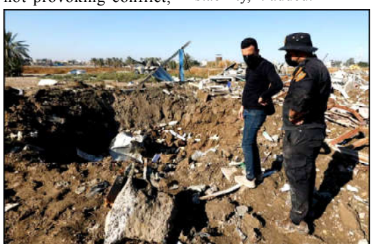
A fighter of the Iraqi Kataeb Hezbollah militia group and a man inspect the site of a U.S. airstrike, in Hilla, Iraq.