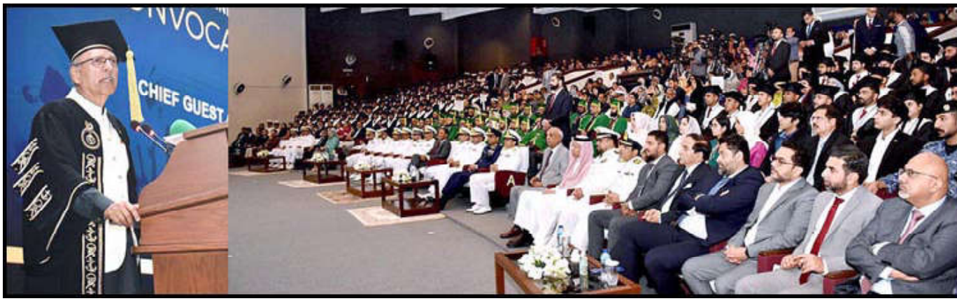
KARACHI: President of Pakistan, Dr. Arif Alvi addressing the Pakistan Navy Engineering College (PNEC) Convocation 2023.