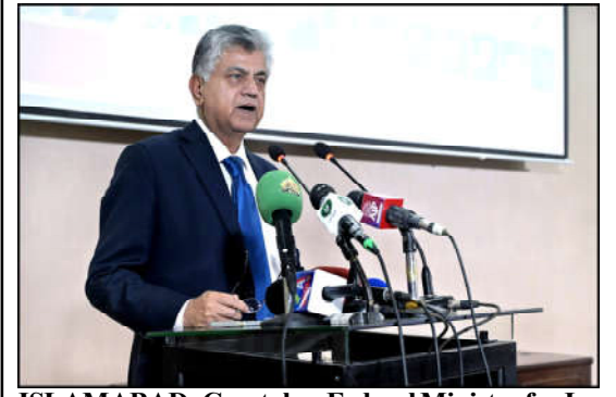
ISLAMABAD: Caretaker Federal Minister for Information and Broadcasting Murtaza Solangi addressing event "Speech Competition on Quaid Day" organized by DEMP at Information Service Academy.

and colleges affiliated with the Federal Directorate of Education (FDE) to pay tribute to Quaid-e-Azam Muhammad Ali Jinnah on his birth anniversary, he underscored that the pivotal solution to the country's urgent challenges laid in upholding democratic traditions. "Respecting the Constitution is crucial as progress rests in following the law. Deviating from this may lead to chaos and a breach of constitutional principles," the minister said.