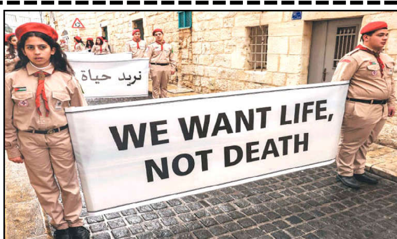
OCCUPIED WEST BANK: Members of the Palestinian youth scouting movement hold banners calling for an end to the conflict in the Gaza Strip during a procession to welcome the Latin Patriarch of Jerusalem.

Monitoring Desk SYDNEY: Large parts of Australia on Sunday sweated through heatwave conditions as authorities warned of a high bushfire risk in many parts of the country's vast Western Australia state. The nation's weather forecaster on Sunday issued heatwave alerts for the western state, the neighbouring Northern Territory and the eastern Queensland state.