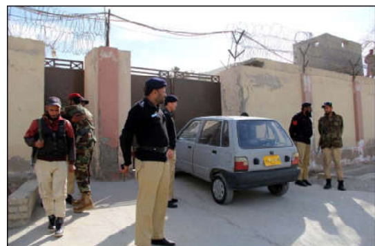
QUETTA: Security officials stand high alert to avoid untoward incident during on the occasion of Christmas Day celebration, outside Sacred Heart Church in Quetta.

Furthermore, the Election Commission spokesperson emphasized that defaulting candidates should approach the Returning Officer for document verification between December 25 and December 30, following the release of the candidate list. All federal and provincial government institutions are urged to communicate directly with the immediate returning officers.