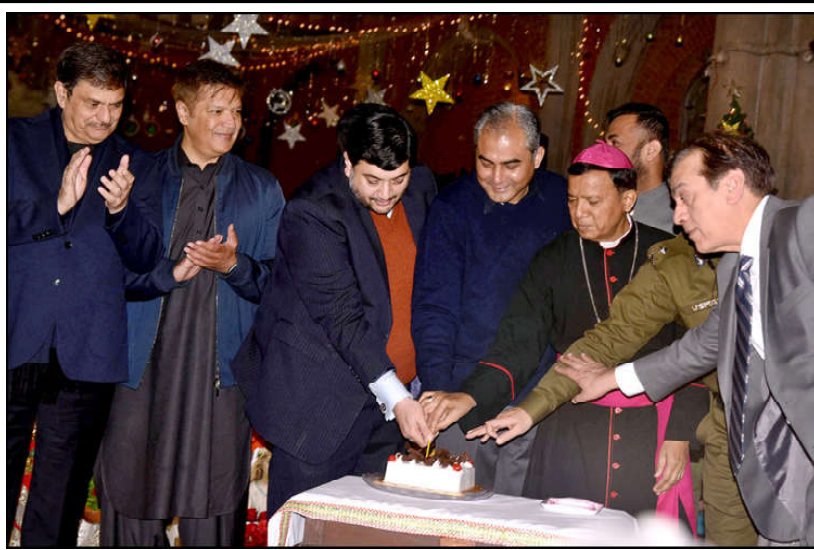
LAHORE: Chief Minister Punjab Mohsin Naqvi cutting the cake on the occasion of Christmas Day at St. Anthony's Church, in the City.

Meanwhile the Punjab government on Monday celebrated the birth anniversary of Quaid-i-Azam Muhammad Ali Jinnah in an unprecedented manner at Chief Minister's office. According to a handout issued here, Chief Minister Mohsin Naqvi and members of the cabinet participated in a cake-cutting ceremony, extending heartfelt wishes to the nation on the revered occasion of the Father of the Nation's birth anniversary.