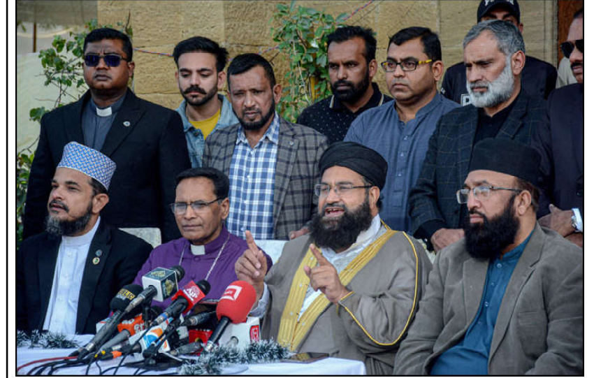
KARACHI: Special Representative to the Caretaker Prime Minister on Religious Harmony & Islamic Countries Hafiz Tahir Mahmood Ashrafi talking to media persons at Holy Trinity Cathedral Church.

"I have already built 60 educational institutions." The former interior minister said that he eliminated land grabbing mafia. "I am not a commodity that can be sold. I belong to a respectable family. I am not a traitor. I will work for the development of Rawalpindi." Regarding his assessment in general elections, he expressed the hope that the PTI voter would vote for him as he has good ties with the former ruling party.