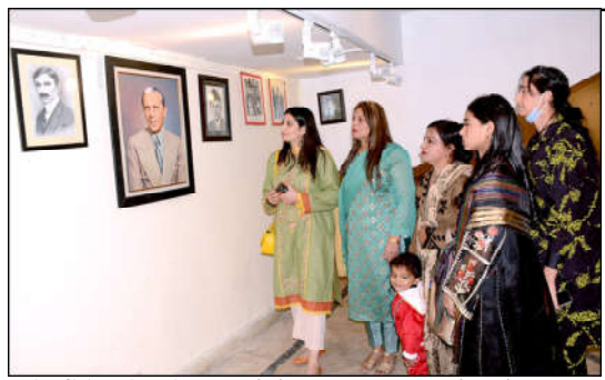
FAISALABAD: Visitor keenly viewing the displayed portrait during an exhibition in connection with Quaid-e-Azam Muhammad Ali Jinnah's 147th birthday at Nurat Fateh Ali Khan Auditorium of Arts Council.

father of the nation. It was gazetted holiday across AJK on this occasion. The day dawned with special prayers in the mosques throughout AJK for the integrity, solidarity, progress and prosperity of Pakistan and for the early success of the Kashmir freedom movement. Special ceremonies to celebrate the birthday of Quaid-e-Azam were hosted in all ten districts, as well as the subordinate tehsil headquarters of Azad Jammu Kashmir including the state metropolis.