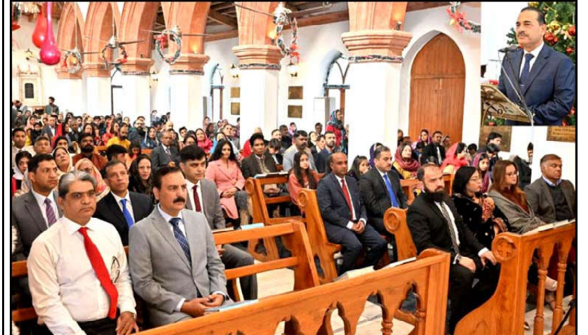
RAWALPINDI: Chief of Army Staff (COAS) General Syed Asim Munir addressing a Christmas ceremony at Christ Church

At the end, the COAS befittingly acknowledged the contributions and sacrifices made by the entire Christian community of Pakistan in all the fields and domains.