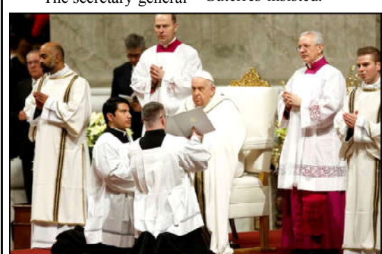
Pope Francis celebrates Christmas Eve mass in St. Peter's Basilica at the Vatican.

"The international community has a responsibility to use all its influence to prevent further escalation and end this crisis," Mr. Guterres insisted.