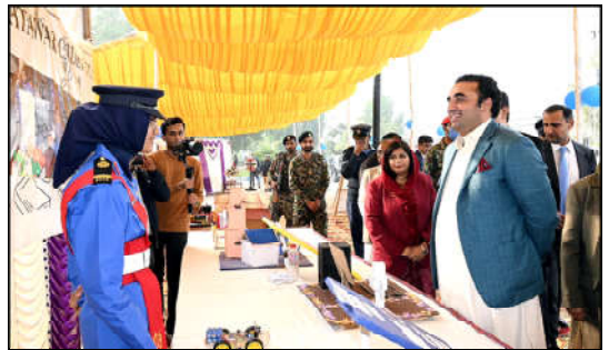
NAWABSHAH: Chairman Pakistan People's Party Bilawal Bhutto Zardari inspecting different arts and science projects prepared by students of Bakhtawar Cadet College

He said that a special assistance center was set up by the Islamabad Police, which could be contacted at telephone numbers 0519001534 and 03459600622 or email address assistance.ictp@gmail.com.