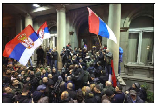
Supporters of the opposition 'Serbia Against Violence' (SPN) protest in front of the city hall, after the SPN alleged major election law violations in the Belgrade city and parliament races, in Belgrade, Serbia.

Some former leaders of the West have spoken about a new Cold War between Russia and China on one side and the United States and its allies on the other, though Russia's $2 trillion economy would find it hard to counter the entire might of the West alone for long.