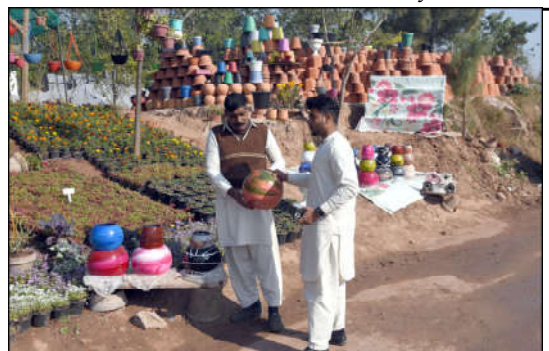
ISLAMABAD: A man is buying flower pot from vendor at nursery along the Park road in Federal Capital.

"This event has given me valuable insights into the significant influence of Linqu and has introduced me to several high-quality building material enterprises," expressed Tahir, impressed by the thriving building materials industry in Linqu. Pakistan is currently witnessing a growing demand for building materials due to rapid urbanization and infrastructure development initiatives. The country's expertise in areas such as marble, granite, and textiles presents promising opportunities for collaboration with Linqu's building materials sector.