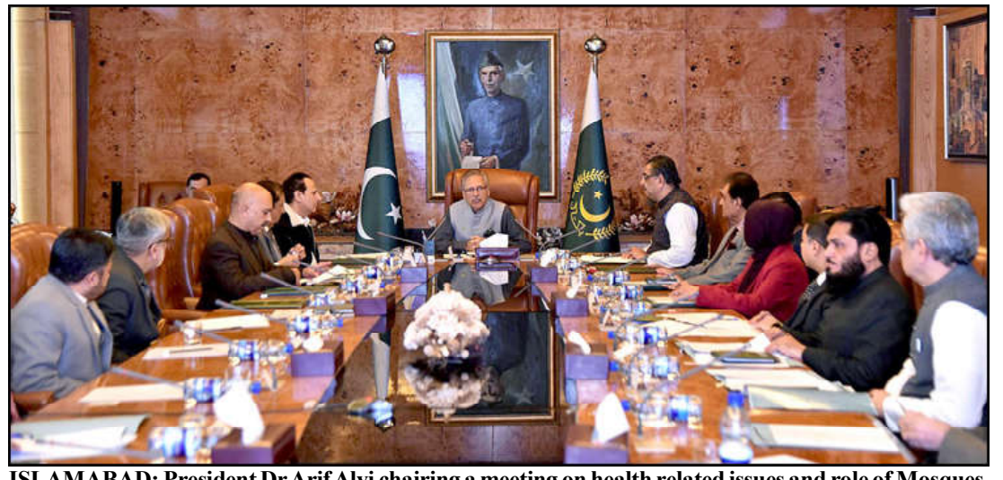
ISLAMABAD: President Dr Arif Alvi chairing a meeting on health related issues and role of Mosques, at Aiwan-e-Sadr.