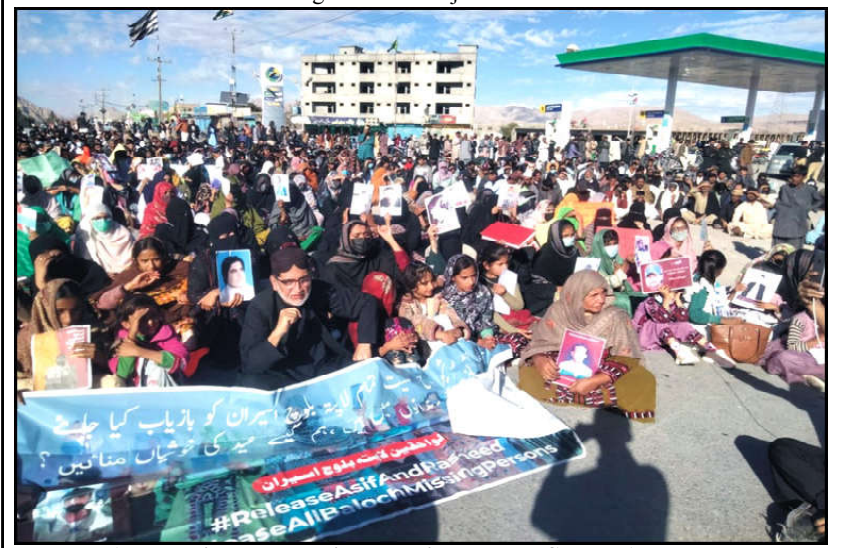
KHUZDAR: President Balochistan National Party Sardar Akhtar Jan Mengal participating in a protest held against arrest of participants of Baloch Yakjethi March in Islamabad

cordingly. The provisions of Section 215 of the Election Act, 2017 are hereby invoked and PTI is hereby declared ineligible to obtain the Election Symbol, for which they have applied for". It may be noted that the ECP rendered the intra-party polls as invalidated hence, Barrister Gohar Ali Khan, who became the party's chairman, would no longer be the party's top head. The development came shortly after the PTI held discussions with ECP authorities, prompted by the Supreme Court's directive for the ECP to allow PTI's reservations regarding lack of a level-playing field. As per the PTI, the ECP assured its delegates that it would redress their grievances.