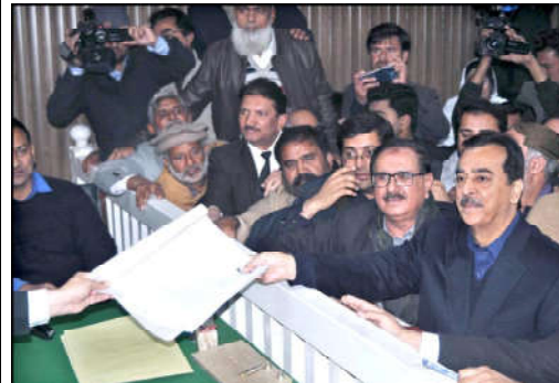
MULTAN: Senior Vice Chairman PPP, Syed Yousaf Raza Gillani submitting his nomination papers with his supporters at the Commissioner's office.

Independent Report LAHORE: Chief Minister Punjab Mohsin Naqvi has directed the health secretary that all hospitals must adhere to a 24/7 facility for providing CT scans and MRI reports to patients. He made a surprise visit to Children's Hospital on Friday where parents raised concerns regarding delayed issuance of CT scans and MRI reports. The CM was informed that CT scans and MRI reports were issued three days after the tests. The CM warned that hospitals found to be causing delay in delivering CT scans and MRI reports would face administrative action. During his visit, the CM inspected various wards, interacted with parents of children and inspected the medical facilities. The CM also inspected up-gradation work, engaged with the labourers and assessed progress.