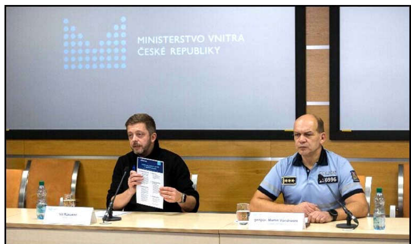
Czech Interior Minister Vit Rakusan and Police Chief Martin Vondrasek give a press conference in the Ministry of the Interior in Prague, Czech Republic.