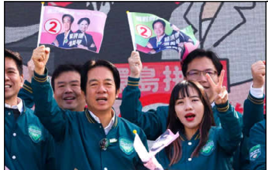
Lai Ching-te, Taiwan's vice president and the ruling Democratic Progressive Party's (DPP) presidential candidate gestures during an election campaign event in Kaohsiung, Taiwan.

Monitoring Desk MOSCOW: Russia may cut diplomatic ties with the United States if Washington confiscates Russian assets frozen over the Ukrainian war, the Interfax news agency quoted Deputy Foreign Minister Sergei Ryabkov as saying on Friday. The United States "must not act under an illusion... that Russia is clinging with both hands to diplomatic relations with that country," Ryabkov said. Russia has described relations with the United States as "below zero" because of U.S. military and financial aid for Ukraine in the war now approaching the end of its second year. Ryabkov said Russia, which sent forces into Ukraine in February 2022 in what it called a "special military operation", would not be the one to initiate a break in diplomatic ties, but such a rupture could be prompted by a variety of factors.