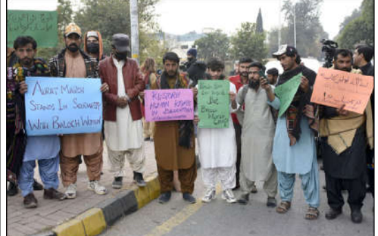
ISLAMABAD: Youngsters from Balochistan Province are shouting slogans during protest in the favor of their demands outside National Press Club in Federal Capital.