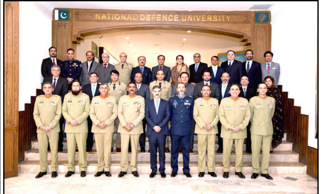
ISLAMABAD: Caretaker Prime Minister Anwaar-ul-Haq Kakar in a group photo with the President, Directoring Staff of National Defence University and graduating Civil Service officers of National Security Course-2024.

The prime minister said there was a wave of terrorism in the country and there were forces which wanted to cause disruption in Pakistan and the government would make all efforts to protect the lives of people.