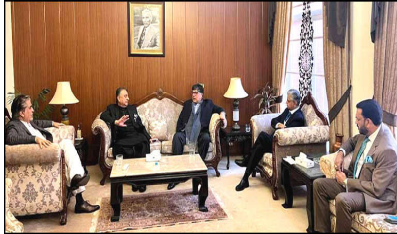
ISLAMABAD: Governor Balochistan Malik Abdul Wali Khan Kakar meeting with members of the committee formed led by the caretaker Federal Minister Fawad Hasan Fawad regarding the Baloch Yakjethi March