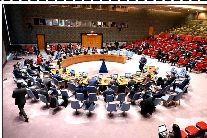
NEW YORK: A view of meeting of Security Council regarding Afghanistan at UN Office.

According to the Red Crescent, intense shelling and sniper firing by the Israeli army is also ongoing in the area.