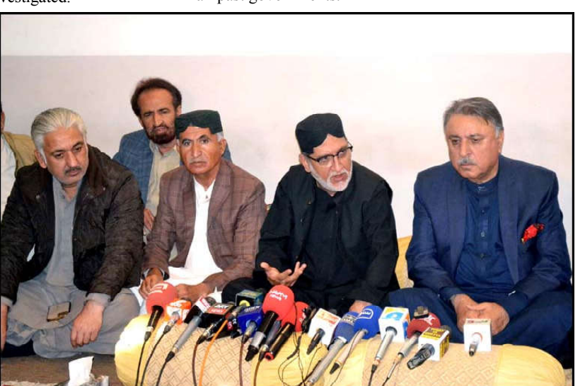
QUETTA: Balochistan National Party Chief, Sardar Akhtar Jan Mengal along with others addresses to media persons during press conference held in Quetta.

PM Kakar further stated that a strong coordination existed between the caretaker government and the Election Commission of Pakistan (ECP) for holding transparent elections. He assured that the caretaker government would fulfill all responsibilities for fair elections in the country. Kakar also noted that the individuals involved in the violent events of May 9 were currently facing the law.