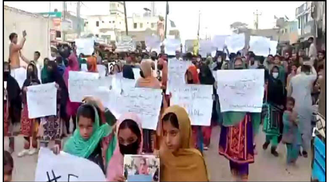
HUB: Baloch Yekjehti Committee holding a rally against arrest of protesters in Islamabad