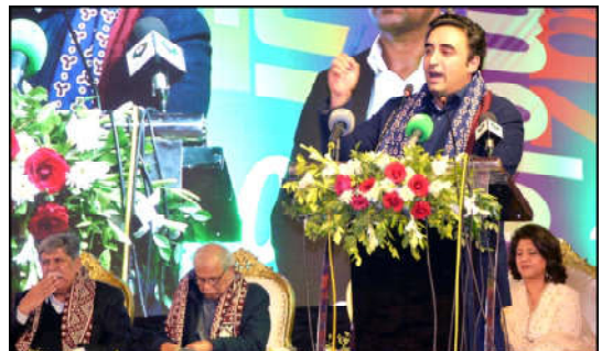
HYDERABAD: Pakistan Peoples Party (PPP) Chairman Bilawal Bhutto Zardari speaking at 9th Ayaz Melo organised by Khanabadosh Writers Cafe in collaboration with Culture & Tourism Department Sindh at Sindh Museum.

the suppression of history, culture and language. The PPP leader called for a societal shift, encouraging a transition from a culture where youth wielded guns to one where they held pens, aiming to showcase Pakistan's rich history and culture. Bilawal, while recognising the progress made towards curbing extremist mindsets, cautioned against political parties labelling each other as traitors or infidels. Instead, he stressed the importance of collaborative governance, urging an end to political polarisation with the assistance of the masses. About the global challenge of climate change, Bilawal proposed a comprehensive awareness campaign to tackle environmental concerns.