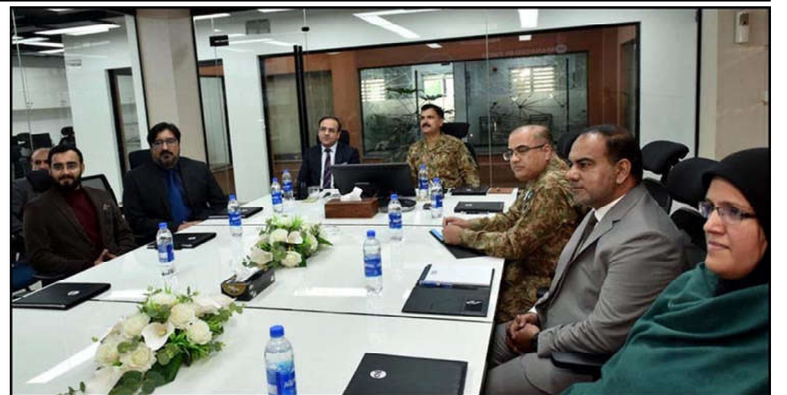
Caretaker Federal Minister for IT and Telecommunication, Dr. Umar Saif visited Frontier Works Organization (FWO) Headquarters in Rawalpindi.

In most cases, adequate performance is not possible. FTO Secretariat also comes to know that investigation reports and case studies of few cases of alleged tax evasion were prepared and shared by directorate related to Broadening of Tax Base (BTB).