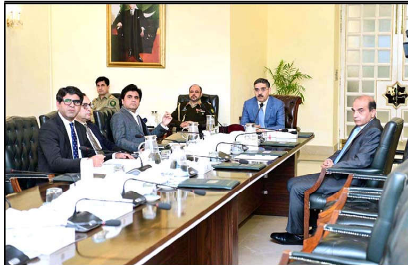
ISLAMABAD: Caretaker Prime Minister Anwaar-ul-Haq Kakar chairs a meeting on Prime Minister Prime Minister's Youth Program.