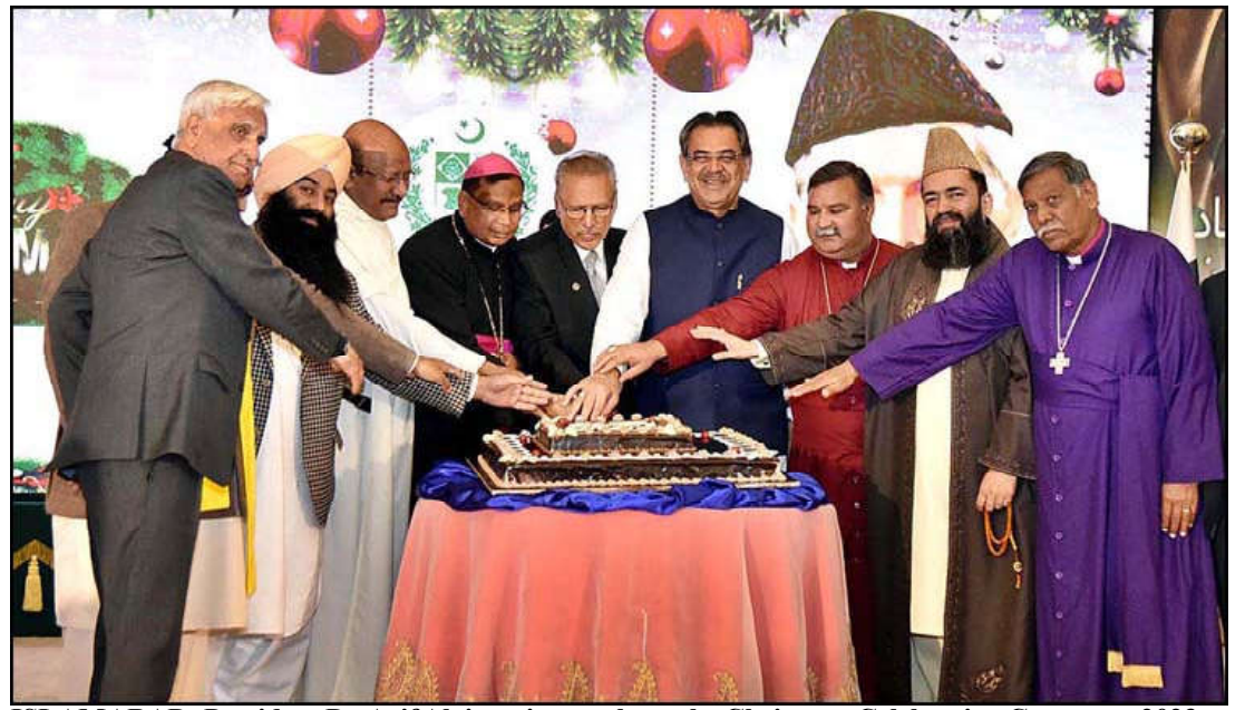
ISLAMABAD: President Dr. Arif Alvi cutting a cake at the Christmas Celebration Ceremony 2023 at Aiwan-e-Sadr.

spite the United Nations' calling for immediate ceasefire and a denunciation by the Pope himself, the carnage of Palestinians including Christians continued where churches besides, mosques were razed to the ground. The enlightened world advocating the tenets of democratic values was so oblivious to the humanitarian woes in the conflict, he added. He said when Pakistan Resolution was passed during 1940, a simultaneous resolution over Palestine was also adopted and reaffirmed that the two-state was the only solution to the issue.