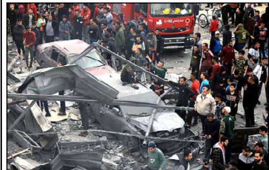
GAZA: People busy in relief activities after air strike by Israeli forces in Rafah.

Many have been enduring temperatures well below freezing in flimsier tent-like units with blue plastic sheeting on the outside and a quilted cotton lining inside.