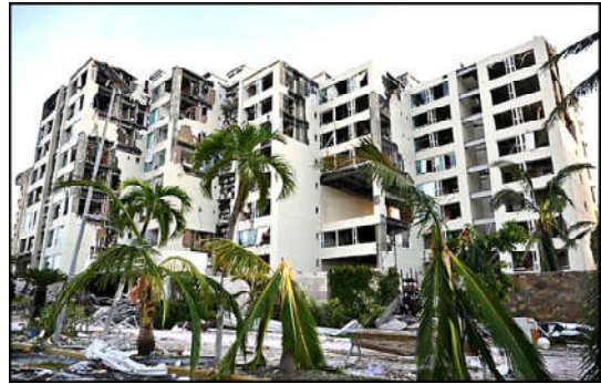
MEXICO: A view of damaged buildings due to Hurricane Otis made landfall near Acapulco.

The statement said that all states were urged to remain alert so that the new type of corona virus does not take a dangerous form.