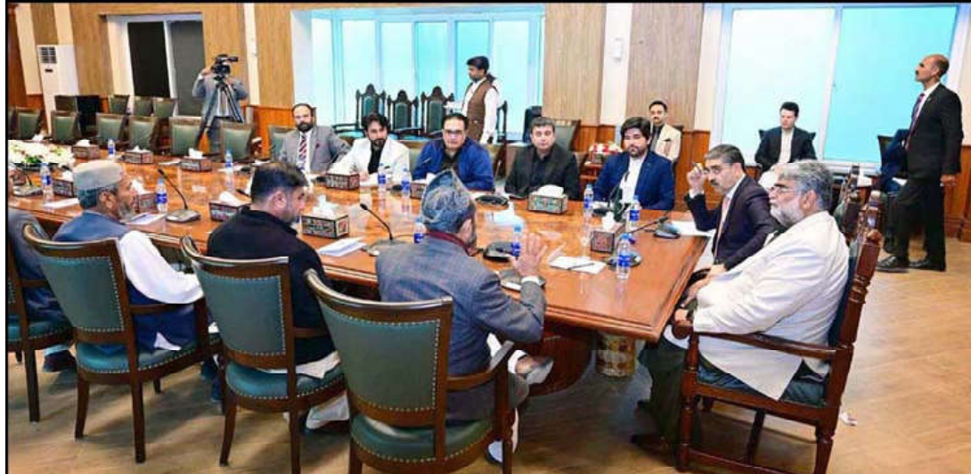
QUETTA: A delegation of the Zamindar Action Committee of Balochistan call on caretaker Prime Minister Anwaar-ul-Haq Kakar.

Dr. Gohar Ejaz encouraged the exporters to uphold high-quality standards, increase productivity, and implement effective marketing strategies to meet the expectations of the Chinese market. Acknowledging the crucial role of the Chinese companies in the process, the minister expressed optimism about the prospects of collaboration.