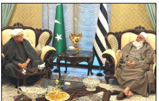
ISLAMABAD: Chairman Pakhtoonkhwa Milli Awami Party Mahmood Khan Achakzai meeting with Amir Jamiat Ulema-e-Islam Maulana Fazlur Rehman.