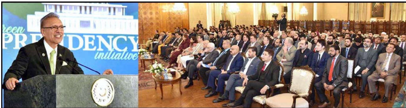
ISLAMABAD: President Dr Arif Alvi addressing the event to celebrate Award Winning Project Green Presidency, at Aiwan-e-Sadr.