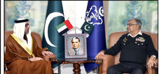
ISLAMABAD: Chief of the Naval Staff, Admiral Naveed Ashraf exchanging views with Ambassador of the United Arab Emirates to Pakistan Hamad Obaid Ibrahim Salem Al-Zaabi at Naval Headquarter.

ISLAMABAD (Online): Supreme Court (SC) has declared null and void Balochistan High Court (BHC) decision on changing delimitation of two constituencies of Balochistan. A 3-member bench of SC presided over by Justice Sardar Tariq Masood nullified BHC decision on the petition against the delimitation of two provincial constituencies of Quetta, Monday. SC has said in the decision that objection cannot be raised on constituencies following the issuance of election schedule. The court accepted commission's appeal. Justice Athar Minallah said in his remarks it is the biggest test of Election Commission (EC) that general elections are held in transparent manner on February 8. When election schedule is issued then every thing