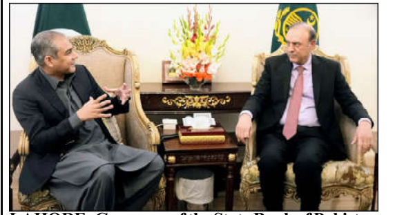
LAHORE: Governor of the State Bank of Pakistan (SBP) Jameel Ahmad called on Punjab Caretaker Chief Minister Mohsin Naqvi.

paramount. The anticipated positive outcomes include widespread benefits from enhanced economic activities in the agricultural and other sectors, he noted. The CM also highlighted the significance of achieving record cotton production in Punjab, projecting substantial savings of two billion dollars in foreign exchange. The CM pointed out that the rice export from Punjab has exceeded two billion dollars as the provincial government is following a policy of providing comprehensive facilities to investors and industrialists, foreseeing positive ramifications in the form of a thriving stock exchange.