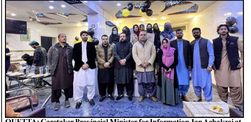
QUETTA: Caretaker Provincial Minister for Information Jan Achakzai at the 5th anniversary of Balochistan Youth Empowerment Society.