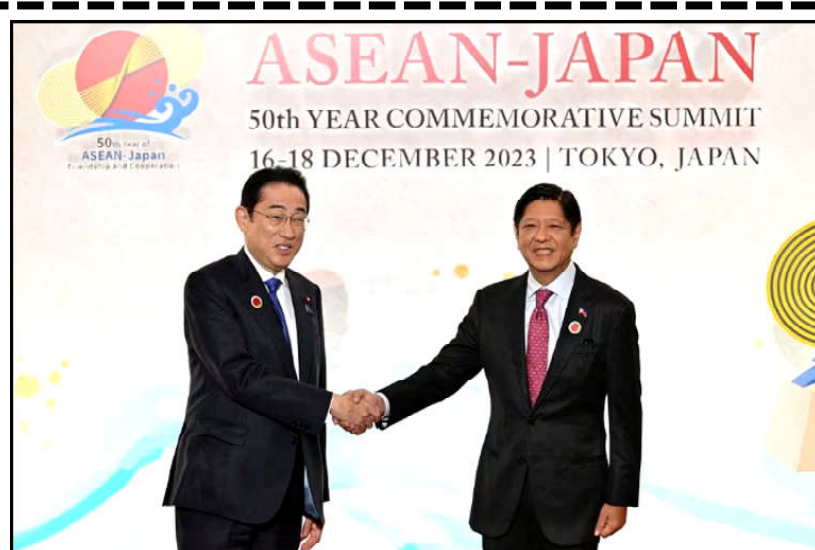
Japan's Prime Minister Fumio Kishida greets Philippines' President Ferdinand Marcos Jr. upon arrival for the opening session of the ASEAN-Japan Commemorative Summit Meeting at the Hotel Okura Tokyo in Tokyo, Japan.

tary gangsters" in the United States and South Korea for raising tensions with drills, displays of force and nuclear war planning. The statement by an unnamed ministry spokesman cited the arrival of the US nuclear-powered submarine USS Missouri in the South Korean port city of Busan on Sunday. "The armed forces of the DPRK will thoroughly neutralise the US and its vassal forces' attempt to ignite a nuclear war and thus reliably ensure peace and security in the Korean peninsula," the statement said, using the initials of North Korea's official name, the Democratic People's Republic of Korea.