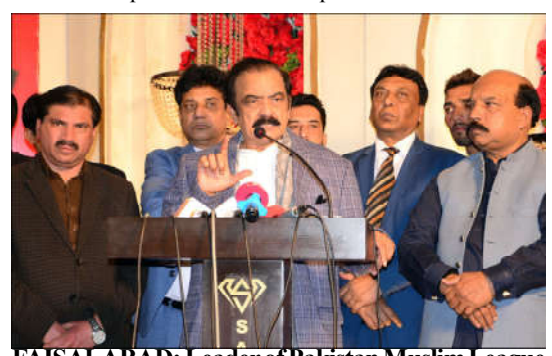
FAISALABAD: Leader of Pakistan Muslim League (N) Rana Sana Ullah Khan addressing during the Christmas Milan Party ceremony in the city.

not getting a level playing field. They are saying cases are being filed against them. They wanted to do politics but their leader pushed them to the sidelines. They have crossed the red line on May 9," said the PML-N leader. "It is not their right to attack the GHQ. The statues of the martyrs were thrown down. On May 9, the biggest defence office was attacked. Those who do such things will face consequences," said Sana. At the end, Sana said that he would talk to the caretaker chief minister for release of outstanding dues of Christian employees. He said that Nawaz Sharif brought prosperity to the country, in 2017, the dollar was cheap and the country was developing. Nawaz Sharif brought an investment of 40 billion dollars through CPEC. Due to this, in 2018, many forces tried to block the path of PML-N.