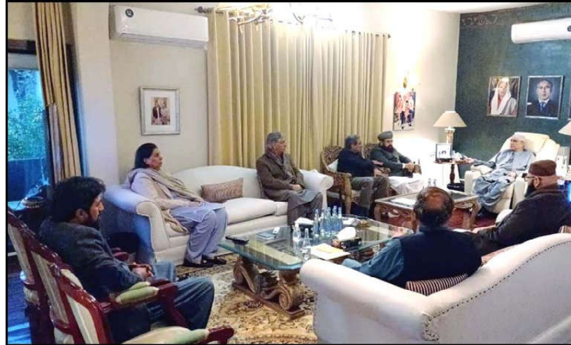
ISLAMABAD: Peoples Party Parliamentarian (PPPP) President, Asif Ali Zardari in meeting with renowned religious scholar and former federal minister Hamid Saeed Kazmi, held at Zardari House in Islamabad.

United States provided $18.6 billion in equipment to the Afghan National Defense and Security Forces between 2005 and August 2021. These weapons helped the TTP carry out cross-border terrorist attacks after the U.S. withdrawal. All these facts indicate that the Afghan regime is not only arming the TTP but also providing a safe haven for other terrorist organizations.