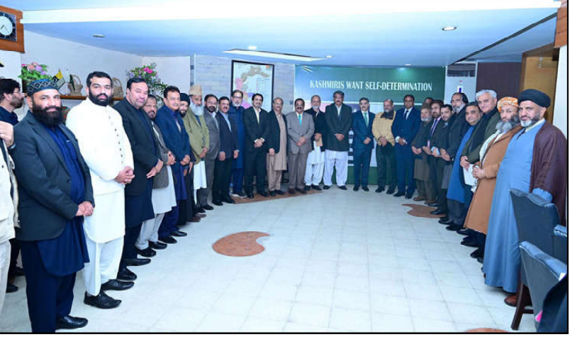
MUZAFFARABAD: A delegation of Hurriyat leaders calls on the Caretaker Prime Minister Anwaar-ul-Haq Kakar.

Marwat, who is senior vice president of the party, was leaving the high court premises after attending a lawyers' convention when a heavy contingent of police arrested him. According to police, the PTI leader was arrested under 3MPO and shifted to Mazang police station. Last week, the PTI leader alleged an attempted "abduction" by KP police while en route to Gulabdar near Chakdara for a party convention scheduled in Bajaur.