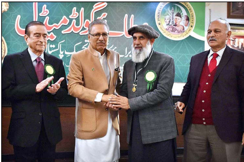
LAHORE: President Dr Arif Alvi distributing the Gold Medals to the Honour workers of Pakistan Movement during the 29th Annual Gold Medal ceremony of Tehreek-e-Pakistan Trust organized by Nazriya-e-Pakistan Trust and Pakistan Worker Trust.