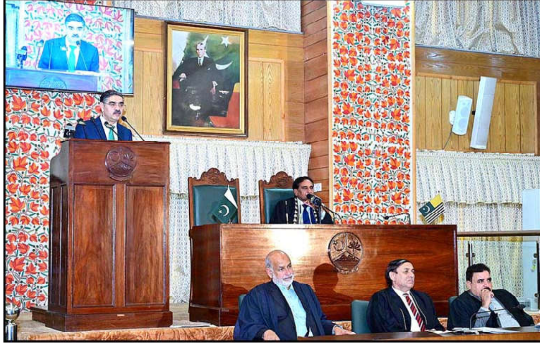
MUZAFFARABAD: Caretaker Prime Minister Anwaar-ul-Haq Kakar addresses the special session of Azad Jammu and Kashmir Legislative Assembly.

Ph: 2841470/2841473 Vol: XVIII No. 337, Jamadi-us-Sani 01, 1445 AH Friday December 15, 2023, Pages 08, Price Rs.15