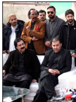
QUETTA: Chairman Senate, Muhammad Sadiq Sanjrani addresses to media persons during press conference, in Quetta.

The PTI leader Mobin Khilji announced to join BAP during a joining ceremony arranged by the