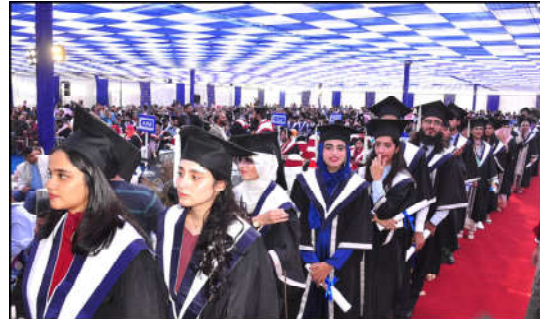
KARACHI: Newly Graduated students are celebrating their graduation during 13th Convocation at University in Federal Capital.

situation and the other is extreme weather conditions. He said the ECP should consult all the political parties and stakeholders for the election date as harsh weather conditions coupled with the security situation in Khyber Pakhtunkhwa and Balochistan could affect the election. He said that the economic situation of the country could only be streamlined if an elected government came to power for which a fair and transparent election was imperative. Referring to the Dera terror attack, he said that he met with the injured as well as the bereaved families and all of them were determined and in high morale.