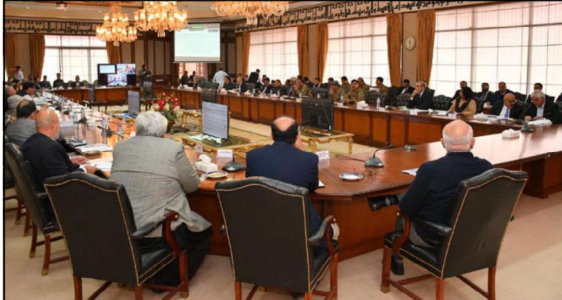
Minister for Planning, Development and Special Initiatives Muhammad Sami Saeed chairs the 7th Executive Committee meeting of Special Investment Facilitation Council (SIFC) in Islamabad.

The Finance Minister apprised the French Ambassador about the economic reforms of the government that have brought economic and fiscal stability in the country.