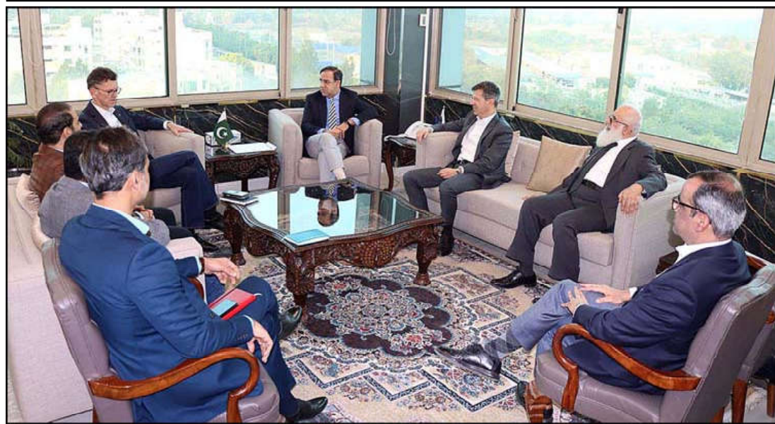
ISLAMABAD: Caretaker Federal Minister for IT and Telecommunication Dr. Umar Saif in a meeting with Telenor and Etisalat delegation.