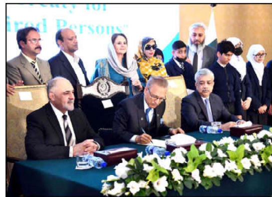
ISLAMABAD: President Dr Arif Alvi signing the Instrument of Accession to the Marrakesh Treaty for the Visually Impaired Persons in a ceremony, at Aiwan-e-Sadr.

Similarly, the Minister Information the security forces can't be demoralized by carrying such cowardly acts of terrorism. He also paid rich tributes to those embraced martyrdom in the terrorists' attack.