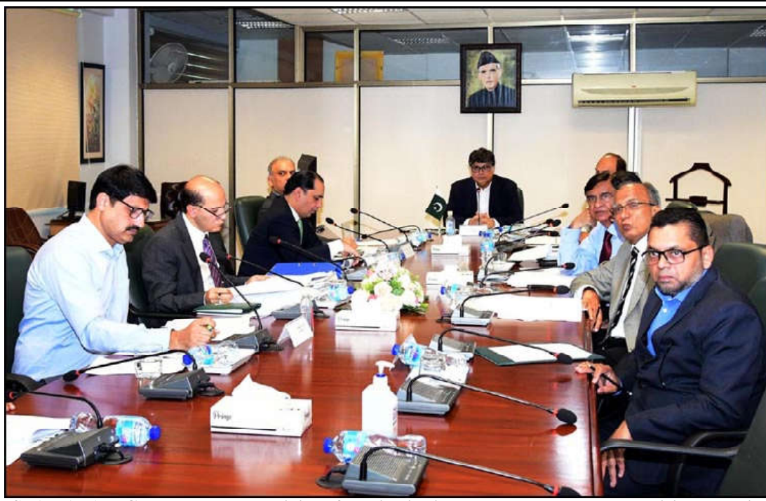
ISLAMABAD: Caretaker Federal Minister for Privatisation, Fawad Hassan Fawad chairing a meeting of the Privatisation Commission Board.

by 2.1 % on year on year basis in Q1-FY24 in comparison to 1.0 percent in the same quarter last year, the MPC noted. Recovery in the agriculture sector was the major driver of the growth while the manufacturing sector also recorded a moderate recovery, with growth in large-scale manufacturing becoming positive after contracting in the preceding four quarters, the committee viewed adding that, unlike the commodity-producing sector, growth in the services sector remained subdued. The MPC observed a significant improvement in the current account balance.