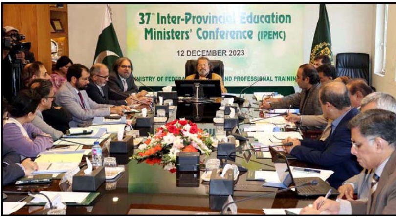
ISLAMABAD: Caretaker Minister for Federal Education and Professional Training, Madad Ali Sindhhi chaired the 37th Inter-Provincial Education Ministers Conference (IPEMC) in Islamabad.