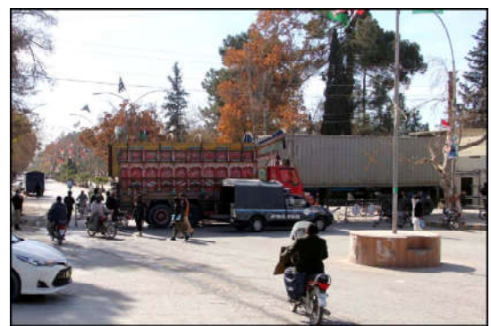
QUETTA: Containers have been placed to closed the redzone area after the family of Balach, who was allegedly killed during the CTD operation, reached Quetta on foot from Turbat Kech for sit-in in the Red Zone area of Quetta until the arrest of the CTD officials, while demanding the formation of a judicial commission for an independent inquiry into CTD's action, in Quetta.

Signed in Morocco on June 27, 2013, and joined by a large number of countries in the world, the Treaty enables the reproduction of published materials into accessible formats, such as braille, large print, and audio editions.