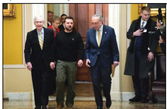
Ukrainian President Volodymyr Zelenskyy walks next to U.S. Senate Majority Leader Chuck Schumer (D-NY) and U.S. Senate Minority Leader Mitch McConnell (R-KY) as he arrives for a meeting with all U.S. senators at the Capitol in Washington, U.S.

Her death triggered major protests in Iran and a global movement known as "Woman, Life, Freedom", calling for the end of the Muslim cleric-led government in Tehran.