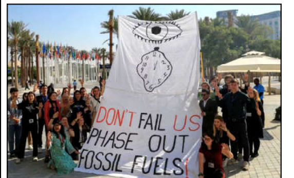
Climate activists attend a protest against fossil fuels at Dubai's Expo City during the United Nations Climate Change Conference COP28 in Dubai, United Arab Emirates.

Speaking after his arrival at Hanoi's airport, Xi said he would talk with Vietnamese leaders on "the overall, strategic, and directional issues of China-Vietnam relations, as well as international and regional issues of common concern, in order to push bilateral relations into a new stage", according to Chinese state media. Vietnam has long pursued a "bamboo diplomacy" approach, striving to stay on good terms with both China and the United States. It shares US concerns about Beijing's increasing assertiveness in the contested South China Sea, but it also has close economic ties with China.