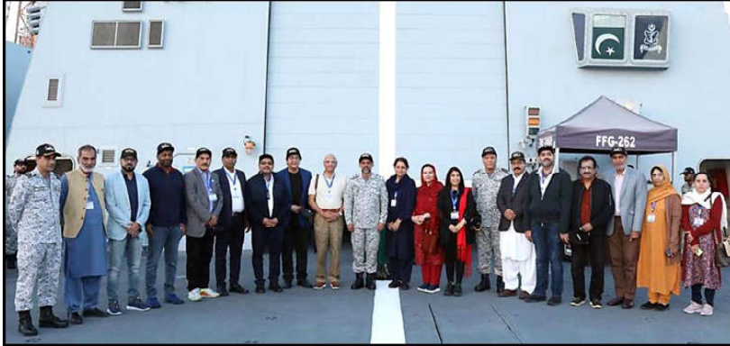
KARACHI: Group photo of 6 th Maritime Security Workshop participants on board PNS Taimur during visit.

Resilience Enhancement and Livelihood Diversification in Balochistan (Irrigation Infrastructure) worth Rs. 8250 Million, and Livelihood Interventions for integrated Flood Resilience and Adaptation Program (IFRAP) with the total cost of Rs. 11,360 Million. The Post-Flood 2022 Reconstruction Program emphasizing resilience enhancement and livelihood diversification in Balochistan (road infrastructure CW&PPHD), with a total cost of Rs. 13,809.544 Million, was recommended to ECNEC. This project, funded by the World Bank, aims to strengthen transportation infrastructure by constructing resilient roads and bridges, significantly reducing travel time for the residents.