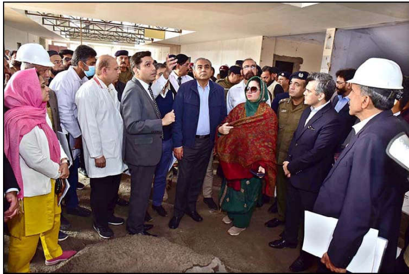
FAISALABAD: Chief Minister Punjab, Syed Mohsin Raza Naqvi is visiting the Allied Hospital Faisalabad to inspect ongoing upgradation projects of Surgical Emergency and OPD Wards.

The focus on cardiology facilities extends to Multan and Sialkot as well.