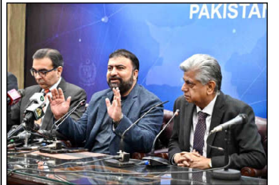
ISLAMABAD: Caretaker Federal Minister for Information and Broadcasting Murtaza Solangi, Caretaker Interior Minister Sarfraz Ahmed Bugti and Caretaker Federal Minister for Petroleum Muhammad Ali addressing a press conference at PID Media Center.

He also prayed that may Allah Almighty give enough strength and patience to the bereaved families to bear the tragic loss of their dear ones.