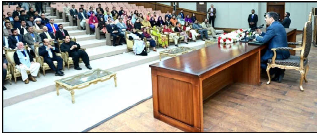
ISLAMABAD: The Caretaker Prime Minister Anwaar-ul-Haq Kakar addresses the 12th National Balochistan Workshop.

To a question, he said taxation was one of the biggest challenges for the country as 80% of the economy was undocumented with the informal private sector being a non-contributor but beneficiary of the government's initiatives and facilities. Besides, the formal private sector feels resentful of undue taxation, he added