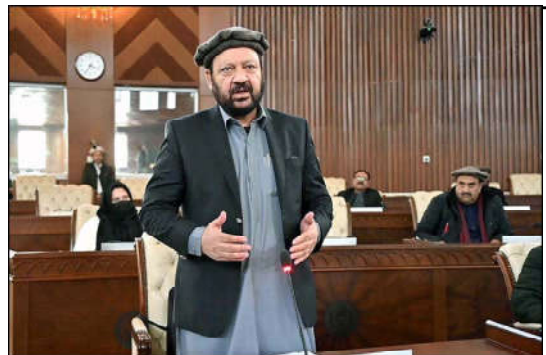
GILGIT: Chief Minister Gilgit-Baltistan, Haji Gulbar Khan addressing during the 5th sitting of the 27th session of Gilgit-Baltistan Assembly under the chair of Speaker Gilgit-Baltistan Assembly Nazir Ahmad Advocate.