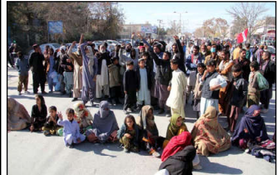
QUETTA: Residents of Sariyab road are holding protest demonstration against low pressure of sui gas in their area, outside Sui Gas Office in Quetta.

In this regard, during the last three months, QESCO teams carried out operations in all operation circles across the province, including the provincial capital Quetta. Similarly, FIRs have also been registered in various police stations against 492 electricity thieves. In addition, 69 lakh 12 thousand 247 electricity units were charged as fines for detection during the action against illegal electricity users by QESCO teams, of which it has received about 30 crore rupees so far.