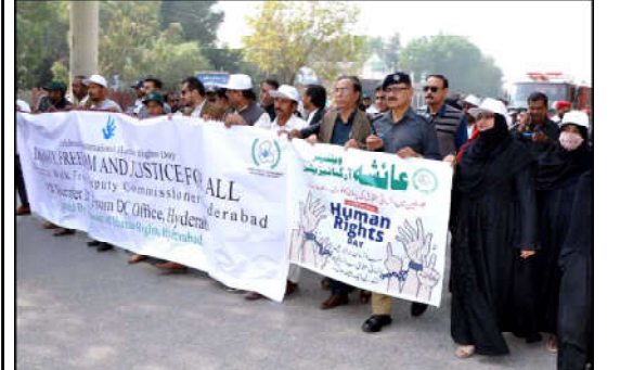
HYDERABAD: Participants are holding awareness walk on the eve of International Human Rights Day organized by Directorate of Human Rights Hyderabad, in Hyderabad.