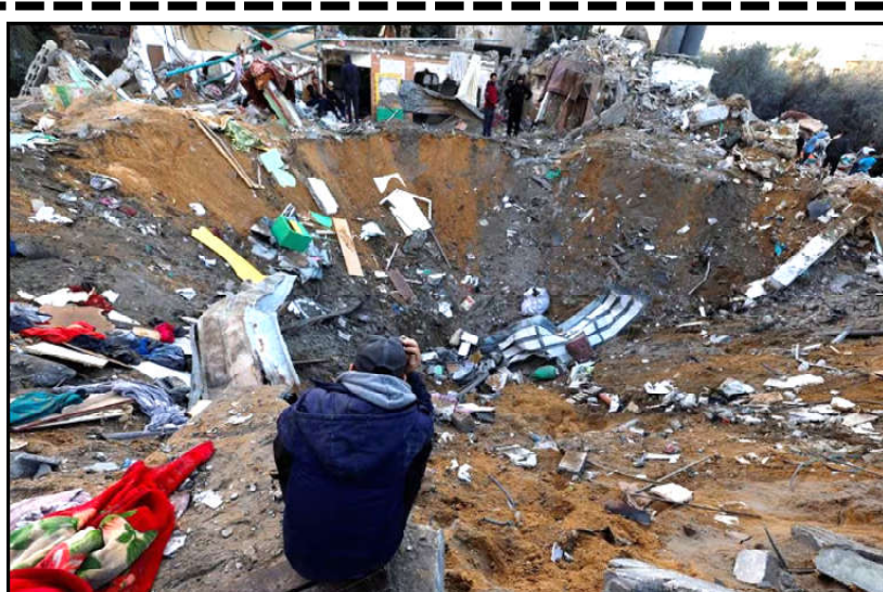
A Palestinian looks on at the site of Israeli strikes on houses amid the ongoing conflict between Israel and the Palestinian Islamist group Hamas, in Rafah in the southern Gaza Strip.

Some security analysts say nuclear weapons have assumed greater importance in Putin's thinking and rhetoric as his conventional forces have struggled in Ukraine and as Western countries have weakened themselves off Russian energy, weakening his ability to exert pressure by cutting off oil and gas.