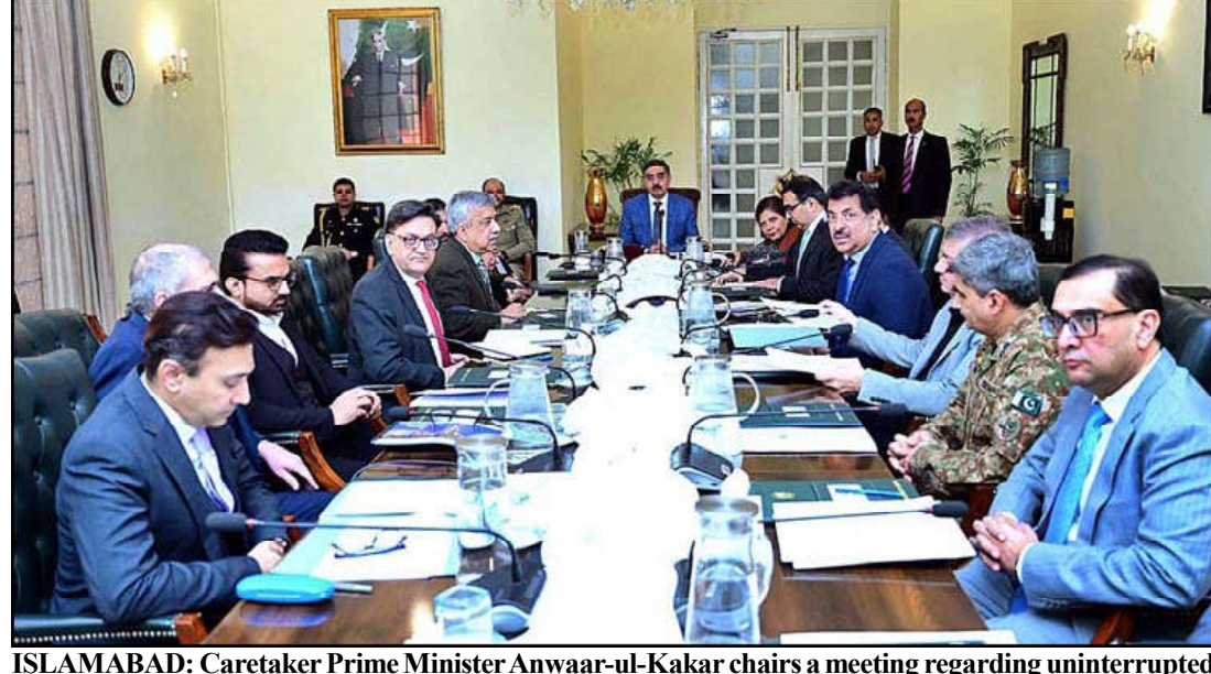
ISLAMABAD: Caretaker Prime Minister Anwaar-ul-Kakar chairs a meeting regarding uninterrupted supply of Urea fertilizer to the farmers on Government control rate.