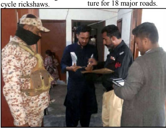
KARACHI: Police officials carry out the combing search operation against criminals as security has been tightened in city due to security reasons at different areas of Lyari area in Karachi.

be prepared in Urdu. The meeting also sanctioned the permanent fortification of the infrastructure for 18 major roads.