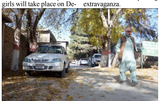
QUETTA: A view of dry leaves scattered on the ground during cold and dry weather in the city.

ary Education, outlined the The culmination of the event will see the disschedule for the trials. The athletics trials for both tribution of prizes among boys and girls are slated for the victorious players, add-December 13 at Ayub Staing a competitive edge and dium. Following this, table celebratory spirit to the tennis trials for boys and conclusion of this sporting extravaganza