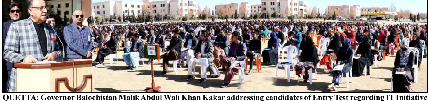
Program at BUITEMS