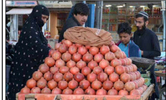
QURTTA: A women buying seasonal fruit Pomegran from a roadside vendor.

Rs.1200, Afghani Rewari fruits seller at Karachi for Rs. 1200 and Cashews Company, said the price of for Rs. 3600.