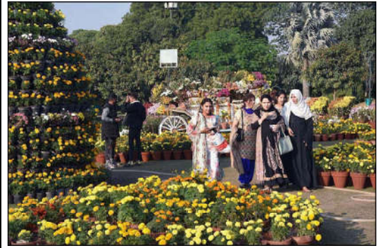
LAHORE: People visit and enjoying flower show at Race Course Jillani Park.