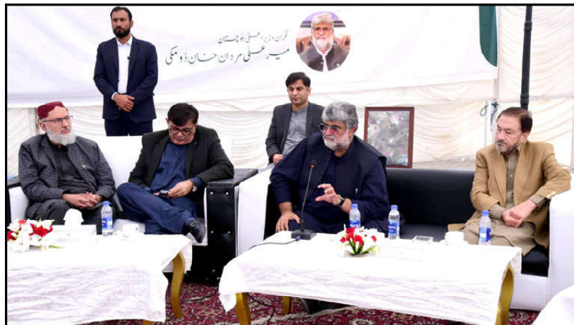
QUETTA: Caretaker Chief Minister Balochistan Mir Ali Mardan Khan Domki expressing his views at Grand Jirga regarding peace and reconciliation process in the province