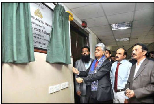
MULTAN: Caretaker Federal Minister for Information, Broadcasting and Parliamentary Affairs Murtaza Solangi unveiling plaque to inaugurate the PTV National Multan 24/7 transmission at PTV Centre.