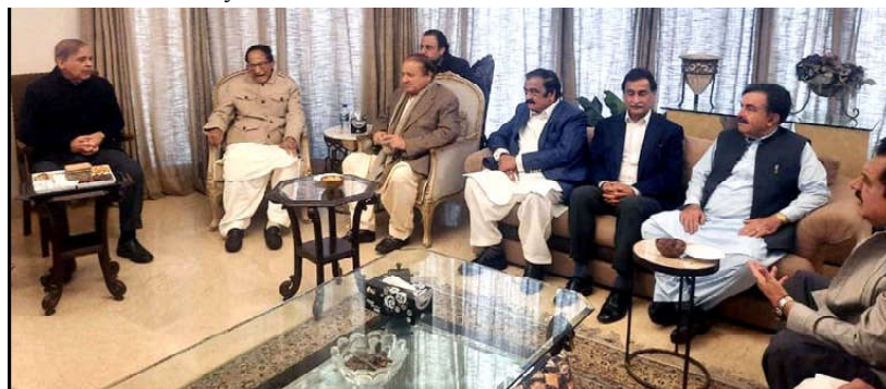
LAHORE: Muslim League (PML-N) President, Nawaz Sharif along with Shahbaz Sharif, Maryam Nawaz and others exchanges views with Muslim League-Quaid (PML-Q) President, Chaudhry Shujaat during meeting to discuss electoral alliance and seat adjustments on Gujrat seats, in Lahore.

Faez Isa will hear the presidential reference. It is pertinent to mention here former president Asif Ali Zardari had filed presidential reference in SC in 2011. 6 hearing of the reference have taken place so far. First hearing was held on January 02, 2012. First five hearings of presidential reference were conducted by 11-member larger bench of SC under former Chief Justice of Pakistan (CJP) Iftikhar Muhammad Chaudhry. The last hearing of the case was conducted by larger bench.