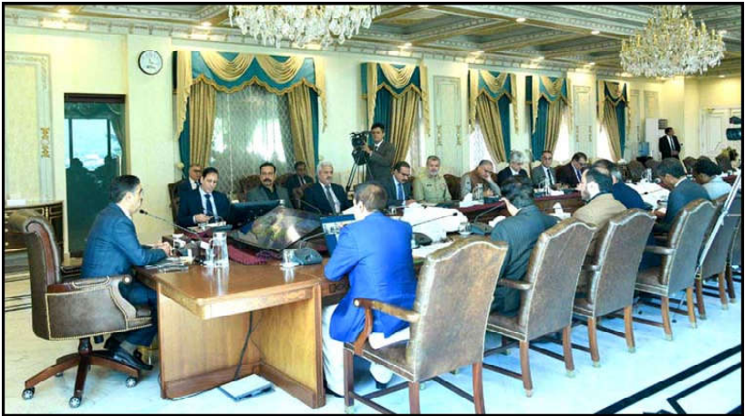
ISLAMABAD: Caretaker Prime Minister Anwaar-ul-Haq Kakar chairs a meeting on Task Force of Polio Eradication.

and his exclusion from the electoral process, the prime minister termed it a political analysis. However, the elections would judge the popularity of any political leader, he commented. To a question about the participation of Imran Khan or his party in the general elections, he that there was no restriction on him as yet. "However, if something unusual comes up, I can't say anything about it. As of today, they are in a position to contest elections and they will contest." About the disappearances and resurfacing of PTI leaders, the prime minister said such people went into hiding, fearing arrest for their involvement in attacks on state institutions on May 9.