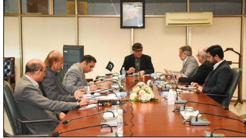
ISLAMABAD: The Caretaker Federal Minister for Privatization Mr Fawad Hasan Fawad chairing a meeting of Privatization Commission with the Financial Advisor and management of First Women Bank Limited.