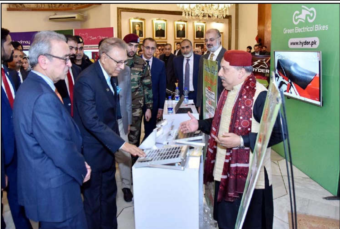
President Dr. Arif Alvi being briefed about innovative technological startups and their products, at the Angels Investors Summit & Startup Showcase held at Aiwan-e-Sadr, Islamabad.

He lauded the 'tremendous' innovative ideas of the startups who also gave presentations on their products which are gradually getting recognition in the market. The president suggested the summit organizers to record detailed video messages of the startups so that they could better explain their products to the people as well as the potential investors.