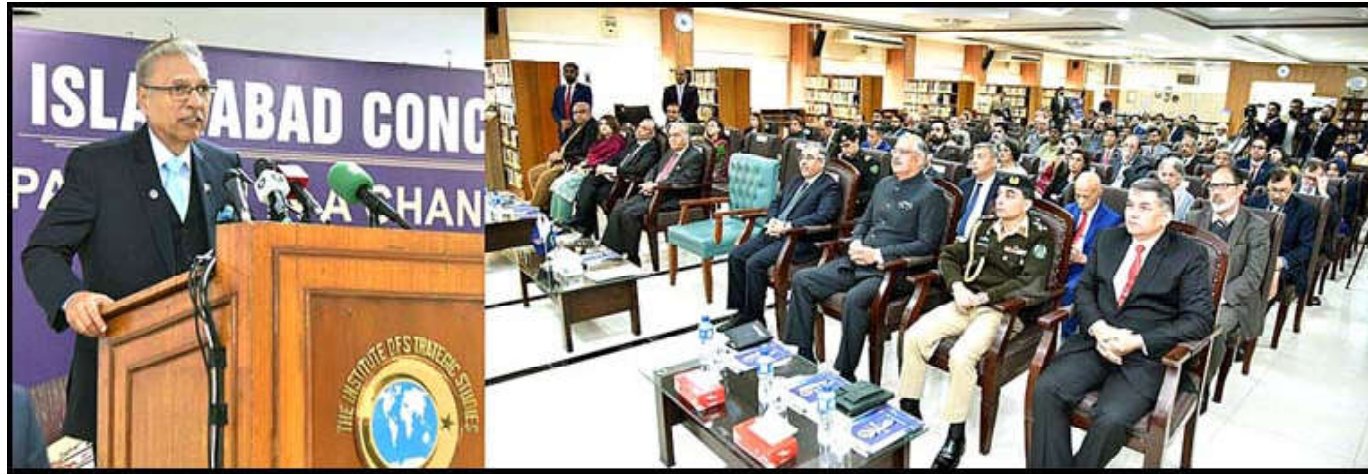
ISLAMABAD: President Dr Arif Alvi addressing the inaugural session of the Islamabad Conclave 2023 titled "Pakistan in a changing world", at the Institute of Strategic Studies.

Ph: 2841470/2841473 Vol: XVIII No. 330, Jamadi-ul-Awwal 22, 1445 AH Thursday December 07, 2023, Pages 08, Price Rs.15