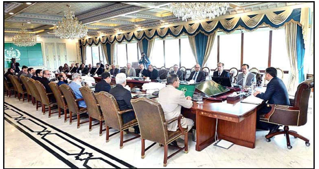
ISLAMABAD: Caretaker Prime Minister Anwaar-ul-Haq Kakar chairs a meeting of the Taskforce for Strategic Reforms in Medical Education and Patient Care

The prime minister was talking to the Spiritual leader of the Dawoodi Bohra community, Dr Syedna Mufaddal Saifuddin who led an eight-member delegation here at the PM House. PM Kakar felicitated Dr Saifuddin on being awarded the Nishan-e-Pakistan in recognition to his services for the country.