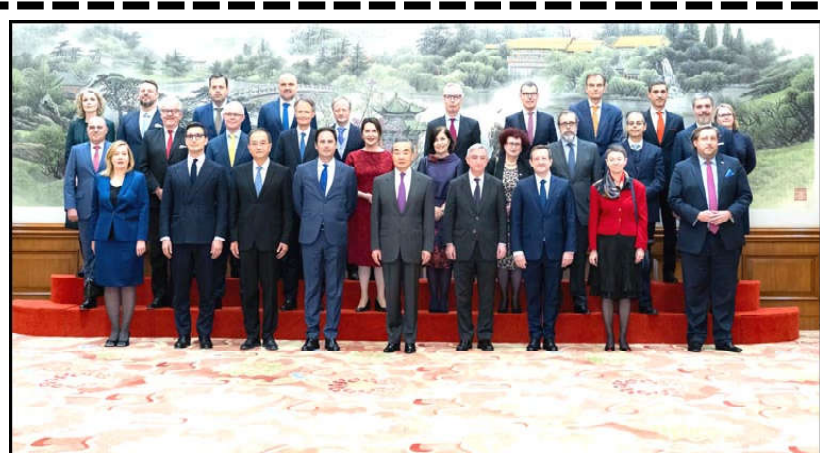
BEIJING: Chinese Foreign Minister Wang Yi in a group photo with Ambassadors of European Union and its member countries.