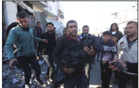
GAZA: A man carrying dead body of a child who martyred during Israeli attack.

The company later reported that services in the central and southern regions of the enclave were gradually being restored "after being cut off from the Israeli side."