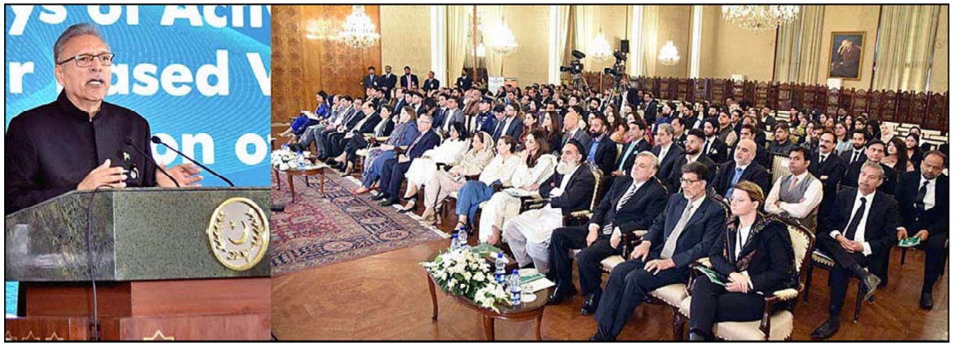
ISLAMABAD: President Dr. Arif Alvi addressing an awareness event "16 Days of Activism against Gender-Based Violence and Harassment of Women" organized by the Federal Ombudsman Secretariat for Protection Against Harassment (FOSPAAH).

She said since its establishment, FOSPAAH dealt with 8,000 cases of women's harassment and property matters and provided speedy justice to aggrieved persons.