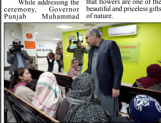
LAHORE: Caretaker Chief Minister Punjab Mohsin Naqvi enquiring about medical facilities from mother of under treatment children at Children Emergency during his visit to Mayo Hospital.