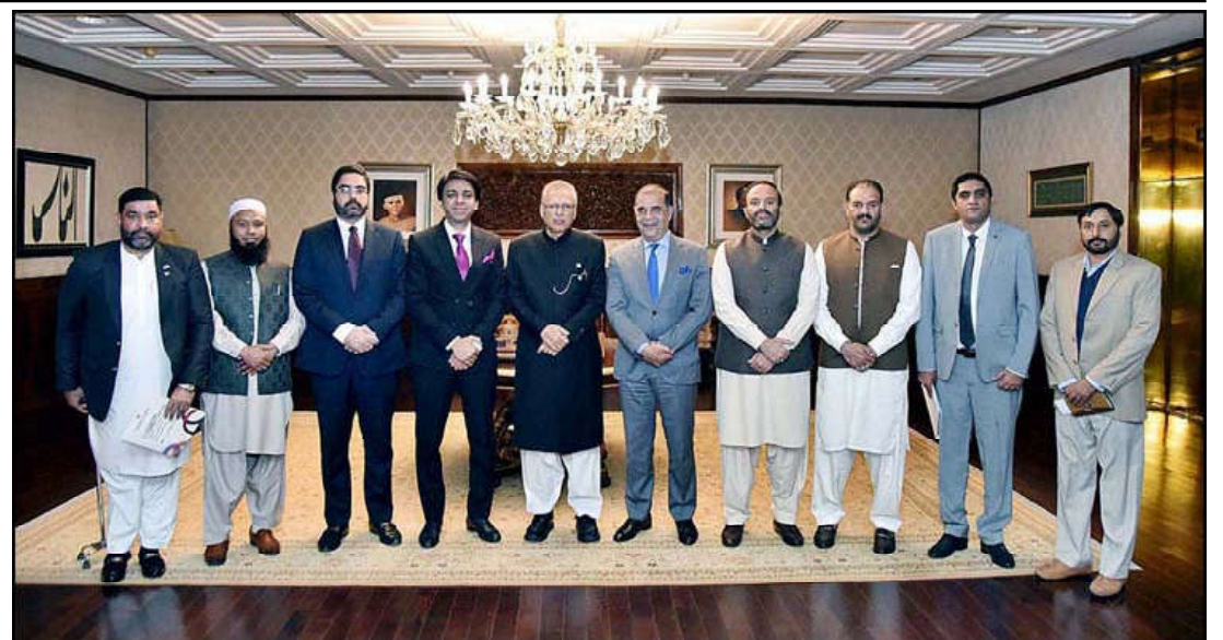
ISLAMABAD: President Dr. Arif Alvi in a group photo with a delegation of Rawalpindi Chamber of Commerce and Industry, who called on him, at Aiwan-e-Sadr.

respective areas as provided in the National Electricity Policy, an objective-oriented National Electricity (NE) Plan has recently been approved by the CCoE in August 2023. The NE Plan envisaged 20 priority areas of intervention including Integrated Energy Planning, System & Market Operations, Electrification, Tariff Design and Subsidy Rationalization. Among the new initiatives being undertaken in the Power Sector.