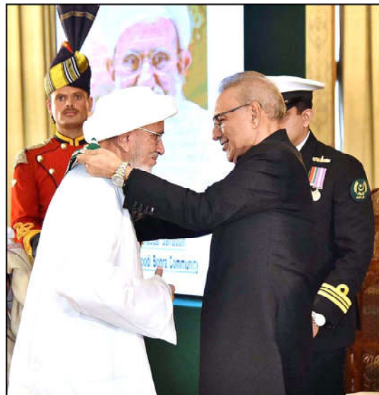
ISLAMABAD: President Dr. Arif Alvi conferring the award of Nishan-i-Pakistan upon Dr. Syedna Mufaddal Saifuddin, Head of the Dawoodi Bohra community at a special investiture ceremony held at Aiwan-e-Sadr.