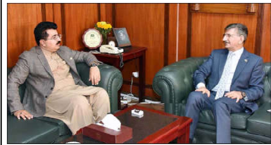
Chairman Sanjrani said that the ties between Pakistan and Iraq were rooted in religion, brotherhood, Islamic culture, and mutual respect, highlighting shared values.

He also praised Pakistan's efforts towards unity in the Muslim world.