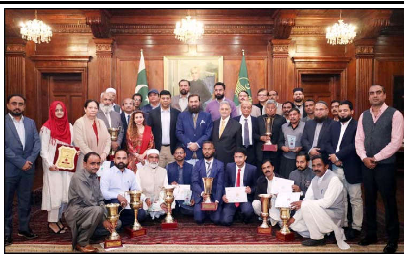
LAHORE: Governor Punjab Muhammad Balighur Rehman in a group photo with position holders of Flower Show organized by Horticulture Society of Pakistan at Jilani Park.