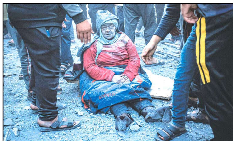
RAFAH: An elderly woman, injured in an Israeli strike, appears to be in shock as she sits amid the rubble of her bombed-out building in the southern Gaza Strip.

Unlike most of its Western allies and some Gulf states, NATO member Turkey does not view Hamas as a terrorist group and hosts some of its members. Erdogan, whose ruling party has Islamist roots, said a so-called contact group of Muslim countries, which was formed by the OIC and Arab League last month to hold talks on Gaza with Western countries and others, would continue discussions until the fighting in Gaza stopped, but added more must be done.