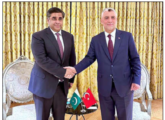
ISLAMABAD: Caretaker Minister of Commerce and Industries, Dr. Gohar Ejaz meeting the Turkish Trade Minister H.E. Dr. Omer Bolat on the sidelines of the 39th Ministerial of COMCEC.

Under the accompanying Measures support to the "Promotion of Renewable Energies and Energy Efficiency" program, KfW, representing the German Government, will provide an additional grant of Euro 2.5 million to the National Transmission and Despatch Company (NTDC). This funding will assist NTDC in ensuring the effective operation and maintenance of installations, incorporating robust environmental and social management systems.