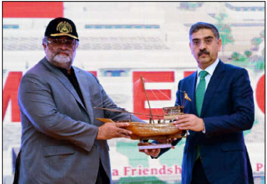
GWADAR: Caretaker Chief Minister Balochistan Mir Ali Mardan Khan Domki presenting souvenir to Caretaker Prime Minister Anwarul Haq Kakar.