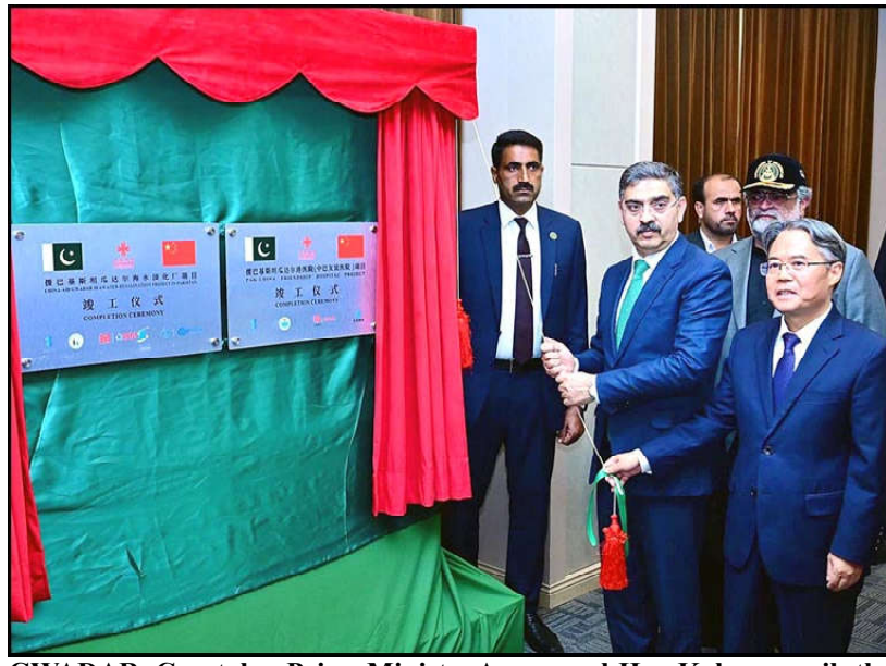
GWADAR: Caretaker Prime Minister Anwaar-ul-Haq Kakar unveils the plaques to inaugurate the completed Pak-China Friendship Hospital Project and the China-Aid Gwadar Seawater Desalination Project.

He recalled that the precious forests had been destroyed due to the fire broken out in the forests located in the same area last year.