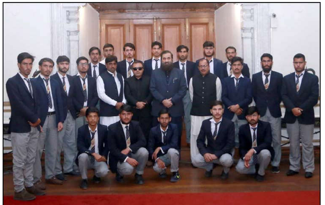
LAHORE: Governor Punjab Muhammad Balighur Rahman in a group photo with delegation of students and teachers of Balochistan Residential College Zhob and Cadet College Hasan Abdal called on at Governor House.

Balochistan were also included in the laptop scheme so that the students of Balochistan can be brought at par with other provinces of the country in the field of education. He said that the country can progress only with the supremacy of merit. Governor Punjab said that continuity of policies is very important for development in other sectors including education.