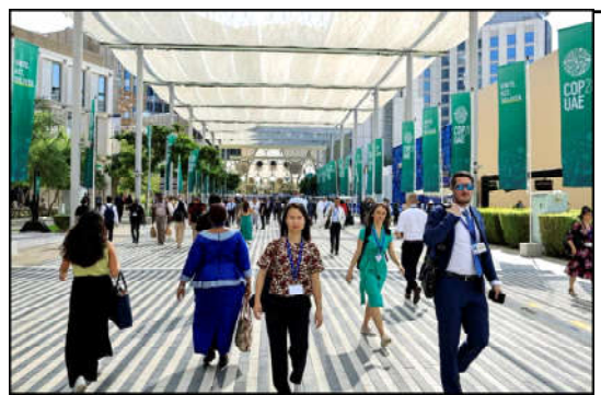
Delegates walk at the Dubai's Expo City during the United Nations Climate Change Conference (COP28) in Dubai, United Arab Emirates.

Hospitals in the southern Gaza Strip have descended into chaos since the resumption of hostilities, and WHO chief Tedros Adhanom Ghebreyesus said that some patients there were being treated on the floor, in conditions "unimaginable for the provision of health care".