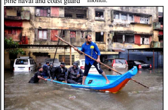
People move in a boat past partially submerged vehicles in a residential area following heavy rains ahead of Cyclone Michaung in Chennai, India.

Dwarfed by China's military might, the Philippines has sought America's help in its multiple territorial disputes with China in the South China Sea. President Ferdinand Marcos Jr. agreed to an expansion of the U.S. military presence in the country early this year and launched joint sea and air patrols with the United States late last month.