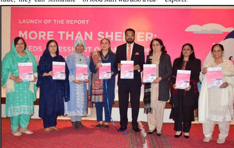
QUETTA: Former Senator Roshan Khursheed Bharucha, Chairperson NCHR Rabia Jaweria Agha showing report on conditions of shelter homes for women from National Commission for Human Rights and UN Women to Caretaker Federal Minister Khalil George.

son which led to food crises and it could be ended if priorities across the globe were set, adding that only $1 trillion could be suffice to address the food scarcity in the world. Contrary to it, the Islamic teachings had made the wealth a source for channeling the uplift of entire community, leading to well being of the human beings, he added. The president also stressed upon measures to water conservation in the agri-sector, particularly during the rice cultivation as it was a water intensive crop. Besides, value addition products based upon rice crop, the exporters could increase Basmati outreach to different parts of the world, he said, and lauded REAP for projecting the soft image of Pakistan and promoting their culture, industry and livelihood. He said that certain things in the agriculture sector were possible and doable and expressed the optimism that the country would soon rise economically. Earlier, Chairman REAP, Chela Ram Kelwani, in his address, highlighted the contribution of the association in the country's exports.