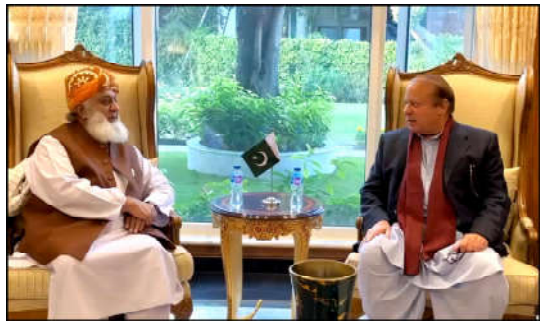
LAHORE: Chief of Jamiat Ulema-e-Islam (F) Maulana Fazlur Rehman meeting with PML-N Quaid Nawaz Sharif.

Responding to the ECP's request, IGPs from all the provinces and the capital said that they did not have enough personnel. Around 4,500 were short in Islamabad, 169,110 Punjab, 56,717 Khyber Pakhtunkhwa, 33,462 Sindh, and 13,769 in Balochistan — totalling 277,588.