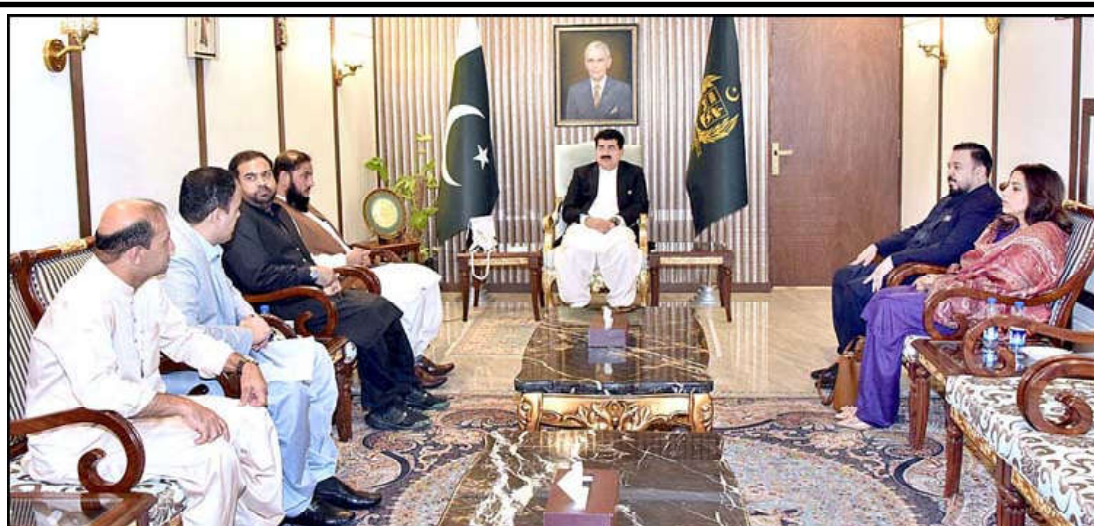
ISLAMABAD: A delegation of Gwadar Chamber of Commerce and Industries (GCCI) calling on Chairman Senate, Muhammad Sadiq Sanjrani, at the Parliament House.

increased by 19.57 percent by going up from $2,729 million last year to $3,263 million during the first four months of current fiscal year. Based on the figures, the services' trade deficit increased by 116.66 percent during the period under review by going up from $390 million last year to $847 million this year. Meanwhile, on year on year (YoY) basis, the services' exports from the country increased by 5.63 percent by going up from $621.07 million in October.