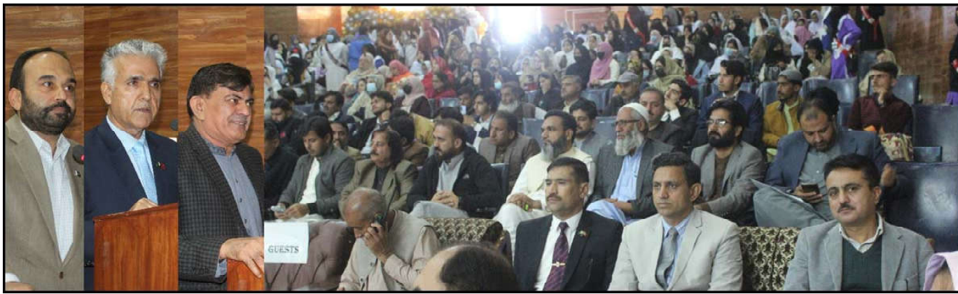
QUETTA: Caretaker Provincial Minister for Education Qadir Bakhsh Baloch, DG NAB Zafar Iqbal Khan and other participants addressing at ceremony of speech competition about anti-corruption