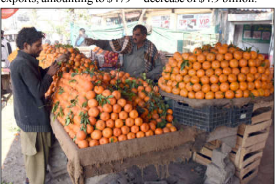
ISLAMABAD: A vendor is selling seasonal fruit Oranges at Khana Bridge to earn daily wages for the livelihood of his family.