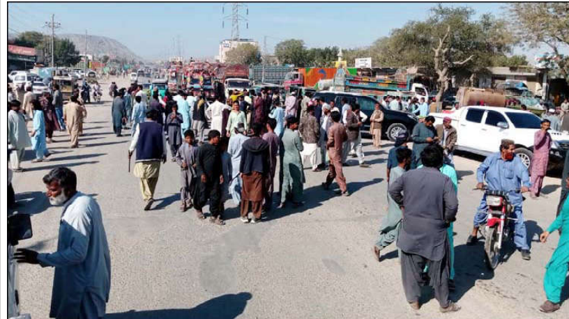
HUB: Members of Civil Society are holding protest demonstration for the establishment of local committee, outside Civic Center building.

from the country was the mission of Shaheed Mohtarma Benazir Bhutto and the completion of this mission was top priority of the Pakistan Peoples Party (PPP). Asif Zardari said that the martyred party chairperson was neither afraid of dictators nor did she fear the extremists. Her bravery was the legacy of the leadership and workers of Pakistan Peoples Party, he added. He said that the time was not far away when Shaheed Mohtarma Benazir Bhutto's Pakistan will be the realization of a Pakistan free of political, social and economic exploitation.