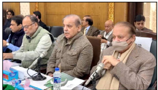
LAHORE: PML-N Quaid Muhammad Nawaz Sharif and President Muhammad Shabbaz Sharif presiding over 16th meeting of Parliamentary Board.

He also stressed upon greater collaboration between Indian Ocean countries to exploit potentials of blue economy.