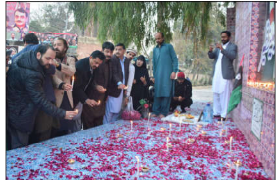
RAWALPINDI: Workers of Pakistan Peoples Party light up the candles in memorandum of Former Prime Minister Benazir Bhutto (Shaheed), at her targeting place, Liaquat Bagh in City.

stalwarts of Pakistan Peoples Party (PPP), Pakistan Muslim League-N (PML-N), Awami National Party (ANP), Jamiatul Ulema Islam-F (JUI-F), Jamaat Islami Pakistan and Pakistan Tehrik e Insaaf (PTI) have mostly fielded political heavyweights to clinch maximum seats from Khyber Pakhtunkhwa and form government for next five years. On NA-28 Peshawar-I, a total of 33 candidates filed papers including former member national assembly, Noor Alam Khan of JUI-F, former minister KP, Taimur Salim Jhagra of PTI and ex-speaker KP assembly.