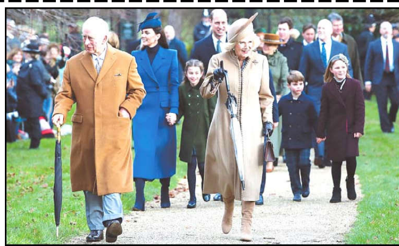
King Charles, Queen Camilla, Prince William, Princess Catherine, Princes George and Louis, and Princess Charlotte, arrive at St Mary Magdalene's church to attend the royal family's Christmas service.

each other elsewhere in the region. Since Hamas made the deadliest Palestinian militant attack on Israel in the country's 75-year history, Netanyahu has responded with an all-out assault on Hamas-ruled Gaza. On Tuesday, the Israeli military said 160 soldiers have so far been killed in Gaza since ground operations began on Oct 20. "Seventy-five years of suffering, our rights taken, our country seized, and our people slaughtered.