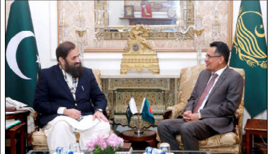
LAHORE: Bangladesh High Commissioner in Pakistan Ruhul Alam Siddique meeting with Punjab Governor Muhammad Balighur-ur-Rehman.

entire route, including the construction of bridges. In response, the CM issued directives for the expeditious completion of the project. During a meeting at the FWO (Frontier Works Organisation) camp office chaired by Chief Minister Mohsin Naqvi, Colonel Jamal and Colonel Ahmed provided a detailed briefing on the project's progress. The meeting addressed various issues related to the project. Chief Minister Mohsin Naqvi emphasized that the completion of Ring Road Southern Loop 3 would enhance transportation facilities for the public.