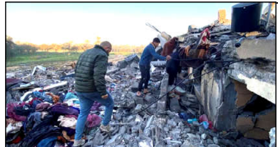
Palestinians inspect the site of an Israeli strike on a house, amid the ongoing conflict between Israel and Hamas, in Khan Younis in the southern Gaza Strip.

strikes in a call with Austin and other national security officials after ordering the Defense Department to prepare a response, the statement said. Biden "places no higher priority than the protection of American personnel serving in harm's way. The United States will act at a time and in a manner of our choosing should these attacks continue," the statement added. The drone attack was claimed by the Islamic Resistance in Iraq, a loose formation of armed groups affiliated with the Hashed al-Shaabi coalition of former paramilitaries that are now integrated into Iraq's regular armed forces.