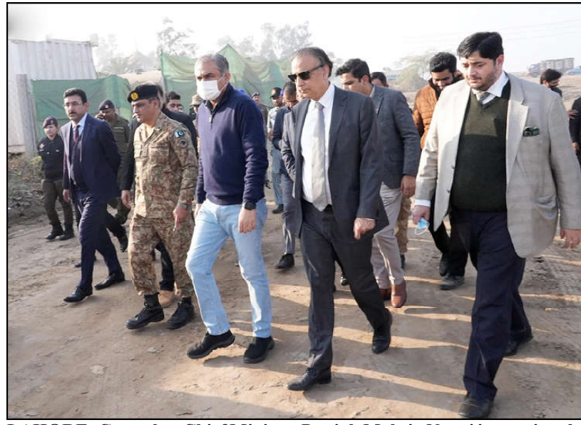
LAHORE: Caretaker Chief Minister Punjab Mohsin Naqvi inspecting the under construction work of Lahore Ring Road Southern Loop-III Project.

translated into even stronger economic, trade, investment, educational, and cultural linkages to the benefit of both nations. He said it is heartening to know that Pakistani medical and dental students are studying in Bangladesh on scholarships. He said that there should be maximum exchange of student delegations in the educational institutions of the two countries. He said that he would also talk to the Higher Education Commission for scholarships for Bangladeshi students in Pakistani educational institutions.