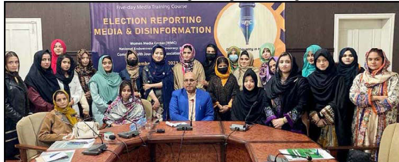
QUETTA: Caretaker Information Minister Jan Achakzai photographed with participants of a workshop organized by Women Media Center

Murtaza Solangi said that Senators have the right to criticize the decisions and policies made by the previous government regarding the provision of bulletproof vehicles to ministers and advisors.