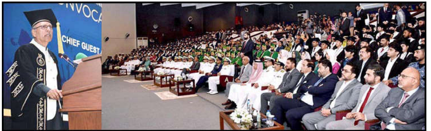
KARACHI: President of Pakistan, Dr. Arif Alvi addressing the Pakistan Navy Engineering College (PNEC) Convocation 2023.

Further, he highlighted the achievements of students in various events held at national and international levels. He highlighted the opportunities provided to the students at different forums in order to groom and nurture the young engineers. The ceremony was attended by a large number of military and civil dignitaries and parents of graduating students.