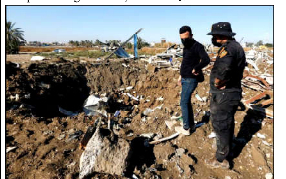
A fighter of the Iraqi Kataeb Hezbollah militia group and a man inspect the site of a U.S. airstrike, in Hilla, Iraq.