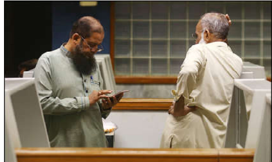
KARACHI: Stockbrokers monitor the share prices during a trading session at the Pakistan Stock Exchange (PSX) in Karachi, Pakistan, 26 December 2023. The Pakistani benchmark 100 index 59,170.97 was down 2534.12 with points during the trading session.