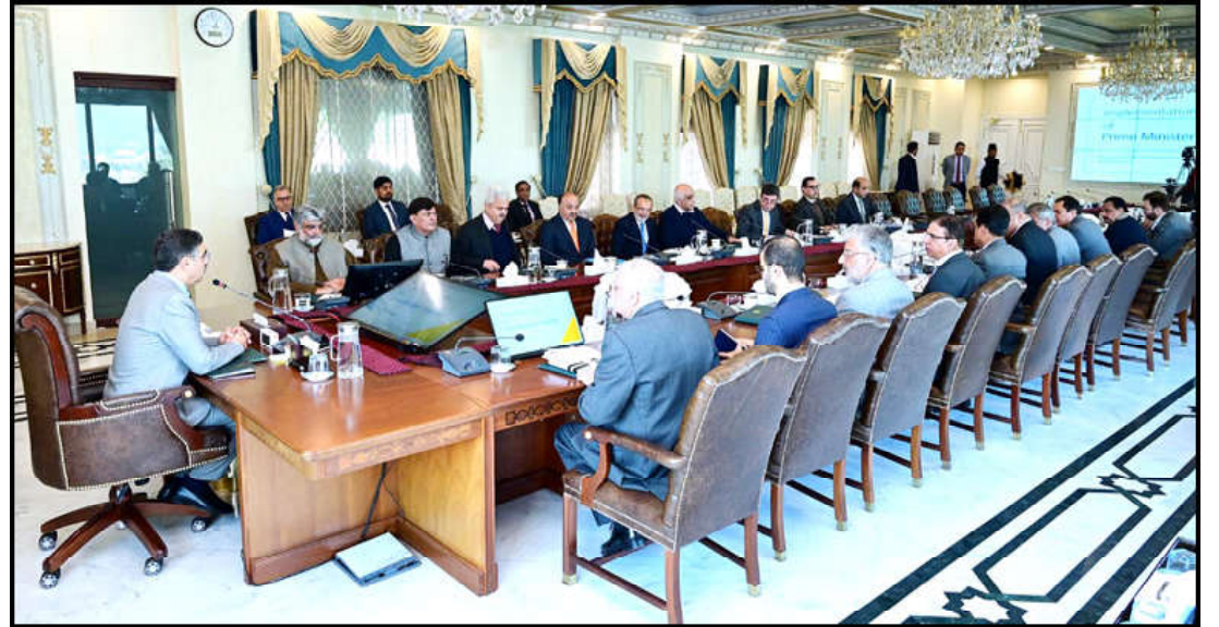
ISLAMABAD: Caretaker Prime Minister Anwaar-ul-Haq Kakar chairs a meeting on matters related to Balochistan.

The chief secretary gave a briefing over different projects of the province. The prime minister further directed for expediting the matters related to the construction of a two-lane highway from Khuzdar to Karachi and observed that with its construction, the different parts of the country would get an alternate leeway, besides strengthening of the linkages. He also asked for an immediate resolution of the financial issues faced by the universities in the province.