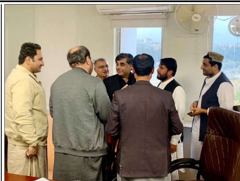
Caretaker Federal Minister of Commerce and Industry, Dr. Gohar Ejaz interacting with the members of the Chairman Chamber of Commerce and Industry at the Commerce Ministry in Islamabad.

The exchange rates of the Emirates Dirham and the Saudi Riyal decreased by 05 and 04 paise to close at Rs 76.88 and Rs75.27 respectively.