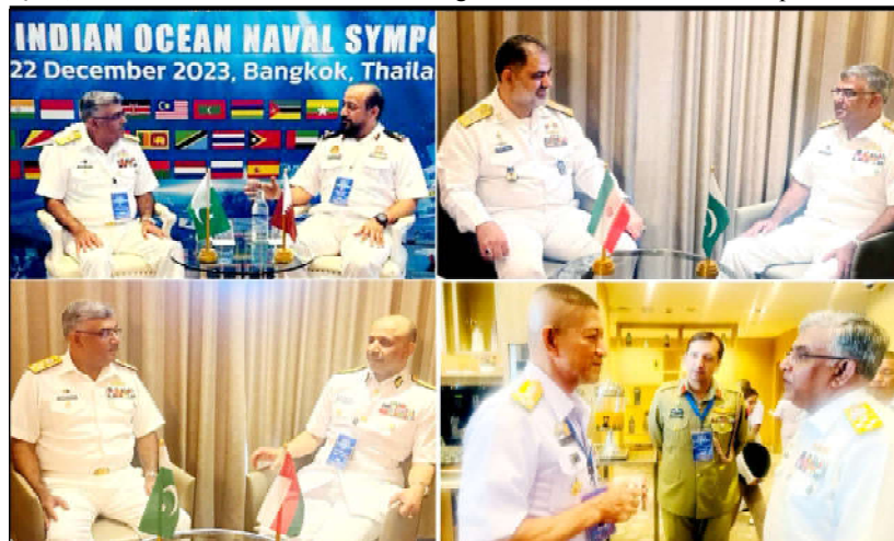
Chief of the Naval Staff Admiral Naveed Ashraf interacting with Heads of various Navies during 8th Indian Ocean Naval Symposium (IONS) in Bangkok, Thailand