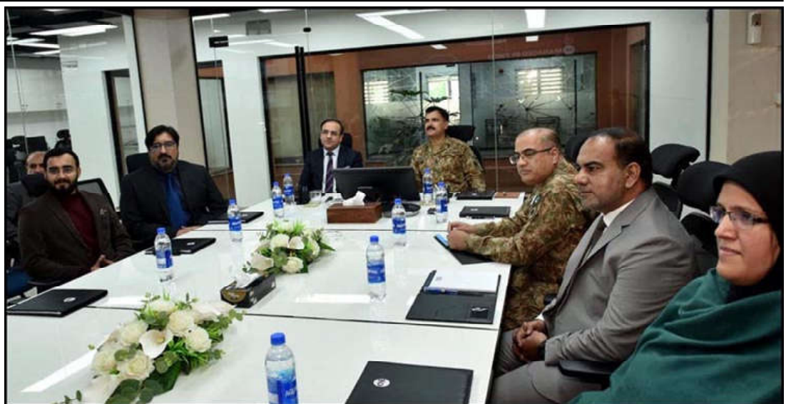
Caretaker Federal Minister for IT and Telecommunication, Dr. Umar Saif visited Frontier Works Organization (FWO) Headquarters in Rawalpindi.

In most cases, adequate performance is not possible. FTO Secretariat also comes to know that investigation reports and case studies of few cases of alleged tax evasion were prepared and shared by directorate related to Broadening of Tax Base (BTB).