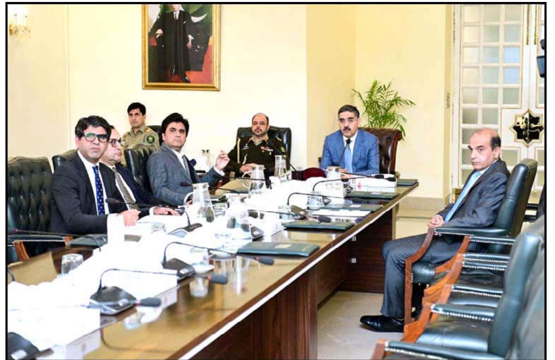
ISLAMABAD: Caretaker Prime Minister Anwaar-ul-Haq Kakar chairs a meeting on Prime Minister's Youth Program.

Independent Report QUETTA: The Governor Balochistan, Malik Abdul Wali Khan Kakar called the Inspector General of Police Islamabad and discussed about the matter of arrests of women and children belonging to Baloch Yekjehti Committee there in Islamabad on Thursday. Speaking to the IGP Islamabad, Governor stressed on finding peaceful solution to the issue immediately. The IGP Islamabad apprised the latest situation and informed that all the arrested women and children have been released. However, other protesters of BYC are in the police custody and would be produced in the court of law. It may be mentioned here that the Governor would proceed for Islamabad in this regard.