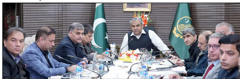
LAHORE: Caretaker Chief Minister Punjab Mohsin Naqvi presides over the special meeting to review progress on Roads Projects.

progress of Integrated Tourism Zones and the identification and development of new tourist destinations within the province. He emphasized ongoing efforts to enhance infrastructure, ensuring improved tourism facilities for visitors. He highlighted the commitment to the welfare of artists, announcing plans to revise the Artist Welfare Endowment Fund Act Rules. He stressed on more effectively on proposed amendments to address challenges faced by artists in the province.