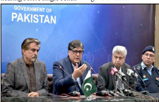
ISLAMABAD: Caretaker Federal Minister for Privatization & Federal Minister for Inter Provincial Coordination Fawad Hasan Fawad addressing a press conference along with Caretaker Federal Minister for Information and Broadcasting Murtaza Solangi and Caretaker Federal Minister for National Heritage & Culture Jamal Shah

ISLAMABAD (Online): Islamabad High Court (IHC) has issued notice to Attorney General (AG) and FIA on the petition filed by PTI founder Imran Khan against in-camera trial in cipher case. The court rejected the plea for immediate stopping the trial of cipher case. The case came up for hearing before single bench of IHC led by Justice Miangul Hassan Aurangzeb here Thursday. Justice Miangul Hassan Aurangzeb remarked we want to hear AG on this matter. Expressing his surprise over giving deadline of four weeks by Chief Justice (CJ) IHC for completion of trial of cipher case remarked we don't give four weeks time in general cases.