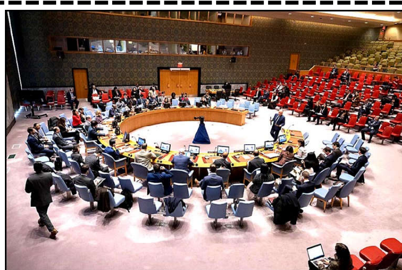
NEW YORK: A view of meeting of Security Council regarding Afghanistan at UN Office.

This suggests that new and preferably concessional sources of financing are needed, as well as greater private sector investment and carbon pricing or equivalent mechanism, it said. "A sharp global growth slowdown in the near term would affect India through trade and financial channels.