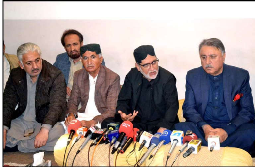
QUETTA: Balochistan National Party Chief, Sardar Akhtar Jan Mengal along with others addresses to media persons during press conference held in Quetta.