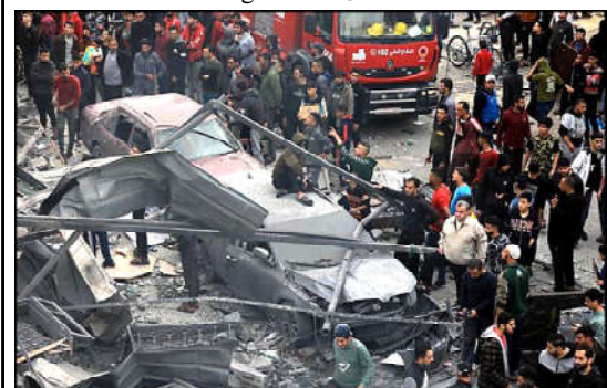
GAZA: People busy in relief activities after air strike by Israeli forces in Rafah.

Many have been enduring temperatures well below freezing in flimsier tent-like units with blue plastic sheeting on the outside and a quilted cotton lining inside.