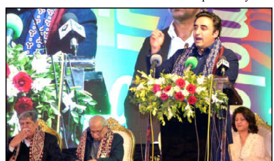
HYDERABAD: Pakistan Peoples Party (PPP) Chairman Bilawal Bhutto-Zardari speaking at 9th Ayaz Melo organised by Khanabadosh Writers Cafe in collaboration with Culture & Tourism Department Sindh at Sindh Museum.