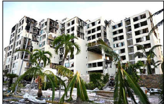
MEXICO: A view of damaged buildings due to Hurricane Otis made landfall near Acapulco.

According to the Red Crescent, intense shelling and sniper firing by the Israeli army is also ongoing in the area.