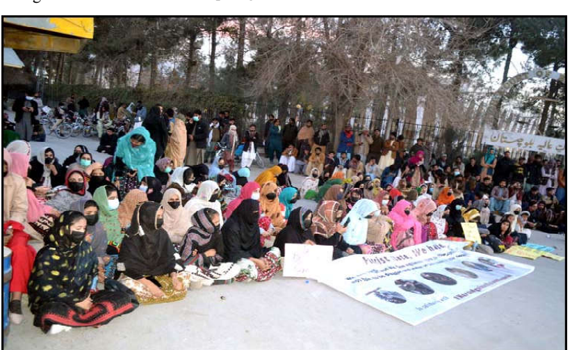
QUETTA: Members of Baloch Yakjehti Committee are holding protest rally for recovery of Baloch missing persons as soon as possible, held at Assembly Chowk in Quetta.

LAHORE (INP): Caretaker Prime Minister Anwaarul Haq Kakar opined on Thursday that individuals involved in the violent events of May 9 should not hold public office. In an interview with a private news channel, PM Kakar stated that no political party should be prevented from participating in electoral activities. "If any party is hindered, it constitutes an illegal act which must be investigated." PM Kakar further stated that a strong coordination existed between the caretaker government and the Election Commission of Pakistan (ECP) for holding transparent elections. He assured that the caretaker government would fulfill all responsibilities for fair elections in the country. Kakar also noted that the individuals involved in the violent events of May 9 were currently facing the law.