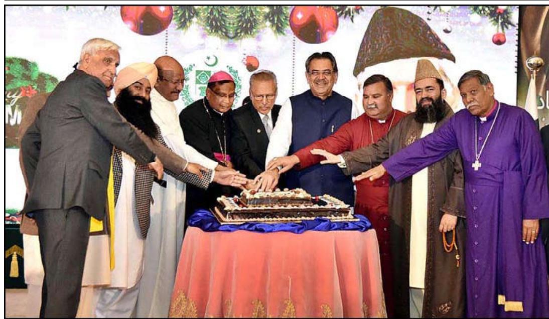
ISLAMABAD: President Dr. Arif Alvi cutting a cake at the Christmas Celebration Ceremony 2023 at Aiwan-e-Sadr.