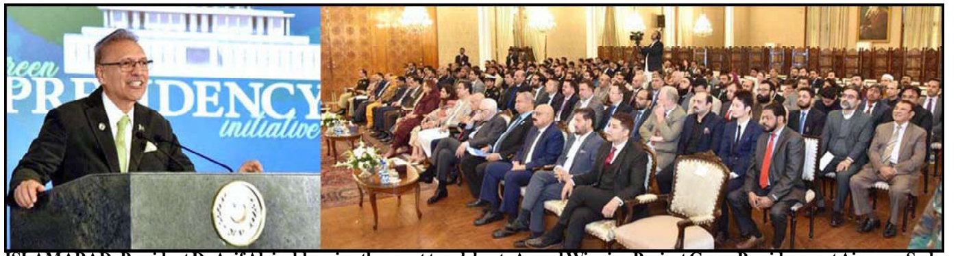
ISLAMABAD: President Dr Arif Alvi addressing the event to celebrate Award Winning Project Green Presidency, at Aiwan-e-Sadr.

He said the Prophet Muhammad (PBUH) had also taught for consuming the natural resources with utmost care by demonstrating the same in his life. The president pointed out that the world was witnessing a much-needed transition towards clean energy in the wake of climate change.