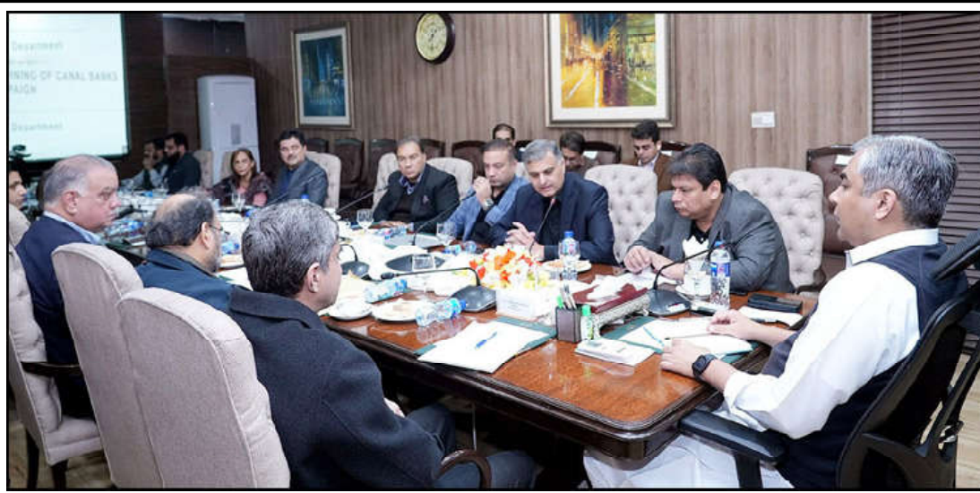
LAHORE: Caretaker Chief Minister Punjab Mohsin Naqvi chaired a special meeting in which approval for desilting 15300 miles long canals accorded.