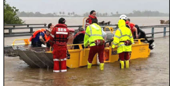
State Emergency Service personnel evacuating people from flood waters in far north Queensland, Australia following heavy rain and flooding from ex-tropical cyclone Jasper.

while warning that temperatures could fluctuate after one of the warmest Octobers in decades. On Monday in Guangdong, where snow is generally limited to the northernmost areas, snowfall blanketed the top of a mountain in a city just 80 km (50 miles) north of the provincial capital Guangzhou by the coast. A low of 8 degrees Celsius (46.4 Fahrenheit) was forecast for Guangzhou, compared to the province's typical early winter temperatures that hover in the double digits.