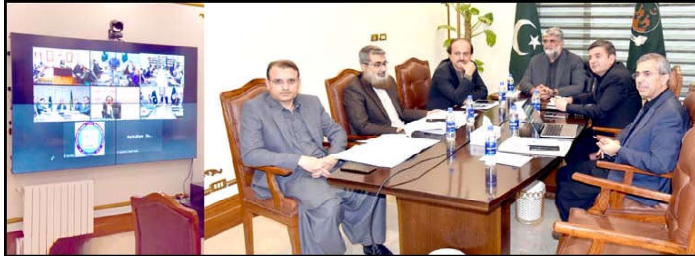
QUETTA: Caretaker Chief Minister Balochistan Mir Ali Mardan Khan Domki speaking through video link at the meeting held under chair of caretaker Federal Minister Finance, Shamshad Akhtar on the provincial financial matters in Islamabad

Ph: 2841470/2841473 Vol: XVI No. 197, Jamadi-us-Sani 05, 1445 AH Tuesday December 19, 2023, Pages 04, Price Rs.15