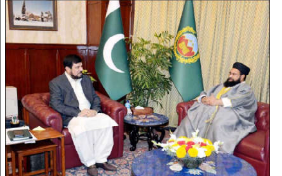
PESHAWAR: SAPM for Inter-Religious Harmony Maulana Tahir Ashrafi meeting with Khyber Pakhtunkhwa Governor Haji Ghulam Ali.