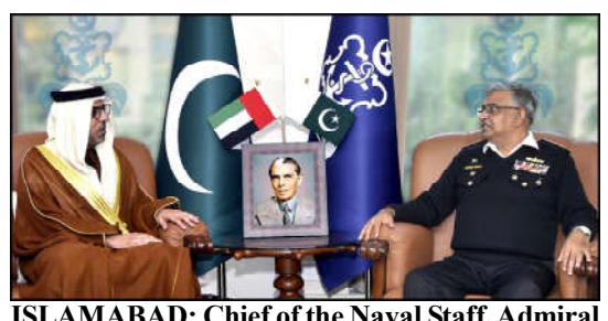
ISLAMABAD: Chief of the Naval Staff, Admiral Naveed Ashraf exchanging views with Ambassador of the United Arab Emirates to Pakistan Hamad Obaid Ibrahim Salem Al-Zaabi at Naval Headquarters.

ISLAMABAD (APP): The Election Commission of Pakistan (ECP) has unveiled the comprehensive data, outlining the total number of registered voters across the nation. The ECP conveyed that 53.87 percent of the country's voters are male, while 46.13 percent are female. The ECP's commitment to transparency is evident in this disclosure, providing citizens with accurate electoral information. According to the latest data, the total number of registered voters now exceeds 128.5 million.