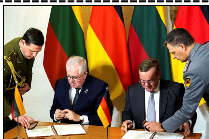
German Defence Minister Boris Pistorius and Lithuanian Defence Minister Arvydas Anuskauskas sign an agreement for further deployment of thousands of German troops to the Baltic country in Vilnius, Lithuania.

remain in north Gaza, after Israeli forces pushed most of the population to the south during the first days of the bombing campaign and ground war that began after the Oct. 7 Hamas attacks on Israel. Gaza health authorities under the Hamas government say that more than 50,000 Palestinians have been injured during the Israeli operation, and 19,000 killed. The WHO said "tens of thousands" of displaced people were using the Al Shifa hospital for shelter, describing severe shortages of safe water and food. Gaza is home to 2.3 million people, most of whom have been displaced from their homes by the offensive.