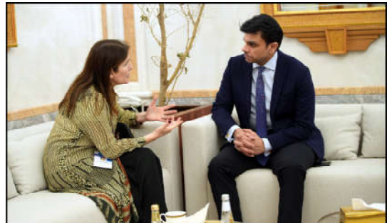
SAPM Jawad Sohrab Malik meets with President of the United Nations Economic and Social Council (ECOSOC) at Global Labour Market Conference (GLMC) in Riyadh, KSA.

Gohar Ejaz highly praised Changshu's achievements in economic and social development and expressed great anticipation for its future cooperation.