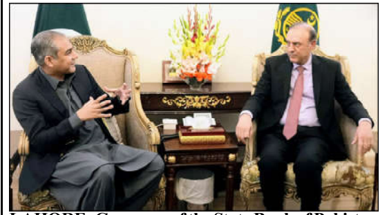
LAHORE: Governor of the State Bank of Pakistan (SBP) Jameel Ahmad called on Punjab Caretaker Chief Minister Mohsin Naqvi.

The CM also highlighted the significance of achieving record cotton production in Punjab, projecting substantial savings of two billion dollars in foreign exchange. The CM pointed out that the rice export from Punjab has exceeded two billion dollars as the provincial government is following a policy of providing comprehensive facilities to investors and industrialists, foreseeing positive ramifications in the form of a thriving stock exchange.