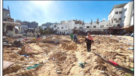
Bulldozer tracks are seen in the area where tents were erected outside the Kamal Adwan hospital by displaced people. Palestinian authorities have accused Israel of razing the area as people slept.

work of stability in a volatile region - an argument that has also proved effective with Gulf and Western allies providing financial support to his government. Voting in Egypt was held over three days on Dec. 10-12, with the state and tightly controlled domestic media pushing hard to boost turnout, which the election authority said had reached 66.8% - above the 41% recorded at the last presidential election in 2018. The election featured three other candidates, none of them high profile. The most prominent potential challenger halted his run in October, saying officials and thugs had targeted his supporters.