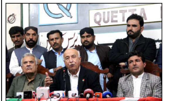
QUETTA: National Party (NP) Central President, Dr. Abdul Malik Baloch along with others addresses to media persons during press conference, at Quetta press club.

It may be mentioned here that some nine persons had lost lives while over 50 injured in the suicide blast hit the Methodist Church.