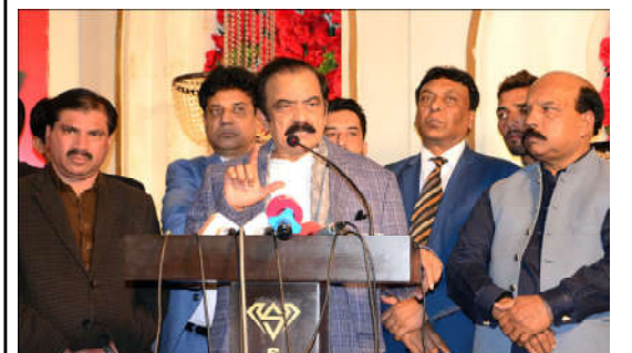
FAISALABAD: Leader of Pakistan Muslim League (N) Rana Sana Ullah Khan addressing during the Christmas Milan Party ceremony in the city.