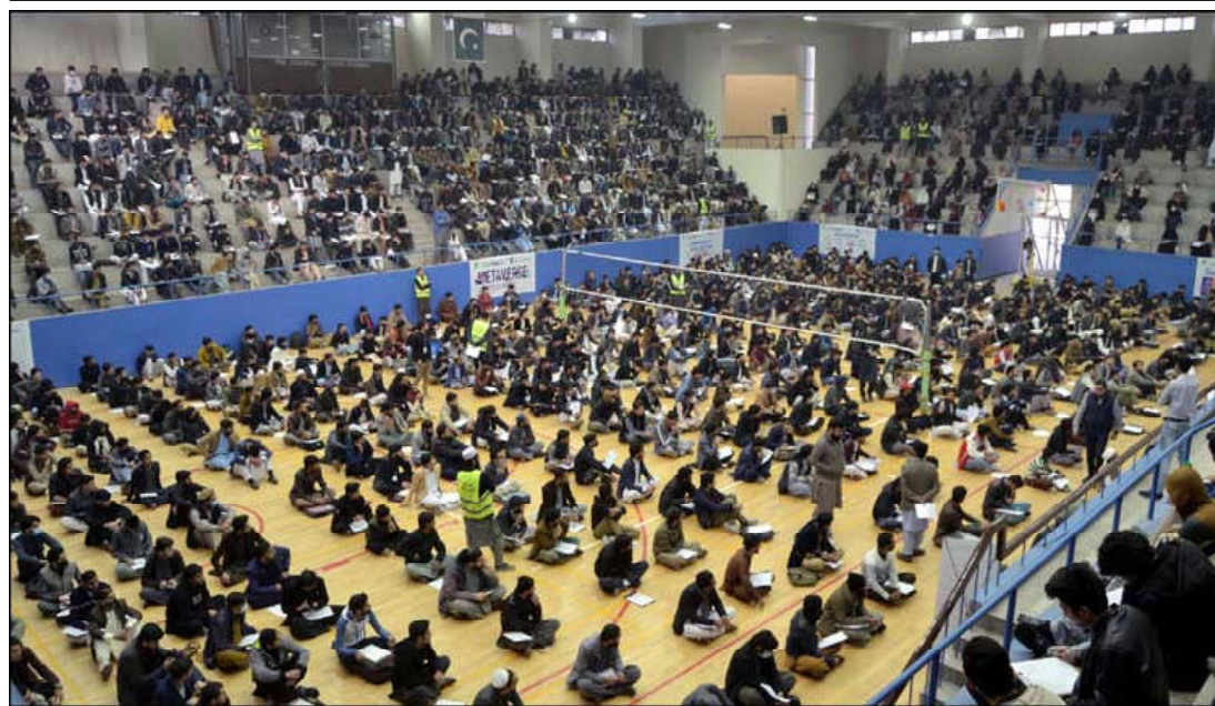
PESHAWAR: Students are solving paper of Entry Test for Information Technology (IT) Courses under the supervision of Saylani Welfare International Trust and arranged by Aziz Jan Trust.