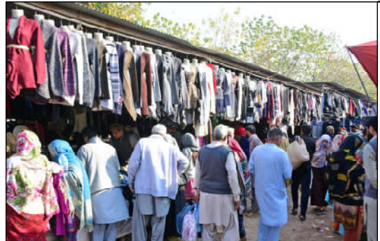
ISLAMABAD: People are busy in buying warm clothes in Landa bazaar at G-10 Sunday weekly bazaar in Federal Capital.