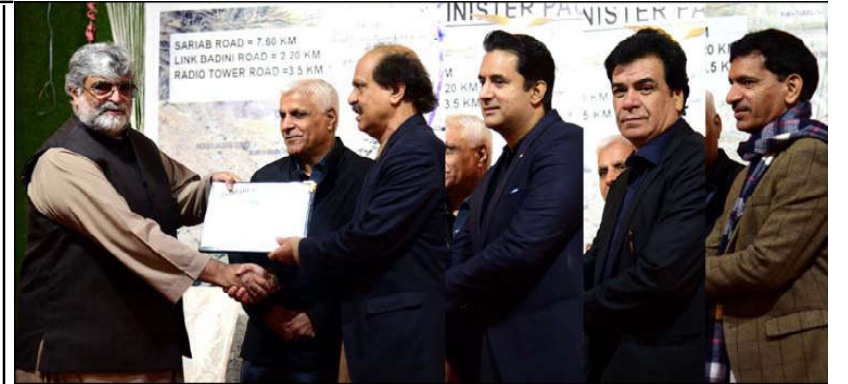
QUETTA: Caretaker Chief Minister Balochistan Mir Ali Mardan Khan Domki distributing appreciation certificates among officers on completion of Quetta Development Package project

try, emphasized the robust foundation of the China-Pakistan relationship, attributing it to the profound political trust, particularly exemplified by the China-Pakistan Economic Corridor (CPEC). She expressed the confidence in ongoing collaboration with the Pakistani government and encouraged media and citizens to contribute valuable insights for the continued success of China-Pakistan relations. She highlighted the warm reception of Pakistani visitors in China, underscoring the reciprocal treatment she and her family receive in Pakistan.