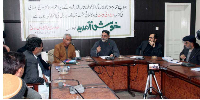
QUETTA: Renowned Politician and former Senator Nawabzada Haji Lashkari Raisani speaking to participants during dialogue session of the launching of the book organized by Peace Balochistan Forum, held at Quetta press club.

LAHORE (INP): Legal expert and disgruntled PPP stalwart Sardar Latif Khosa has joined the Pakistan Tehreek-e-Insaf (PTI). Latif Khosa, the former Punjab governor, confirmed his decision to join the PTI during a press conference in Lahore on Sunday. The PTI also officially announced his membership on X, erstwhile Twitter, sharing a video of Latif Khosa being welcomed into the party, draped in the customary flag. During the interaction with media, Khosa stated, "Today marks a journey towards happiness."