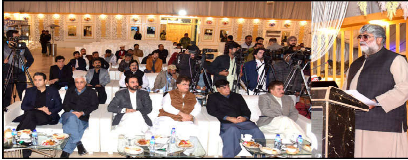
QUETTA: Caretaker Chief Minister Balochistan Mir Ali Mardan Khan Domki addressing inaugural ceremony of Link Badini Dual Road completed under Quetta Development Package

Ph: 2841470/2841473 Vol: XVI No. 196, Jamadi-us-Sani 04, 1445 AH Monday December 18, 2023, Pages 08, Price Rs.15