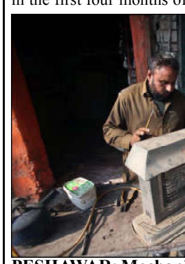
PESHAWAR: Mechanics busy in repairing work of Gas Heaters and stoves as demand of gas heater increased in city during winter season, at his shop located on Lahori Gate in Peshawar.

They said that the net Foreign Direct Investment in the first four months of the current financial year (July-October 2023-24) stood at USD 524.7 million, exhibiting an increase of 7 percent as compared to USD 488.9 million in the same period of FY 2022-23. There is a need for concrete efforts to enhance the level of FDI in the country.