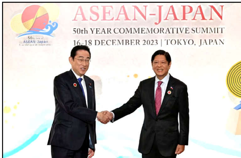
Japan's Prime Minister Fumio Kishida greets Philippines' President Ferdinand Marcos Jr. upon arrival for the opening session of the ASEAN-Japan Commemorative Summit Meeting at the Hotel Okura Tokyo in Tokyo, Japan.

tary gangsters" in the United States and South Korea for raising tensions with drills, displays of force and nuclear war planning. The statement by an unnamed ministry spokesman cited the arrival of the US nuclear-powered submarine USS Missouri in the South Korean port city of Busan on Sunday. "The armed forces of the DPRK will thoroughly neutralise the US and its vassal forces' attempt to ignite a nuclear war and thus reliably ensure peace and security in the Korean peninsula," the statement said, using the initials of North Korea's official name, the Democratic People's Republic of Korea.