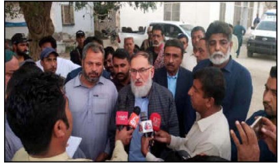
UTHAL: Caretaker Provincial Minister for Excise and Taxation Prince Ahmed Ali talking with media men

with latest technology in the war against terrorism. "It is the interest of the US to play a role for peace in the region," he said. The former minister said that American weapons and technology are being used against Palestinians by Israel and against Pakistan by terrorists. The presence of such weaponry and technology among terrorists raises numerous questions that cannot be ignored, he added. Senator Durrani said that the responsibility lies with the United Nations and especially with the United States to prevent the supply of new technology and weapons to terrorists.