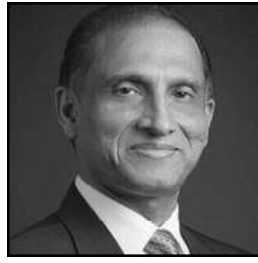
Aizaz Ahmad Chaudhry

At the outset, it is important to recognise that the US has already chosen its strategic partner in South Asia: India. The US requires India's cooperation in pursuit of its priority national security objective: strategic competition with China and containing the latter's economic rise. The US might perceive Pakistan to be a hurdle in two respects: its close friendship with China and its mutually hostile ties with India. This bigger picture is not likely to change soon.