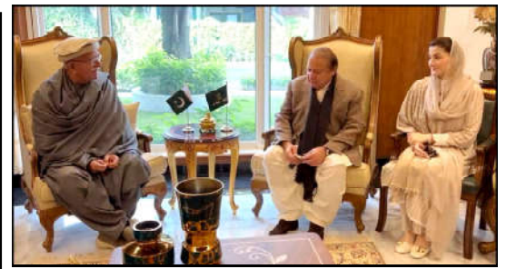
LAHORE: Chief of Pakhtoonkhwa Milli Awami Party Mehmood Khan Achakzai meeting with PML(N) leader Muhammad Nawaz Sharif.

He said across the political divide, the entire Pakistani leadership stood united to support the Kashmiris for their right to self-determination.