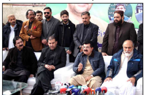
QUETTA: Chairman Senate, Muhammad Sadiq Sanjrani addresses to media persons during press conference, in Quetta.

He appreciated the conscious efforts made by all the public sector universities, Ultra Software system and officers of Governor House and Secretariat for materialising the dream of providing opportunities of livelihood to the unemployed but educated youth of the province.