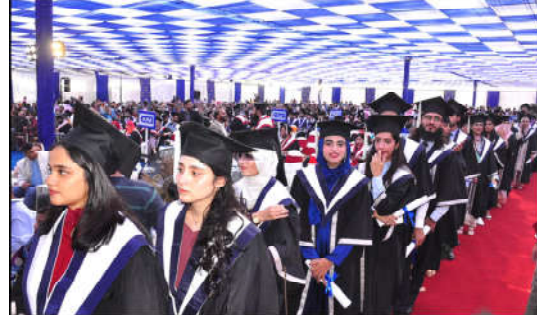
KARACHI: Newly Graduated students are celebrating their graduation during 13th Convocation at University in Federal Capital.

situation and the other is extreme weather conditions. He said the ECP should consult all the political parties and stakeholders for the election date as harsh weather conditions coupled with the security situation in Khyber Pakhtunkhwa and Balochistan could affect the election. He said that the economic situation of the country could only be streamlined if an elected government came to power for which a fair and transparent election was imperative. Referring to the Dera terror attack, he said that he met with the injured as well as the bereaved families and all of them were determined and in high morale.