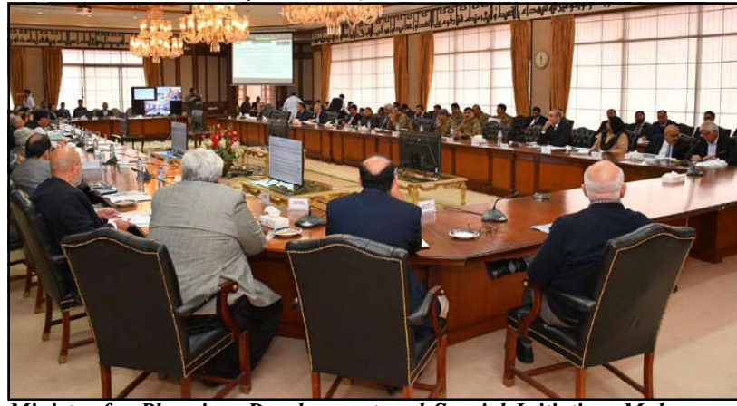
Minister for Planning, Development and Special Initiatives Muhammad Sami Saeed chairs the 7th Executive Committee meeting of Special Investment Facilitation Council (SIFC) in Islamabad.

He also condemned the terrorism incidents in the country. Meanwhile, fateha was offered for those martyred in the terrorism incidents in the country. Also present on the occasion were Chairman Senate, Sadiq Sanjrani and other senior leaders of BAP.