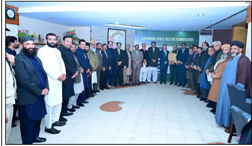
MUZAFFARABAD: A delegation of Hurriyat leaders calls on the Caretaker Prime Minister Anwaar-ul-Haq Kakar.

Mian Farooq Altaf and Senator Mushahid Hussain Syed also spoke on the occasion.