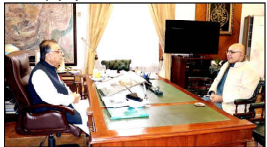
QUETTA: Caretaker Provincial Minister for Information Jan Achakzai meeting with Governor Balochistan Malik Abdul Wali Khan Kakar

The CJP inquired who had asked Shaukat Aziz Siddiqui to give decision of whom.