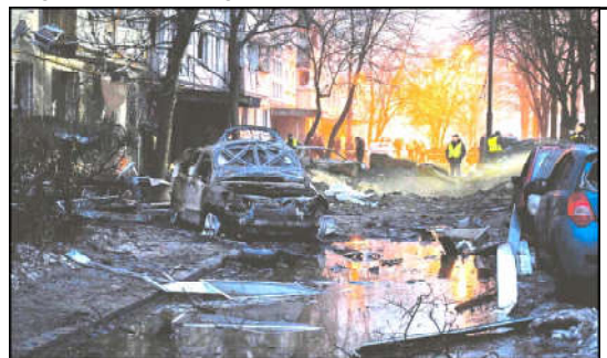
A view of destroyed cars next to a damaged residential building following a Russian missile strike.

a ceasefire were vetoed. The resolution, moved in the General Assembly on Tuesday, was sponsored by more than 100 countries and passed with a large majority of 153 votes. The vote reflects an increase in support for the ceasefire's demand. A similar measure in late October drew a nod from 121 countries. The United States and Israel were among the 10 countries that voted against it on Tuesday, while 23 abstained.