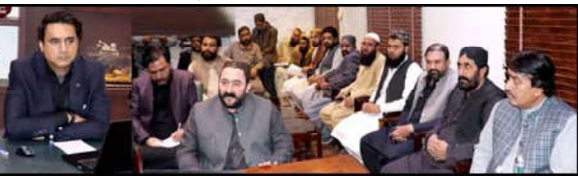
QUETTA: A delegation of Anjuman Tajiran meeting with Commissioner Quetta Division Hamza Shafiqat regarding sugar crisis.

The spokesman told that the price of ghee of well-known brands had been reduced by 17 rupees per kg. While the prices of cooking oil have been reduced from Rs.37 per liter to Rs.48 per liter, said a press release issued here. Ghee will be available at Rs 482 per kg instead of Rs 499, while cooking oil will be available at Rs 470 to Rs 422 per liter and other branded cooking oil will be available at Rs 518 per liter instead of Rs 555. The new prices have been applied immediately and it should be noted that for the convenience.