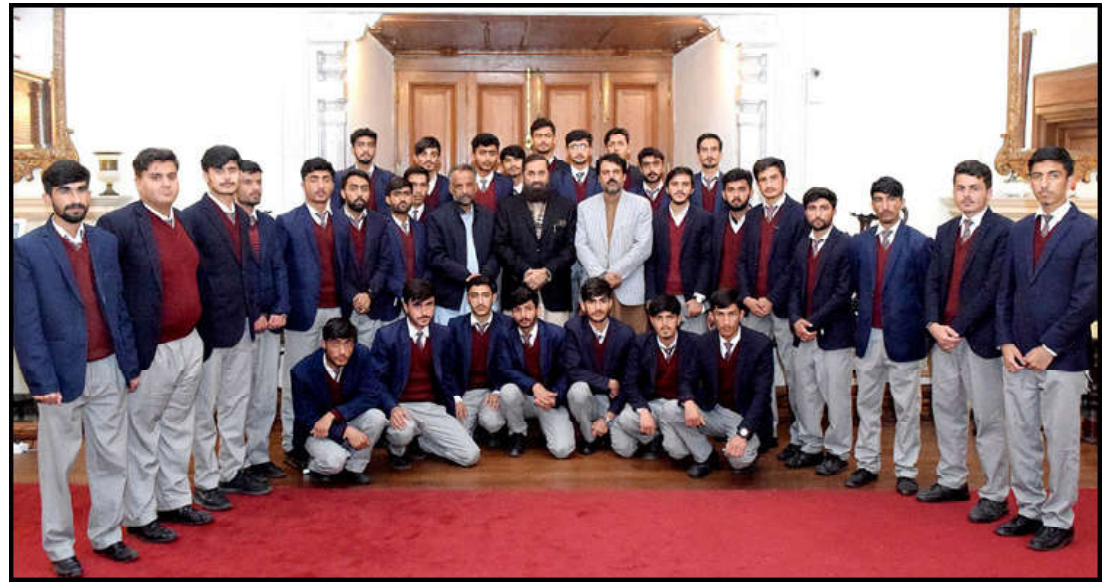
LAHORE: Punjab Governor Muhammad Balighur-Rehman in a group photo with teachers and students of Balochistan Residential College Loralai.

2013 and 2018, special measures were taken to bring Balochistan into the stream of development. He said that a special quota has been fixed for the students of Balochistan in the universities and medical colleges of Punjab. Governor Punjab said that the continuation of public welfare policies is very important for the development of the country.