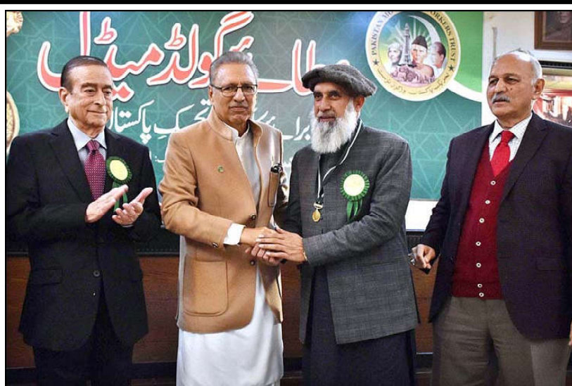
LAHORE: President Dr. Arif Alvi distributing the Gold Medals to the Honour workers of Pakistan Movement during the 29th Annual Gold Medal ceremony of Tehreek-e-Pakistan Trust organized by Nazriya-e-Pakistan Trust and Pakistan Worker Trust.

The credibility of the Parliament will be nothing if free, fair and transparent elections were not conducted in the country."