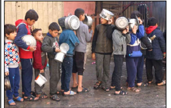
Palestinian children hold pots as they queue to receive food cooked by a charity kitchen, amid shortages in food supplies, as the conflict between Israel and Hamas continues, in Rafah in the southern Gaza Strip.

the ministry added. Wednesday's strike, which caused the highest number of wounded in months, was the second in a week. In another attack overnight Sunday to Monday, eight missiles headed for the capital were shot down. "The enemy used ballistic weapons," the Kyiv City Military Administration said, adding that Russia was "intensifying the missile terror of Kyiv". There were also strikes in the southern port of Odesa, where officials said nine Iranian-made Shahed drones had been downed. On the edge of the port city of Odesa, a journalist saw a large hangar in which trucks and cars had been destroyed.