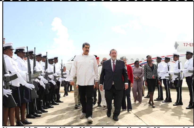
Venezuela's President Nicolas Maduro is received by the St. Vincent and the Grenadines' Prime Minister Ralph Gonsalves before a meeting with his Guyanese counterpart Irfan Ali amid tensions over a border dispute, in Kingstown, St. Vincent and the Grenadines.

with those asked by journalists, and Russians have been submitting questions for Putin for two weeks. It is the first time Putin, who has heavily limited his interaction with foreign media, will potentially face multiple questions from Western journalists since before the fighting in Ukraine began. The press conference opened with questions about the conflict in Ukraine and highlighted concerns some Russians have about fears of another wave of mobilization, which has proved unpopular. In September 2022 Putin ordered a partial military call-up as he tried to boost his forces in Ukraine, sparking protests.