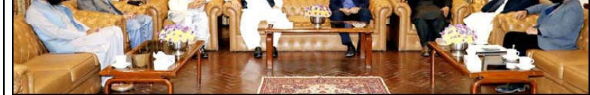
QUETTA: Governor Balochistan Malik Abdul Wali Khan Kakar presiding over a meeting held to review different aspects of implementation of IT initiative programme.

The Finance Minister apprised the French Ambassador about the economic reforms of the government that have brought economic and fiscal stability in the country.