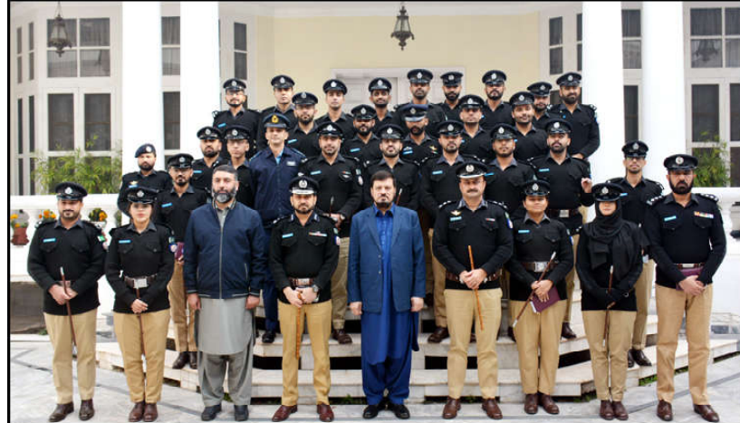
PESHAWAR: Khyber Pakhtunkhwa Governor Haji Ghulam Ali in a group photo with under training ASPs and Senior Officers of National Police Academy during their study tour to Governor House.