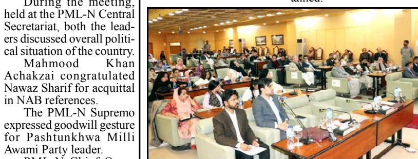
QUETTA: Chief Secretary Balochistan Shakeel Qadir Khan addressing participants of National Security Workshop Balochistan

The Minister Information said that the interim government is serious in resolving the issues of people of Chaman. Their genuine demands would be resolved soon, he maintained.