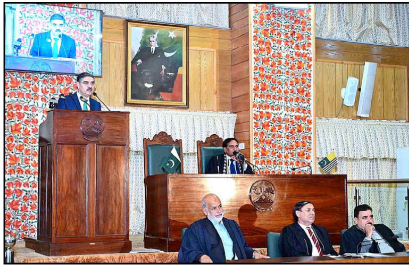
MUZAFFARABAD: Caretaker Prime Minister Anwaar-ul-Haq Kakar addresses the special session of Azad Jammu and Kashmir Legislative Assembly.