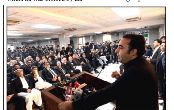
PESHAWAR: Peoples Party (PPP) Chairman, Bilawal Bhutto Zardari addressing to Peshawar High Court Bar Association, in Peshawar.

ISLAMABAD (APP): President Dr Arif Alvi on Wednesday promulgated an ordinance to declare the theft of electricity a cognisable offence. Through the Criminal Law Amendment Ordinance 2023, the President amended the Section 462 (O) of the Pakistan Penal Code, 1860. According to a President House statement, the electricity distribution companies were earlier facing difficulties in the registration of FIRs of power theft incidents. However, under the new ordinance, the incidents of electricity theft will be a cognisable offence. After the Ordinance, theft of electricity will be a cognisable offence on the complaint of not only by officers of grade 17 or above but also the nominees of CEOs of electricity distribution companies. The president issued the Ordinance under Article 89-1 of the Constitution. The said ordinance will help curb power theft in the energy sector worth around Rs 590 billion.