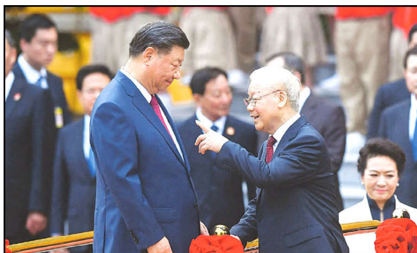
HANOI: President Xi Jinping and Nguyen Phu Trong, Vietnam Communist Party's General Secretary, attend a welcome ceremony at the Presidential Palace.

to stave off climate catastrophe. COP28 President Sultan Al Jaber called the deal "historic" but added that its true success would be in its implementation. "We are what we do, not what we say," he told the crowded plenary at the summit. "We must take the steps necessary to turn this agreement into tangible actions." Several countries cheered the deal for accomplishing something elusive in decades of climate talks. "It is the first time that the world unites around such a clear text on the need to transition away from fossil fuels," said Norway Minister of Foreign Affairs Espen Barth Eide. More than 100 countries had lobbied hard for strong language in the COP28 agreement to "phase out" oil, gas and coal use, but came up against powerful opposition from the Saudi Arabia-led oil producer group OPEC, which argued that the world can slash emissions without shunning specific fuels. That battle pushed the summit a full day into overtime on Wednesday, and had some observers worried the negotiations would end at an impasse.