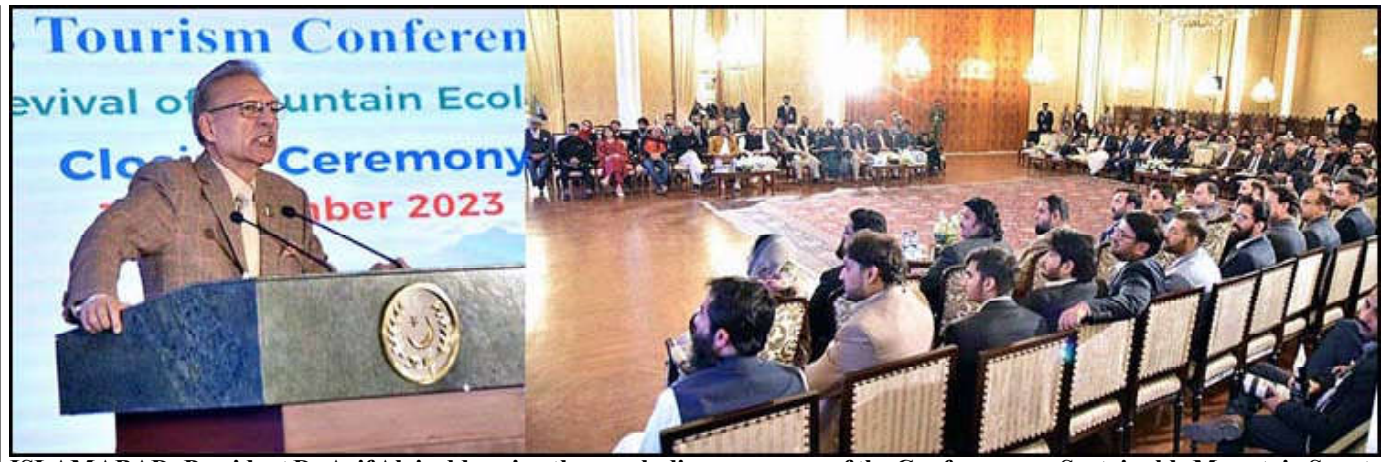
ISLAMABAD: President Dr Arif Alvi addressing the concluding ceremony of the Conference on Sustainable Mountain Sports Tourism, at Aiwan-e-Sadr.

ever, stressed the need to put in place a tourist regulatory mechanism to promote domestic tourism. He emphasized ensuring facilities for tourists such as easy access to destinations, better roads, clean hotels and guest rooms, and trained human resources. He pointed out that the unregulated influx of tourists caused nuisance of traffic jams and disruption of the civic system. In this regard, he proposed proper management and development of new tourist destinations to shift the quantum of visitors. The president also called for raising consciousness among the general public to be kind towards the environment while exploring tourist places.