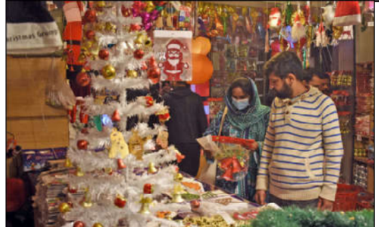
LAHORE: People of Christen Community are buying different decorating stuff from shop during the celebrations of Christmas.