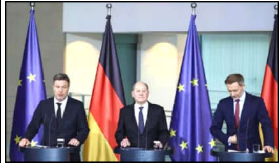
German Chancellor Olaf Scholz, Finance Minister Christian Lindner, and Economy and Climate Minister Robert Habeck present the 2024 budget in Berlin, Germany.

LONDON: Human Rights Watch and other civil society groups have called on the UK government to stop transfers of arms to Israel, amid concerns that they might be used to commit "war crimes" against Palestinians. It comes as Israel continues its two-month-long campaign of airstrikes and ground assaults in Gaza, during which more than 17,000 Palestinians, many of them women and children, have been killed, according to Palestinian officials. In a detailed letter on Tuesday, the groups said that since 2015, UK authorities have authorized sales of military equipment to Israel worth at least £474 million ($595 million), including components for combat aircraft, missiles and tanks, other technology, and small arms and ammunition. "The UK provides approximately 15 percent of the components in the F-35 stealth bomber aircraft currently being used in Gaza, including the rear fuselage and active interceptor system, ejector seats, aircraft tires, refueling probe, laser-targeting system, and the fan propulsion system," it said.