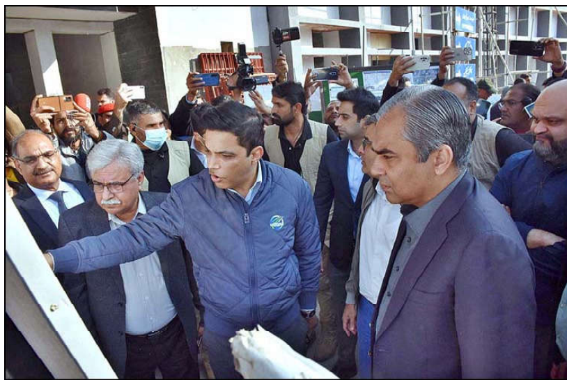
SIALKOT: Caretaker Chief Minister Punjab, Mohsin Naqvi is visiting Allama Iqbal Teaching Hospital.

of the situation, Mohsin Naqvi announced upgradation and redesign of the hospital and said Sardar Begum Civil Hospital would be upgraded soon. It would cost Rs 210 million, and 21,000 square feet area of the hospital would be upgraded. CM Mohsin Naqvi visited various wards, met patients and inquired about the treatment facilities in hospital. He inspected the Emergency, ICU, Gynecology, Lab and other wards. He also went to the basement, ground and first floor and expressed his displeasure over the bad condition of the classrooms. The CM listened to problems of elderly woman in hospital and gave instructions to the