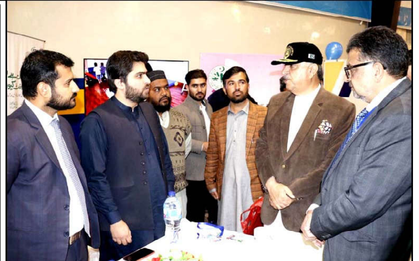
QUETTA: Governor Balochistan Malik Abdul Wali Khan Kakar visiting stalls during Job Fairs held at BUTEMS

occupied Jammu and Kashmir on 5 August 2019. According to Kashmir Media Service, the OIC General Secretariat in a statement issued in Jeddah in reference to the decisions and resolutions of the Islamic Summit and the OIC Council of Foreign Ministers related to the Kashmir dispute reiterated its call to reverse all illegal and unilateral measures taken by the Modi regime since 5 August 2019 aimed at changing the internationally-recognized disputed status of the occupied territory.