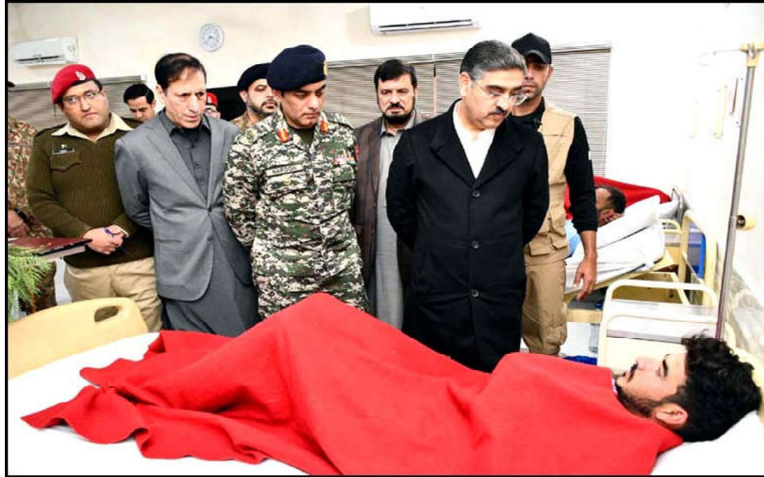
DERA ISMAIL KHAN: Caretaker Prime Minister, Anwaar-ul-Haq Kakar inquiring about the health of those injured in the Dera Ismail Khan blast during his visit of CMH Dera Ismail Khan.

Ph: 2841470/2841473 Vol: XVI No. 193, Jamadi-ul-Awwal 29, 1445 AH Thursday December 14, 2023, Pages 08, Price Rs. 15