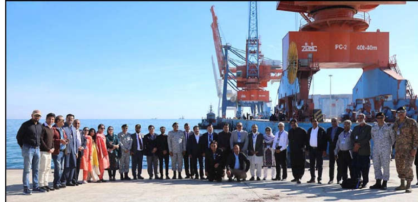
GWADAR: Participants of 6th Maritime Security workshop during their visit to Gwadar port.

pected that global requirement of seafarer officers in the industry would be around 90000 by 2026, he noted. He urged the cadets that they will be the sailing ambassadors of Pakistan in the field of shipping across the world so they must excel while maintaining international standards and earn not only good name for the country but also contribute in development of national as well as global economy. Referring to efforts for upgrading PMA into higher education institution in fields of Nautical Sciences and Marine Engineering, the SAPM said that government was formalizing National Maritime Policy and we are recommending to establish National University of Maritime Sciences and Technology and PMA would be a hub of the university.