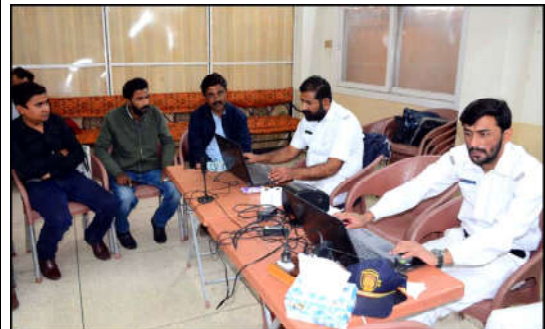
HYDERABAD: Journalists of Hyderabad Press Club are gathered and wait for their turn to get their driving license during Computerized Driving License Camp at press club premises in Hyderabad.