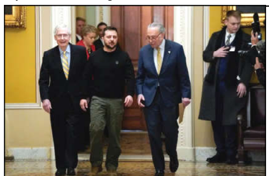
Ukrainian President Volodymyr Zelenskyy walks next to U.S. Senate Majority Leader Chuck Schumer (D-NY) and U.S. Senate Minority Leader Mitch McConnell (R-KY) as he arrives for a meeting with all U.S. senators at the Capitol in Washington, U.S.

Her death triggered major protests in Iran and a global movement known as "Woman, Life, Freedom", calling for the end of the Muslim cleric-led government in Tehran.