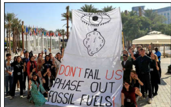
Climate activists attend a protest against fossil fuels at Dubai's Expo City during the United Nations Climate Change Conference COP28 in Dubai, United Arab Emirates.

Speaking after his arrival at Hanoi's airport, Xi said he would talk with Vietnamese leaders on "the overall, strategic, and directional issues of China-Vietnam relations, as well as international and regional issues of common concern, in order to push bilateral relations into a new stage", according to Chinese state media. Vietnam has long pursued a "bamboo diplomacy" approach, striving to stay on good terms with both China and the United States. It shares US concerns about Beijing's increasing assertiveness in the contested South China Sea, but it also has close economic ties with China.