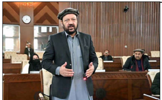
GILGIT: Chief Minister Gilgit-Baltistan, Haji Gulbar Khan addressing during the 5th sitting of the 27th session of Gilgit-Baltistan Assembly under the chair of Speaker Gilgit-Baltistan Assembly Nazir Ahmad Advocate.