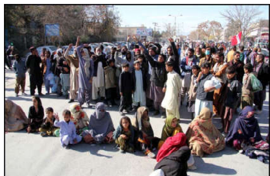
QUETTA: Residents of Sariyab road are holding protest demonstration against low pressure of sui gas in their area, outside Sui Gas Office in Quetta.