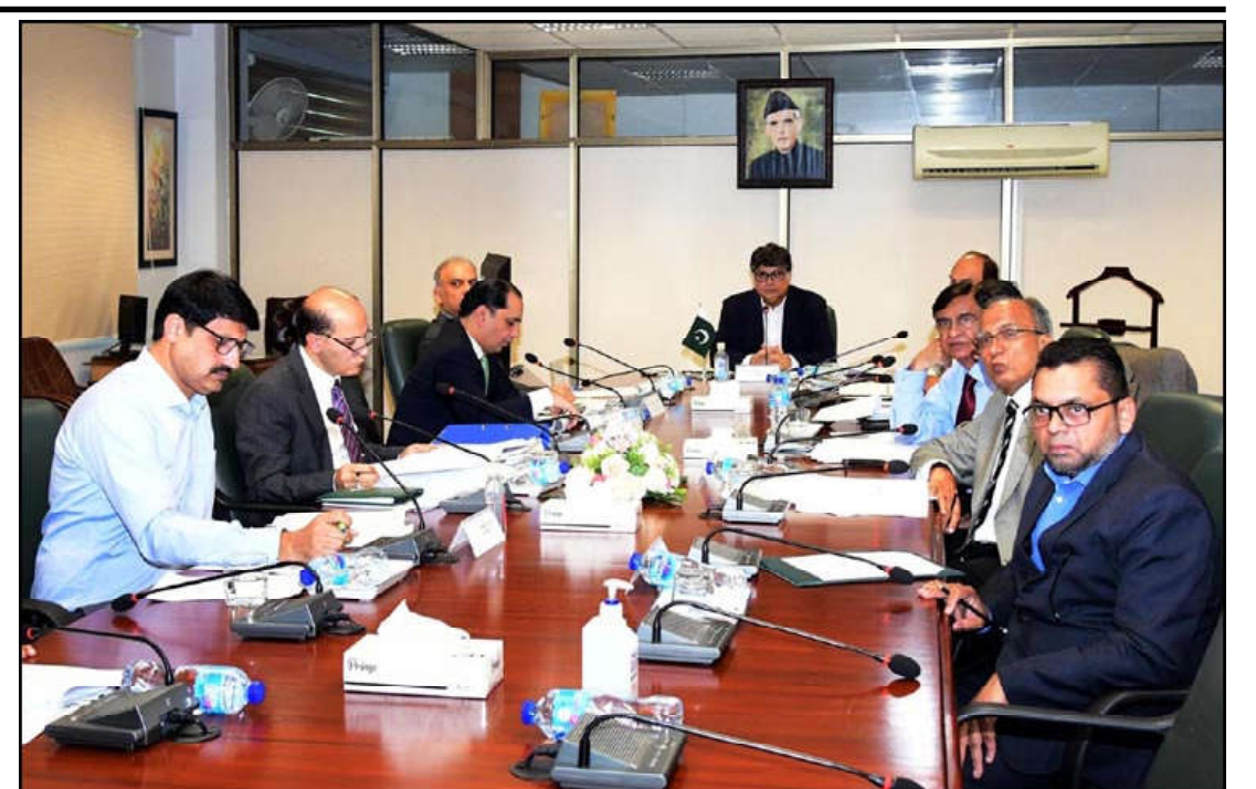
ISLAMABAD: Caretaker Federal Minister for Privatisation, Fawad Hassan Fawad chairing a meeting of the Privatisation Commission Board.

by 2.1% on year on year basis in Q1-FY24 in comparison to 1.0 percent in the same quarter last year, the MPC noted. Recovery in the agriculture sector was the major driver of the growth while the manufacturing sector also recorded a moderate recovery, with growth in large-scale manufacturing becoming positive after contracting in the preceding four quarters, the committee viewed adding that, unlike the commodity-producing sector, growth in the services sector remained subdued. The MPC observed a significant improvement in the current account balance.