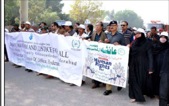
HYDERABAD: Participants are holding awareness walk on the eve of International Human Rights Day organized by Directorate of Human Rights Hyderabad, in Hyderabad.