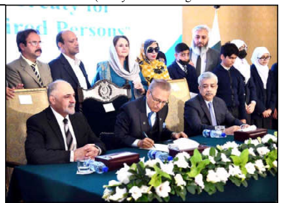
ISLAMABAD: President Dr Arif Alvi signing the Instrument of Accession to the Marrakesh Treaty for the Visually Impaired Persons in a ceremony, at Aawan-e-Sadr.

The Marrakesh Treaty aims to help the visually impaired or otherwise