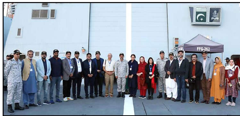
KARACHI: Group photo of 6th Maritime Security Workshop participants on board PNS Taimur during visit.

The Post-Flood 2022 Reconstruction Program emphasizing resilience enhancement and livelihood diversification in Balochistan (road infrastructure CW&PPHD), with a total cost of Rs. 13,809.544 Million, was recommended to ECNEC. This project, funded by the World Bank, aims to strengthen transportation infrastructure by constructing resilient roads and bridges, significantly reducing travel time for the residents.