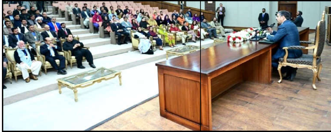
ISLAMABAD: The Caretaker Prime Minister Anwaar-ul-Haq Kakar addresses the 12th National Balochistan Workshop.

Ph: 2841470/2841473 Vol: XVI No. 192, Jamadi-ul-Awwal 28, 1445 AH Wednesday December 13, 2023, Pages 08, Price Rs.15