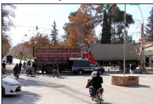
QUETTA: Containers have been placed to closed the redzone area after the family of Balach, who was allegedly killed during the CTD operation, reached Quetta on foot from Turbat Kech for sit-in in the Red Zone area of Quetta until the arrest of the CTD officials, while demanding the formation of a judicial commission for an independent inquiry into CTD's action, in Quetta.

He said that the government intends to ensure that the fertilizer is delivered to the grower/farmer at his doorstep. The minister said that the government provides subsidy to facilitate the general public or the farmer and not to encourage the middle to make money out of the subsidy.