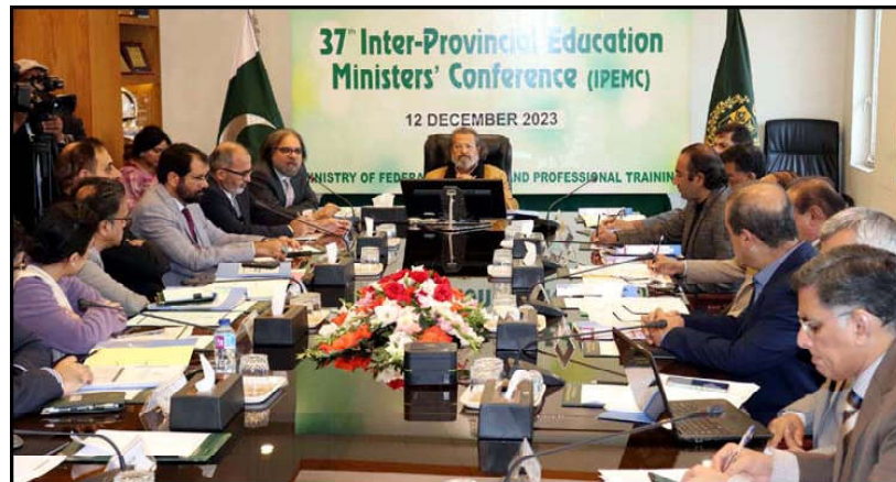
ISLAMABAD: Caretaker Minister for Federal Education and Professional Training, Madad Ali Sindhi chaired the 37th Inter-Provincial Education Ministers Conference (IPEMC) in Islamabad.