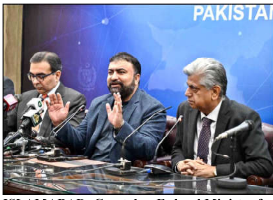
ISLAMABAD: Caretaker Federal Minister for Information and Broadcasting Murtaza Solangi, Caretaker Interior Minister Sarfraz Ahmed Bugti and Caretaker Federal Minister for Petroleum Muhammad Ali addressing a press conference at PID Media Center.

The blast caused massive damage to the building. However, the authorities are investigating to ascertain the cause of gas leakage.