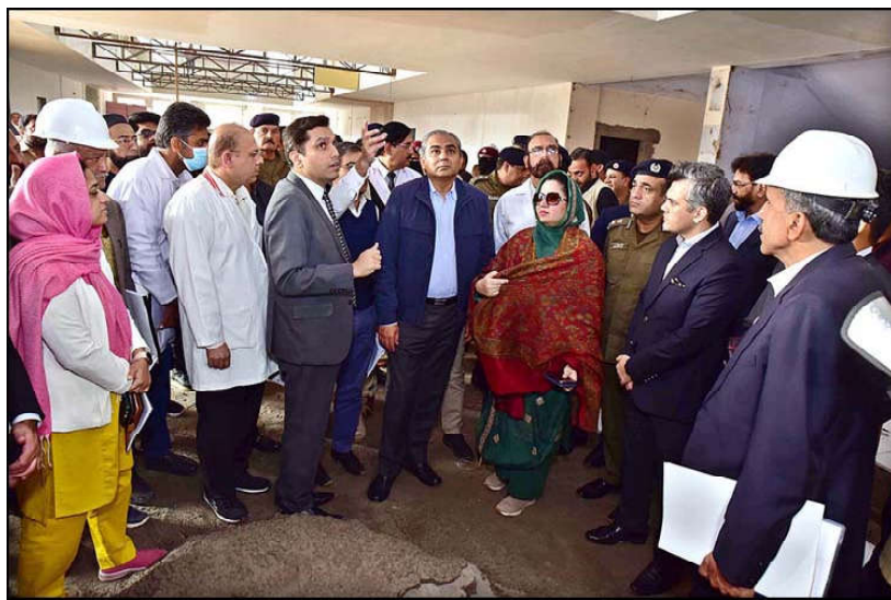
FAISALABAD: Chief Minister Punjab, Syed Mohsin Raza Naqvi is visiting the Allied Hospital Faisalabad to inspect ongoing upgradation projects of Surgical Emergency and OPD Wards.

The focus on cardiology facilities extends to Multan and Sialkot as well.