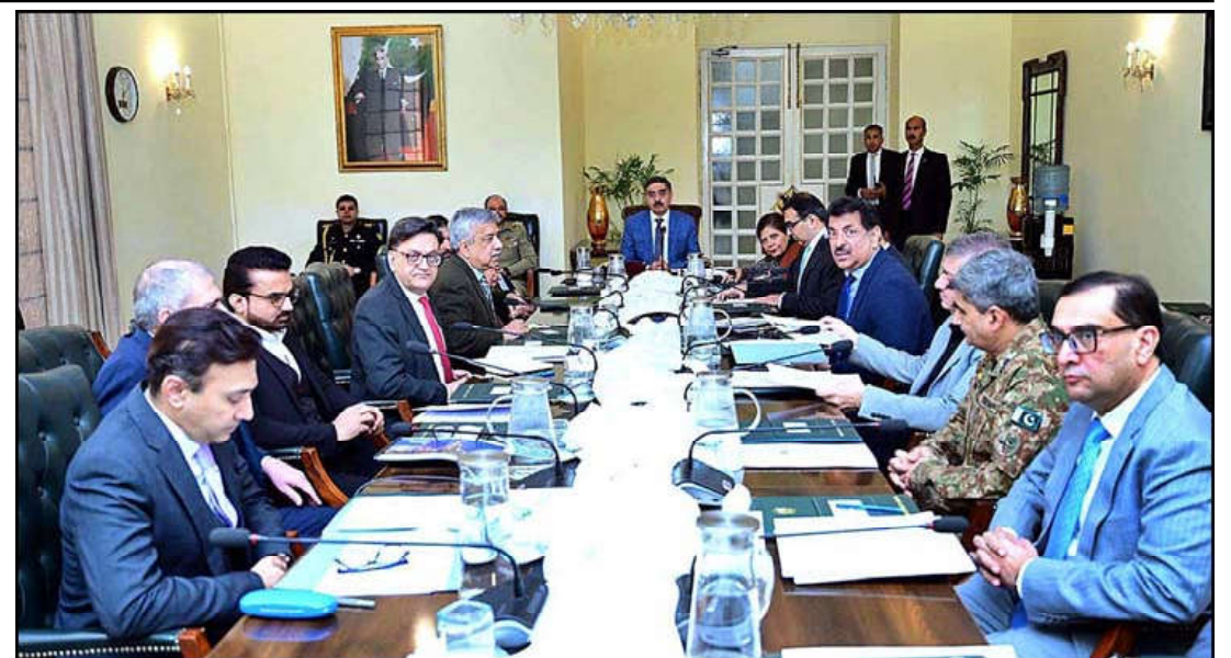
ISLAMABAD: Caretaker Prime Minister Anwaar-ul-Haq Kakar chairs a meeting regarding uninterrupted supply of Urea fertilizer to the farmers on Government control rate.

Earlier, a detailed briefing was given in the meeting on the recent production, demand and supply of urea fertilizer to farmers in the country. The meeting was told that the production and stock of urea in the country was sufficient for the wheat crop, whereas 220,000 metric tons was being imported for buffer stock, and its first consignment would reach Pakistan by next week.