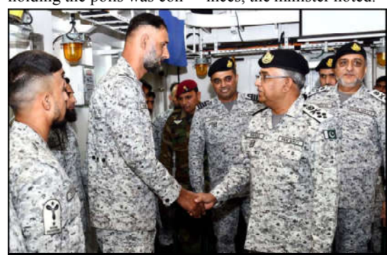
KARACHI: Chief of the Naval Staff Admiral Naveed Ashraf interacts with the troops and officers during his visit onboard PN Fleet Units, at PN Dockyard in Karachi.

LAHORE (INP): Former prime minister Nawaz Sharif has said time has come to put Pakistan on the road to progress. He expressed these views while addressing a PML-N meeting in Lahore on Monday. Sharif highlighted the need for national unity and emphasised the responsibility of overcoming self-interest for the greater good. Addressing the PML-N's ticket contenders, Sharif recounted the past achievements and expressed concerns over the halted journey of development. He called for merit-based ticket allocations and stressed the importance of serving the nation above personal interests. Sharif acknowledged current challenges, including the soaring cost of electricity, meat, flour, and sugar.