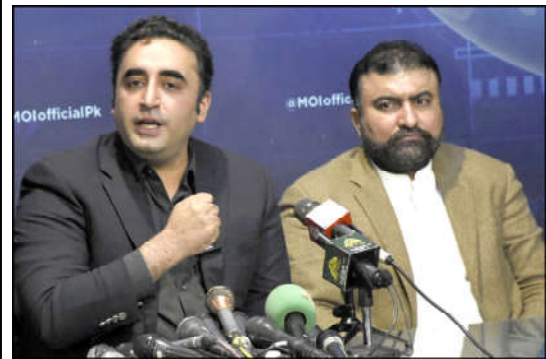
ISLAMABAD: Chairman Pakistan Peoples Party Bilawal Bhutto Zardari along with Caretaker Minister of Interior Sarfraz Bugti talking to media persons during press conference after inaugurating Martyrs Wall at Ministry of Interior in Federal Capital.