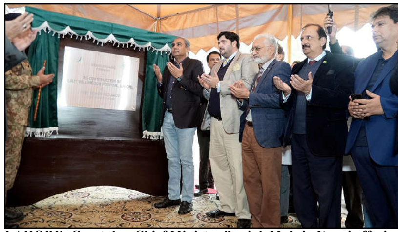
LAHORE: Caretaker Chief Minister Punjab Mohsin Naqvi offering a plaque during the inauguration of the re-construction of Lady Willingdon Hospital Lahore.

implemented with immediate effect while long-term steps would be proposed for the upcoming elected government. A roadmap would be provided to the upcoming elected government, so it could keep public welfare-oriented steps continuing. He appreciated the efforts of the Chief Secretary and administrative secretaries in the preparation of Khushal Khyber Pakhtunkhwa Programme. He said that the Chief Secretary and his team had prepared a good and feasible programme within a short time.