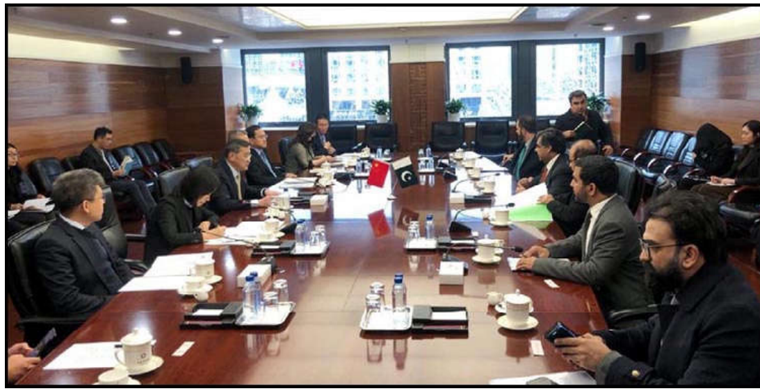
Caretaker Federal Minister for Commerce and Industry, Dr. Gohar Ejaz had useful discussion today with Chinese MOFCOM Vice Minister Mr. Li Fei in Beijing.