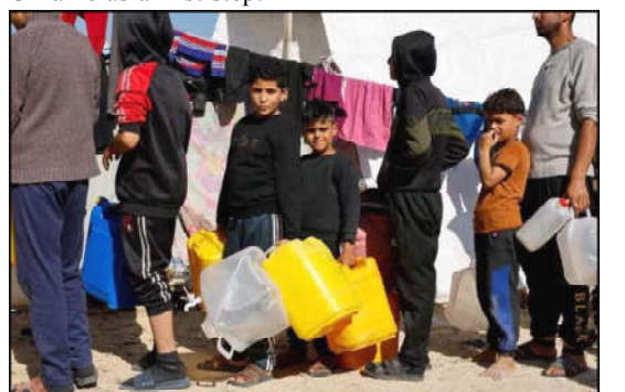
Boys hold containers while they line up, displaced Palestinians, who fled their homes due to Israeli strikes, shelter in a tent camp near the border with Egypt, amid the ongoing conflict between Israel and the Palestinian Islamist group Hamas, in Rafah in the southern Gaza Strip.

"The rebuilding of the Ukrainian Navy has begun," U.K. Secretary for Defence Grant Shapps said in a post on X. "The U.K. will bring together our allies in a new coalition to give Ukraine the power to rule the waves." The UN says commodity shipments in the Black Sea continue to face "significant risks" from air strikes and sea mines, and several cargo and grain ships reportedly hit mines in the area in recent months.