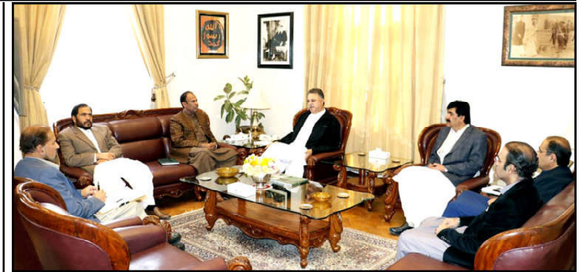
QUETTA: A delegation comprising members of committee formed resolve complaints about distribution of laptops in the University of Balochistan meeting with Governor Balochistan Malik Abdul Wali Khan Kakar

ISLAMABAD (APP): President Dr Arif Alvi on Monday strongly rejected the Indian Supreme Court's (ISC) decision to uphold the revocation of the special status of the Indian Illegally Occupied Jammu and Kashmir (IIOJK). He expressed dismay over the decision, saying the Indian judiciary had succumbed to the fascist Hindutva ideology giving decisions suited to the Indian government. He added that such decisions could not legitimize the occupation of IIOJK by India as the Jammu and Kashmir issue was an internationally recognized dispute that remained on the agenda of the UN Security Council for over seven decades. While condemning the decision, the president said that it was unfortunate that Indian courts had a history of giving decisions against Muslims as in the cases of Babri Masjid, Samjhuta Express, Hyderabad Mecca Masjid blast and Naroda Gam massacre during the 2002 Gujarat riots etc. He added that the verdict of the ISC could not change the status of the IIOJK. He said the Judgement would further strengthen the resolve of the people of IIOJK in their just struggle against Indian illegal occupation.