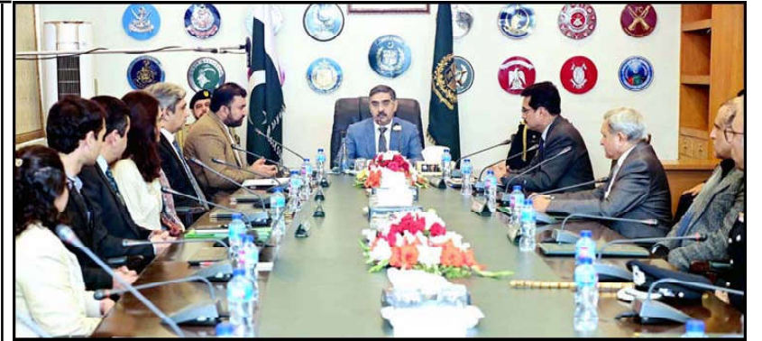
ISLAMABAD: Caretaker Prime Minister Anwaar-ul-Haq chairing a meeting at the Ministry of Interior to inaugurate Pakistan's New Visa Policy.

ISLAMABAD (APP): Caretaker Prime Minister Anwaar-ul-Haq Kakar on Monday directed to introduce competitive electricity rates for industries to benefit the common man and promote trade activity in the country. In a meeting with a delegation of industrialists and businessmen from Karachi, he said the government was taking every possible step to boost trade in the country. The prime minister also ordered the finance minister and power minister to devise a strategy for the gas prices in consultation with industrialists. He said the government was taking steps to expand tax-net and empha-