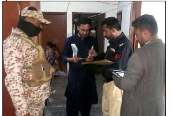
KARACHI: Police officials carry out the combing search operation against criminals as security has been tightened in city due to security reasons at different areas of Lyari area in Karachi.

Following temporary registration, motorcycle rickshaws will undergo a four-month window for specific size and redesign modifications. Subsequently, they can obtain a registration number from the excise department upon the issuance of a fitness certificate. The CM emphasized the need to streamline the registration process and requested the forms to be prepared in Urdu. The meeting also sanctioned the permanent fortification of the infrastructure for 18 major roads.