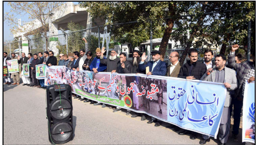
ISLAMABAD: Activists of All Parties Hurriyat Conference holds protest in the favor of their demands outside Shams Gate in Federal Capital.