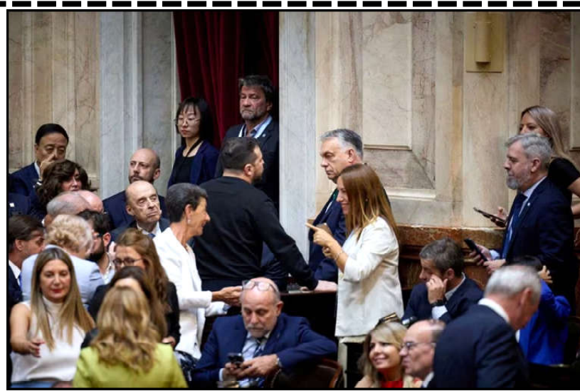
Ukraine's President Volodymyr Zelenskyy speaks with Hungarian Prime Minister Viktor Orban during the inauguration of newly-elected President Javier Milei, in Buenos Aires, Argentina.

tightened. If EU members agreed in principle, the next step would be for experts to draw up the legal framework to figure out which individuals or entities would be targeted. The EU said on Friday it had added Mohammed Deif, Commander General of the military wing of Hamas, and his deputy, Marwan Issa, to its list of terrorists under sanction. It is also considering adding Hamas Gaza chief Yahya Sinwar to the list, according to diplomats. The letter said a separate sanctions scheme targeting Hamas would send a "strong political message" about the EU's commitment against Hamas.