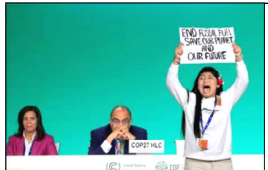
Licypriya Kangujam, an Indigenous climate activist from India, holds a banner during the United Nations Climate Change Conference (COP28) in Dubai, United Arab Emirates.

Canada's population up at its fastest clip in more than six decades this year, Statistics Canada said. But now a reversal of that trend is gradually taking hold. In the first six months of 2023 some 42,000 individuals departed Canada, adding to 93,818 people who left in 2022 and 85,927 exits in 2021, official data show. The rate of immigrants leaving Canada hit a two-decade high in 2019, according to a recent report from the Institute for Canadian Citizenship (ICC), an immigration advocacy group.