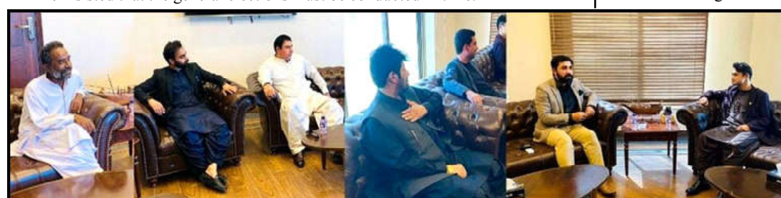
GWADAR: Caretaker Provincial Minister for Sports and Culture Nawabzada Mir Jamal Khan Raisani presiding over a meeting regarding Gwadar Youth Festival

Independent Report QUETTA: The former Chief Minister Balochistan, Jam Kamal Khan has stated that holding general elections is very necessary to break the status-quo in country's politics and every party must have right to participate in them. Jam Kamal Khan was speaking during his visit to Dhadhar, Bolan on Sunday. Upon reaching Dhadhar, the tribal and political elder Muhammad Waris Barda welcomed Jam Kamal Khan. Speaking on the occasion, the former Chief Minister said that holding general elections are need of the hour to break the political status-quo. He insisted that the general elections must be conducted in time.