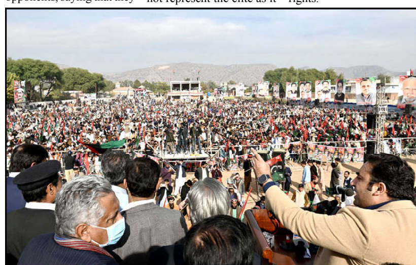
KOHAT: Chairman Pakistan People's Party Bilawal Bhutto Zardari addressing to workers convention at Captain Zahoorul Islam Shaheed Football Stadium Babri Banda.

KOHAT (Agencies): Pakistan Peoples Party (PPP) Chairman Bilawal Bhutto Zardari has said that he does not have any political rivals as "neither any player nor anyone else" can compete with him in politics. Addressing the party's rally in Kohat district on Sunday, the PPP chief took a veiled jibe at his political opponents, saying that they