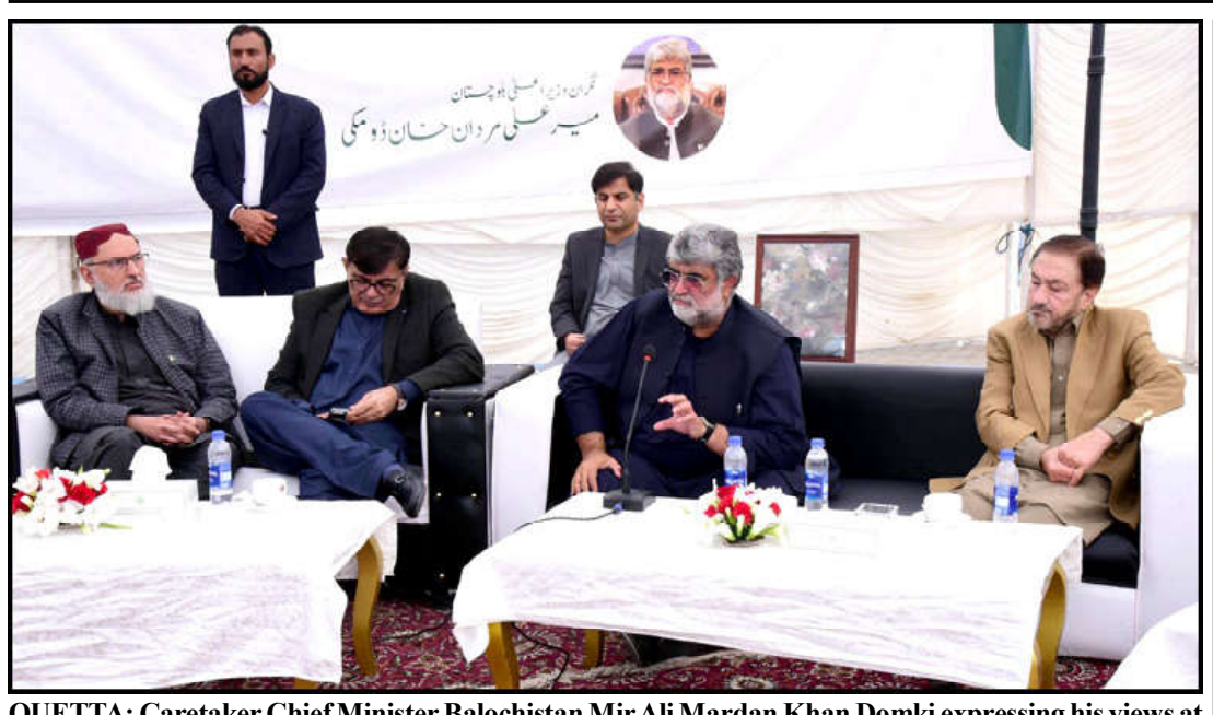
QUETTA: Caretaker Chief Minister Balochistan Mir Ali Mardan Khan Domki expressing his views at Grand Jirga regarding peace and reconciliation process in the province

Ph: 2841470/2841473 Vol: XVI No. 187, Jamadi-ul-Awwal 22,1445 AHThursday December 07, 2023, Pages 08, Price Rs.15