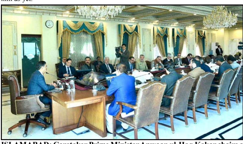
ISLAMABAD: Caretaker Prime Minister Anwaar-ul-Haq Kakar chairs a meeting on Task Force of Polio Eradication.

The president, in this ard, emphasized close li-