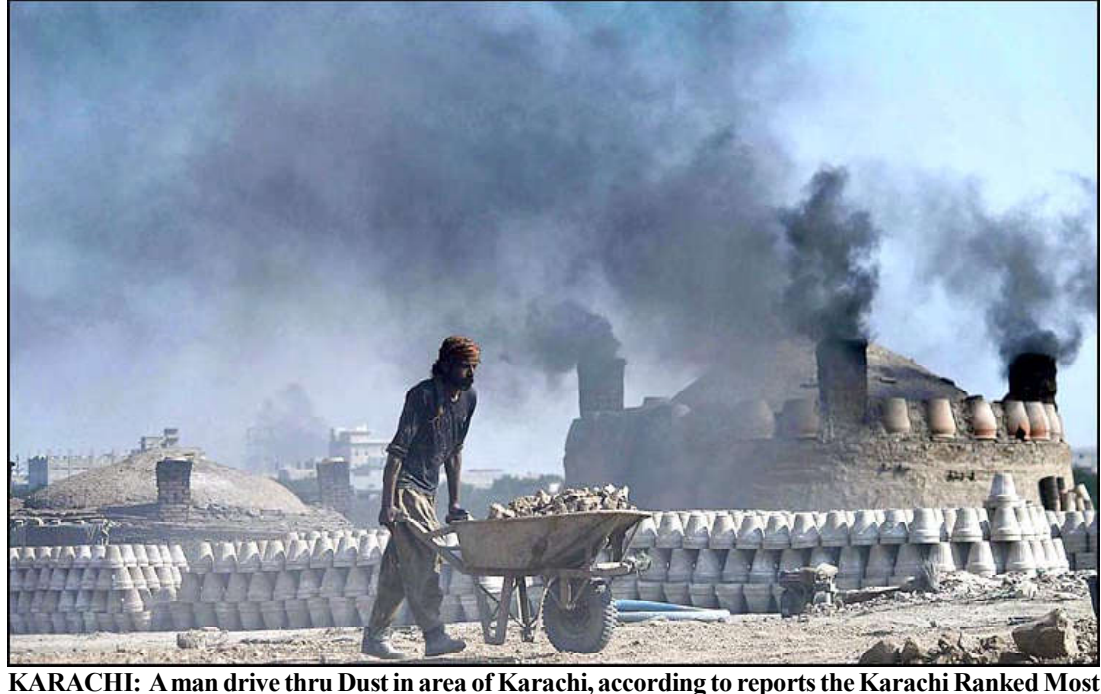
Polluted city in the world in term of air quality, The various forms of pollution have increased at Karachi which has caused widespread environmental and health problems.

private partnership and He said that he is happy to see that international companies in electrical vehicles and artificial intelligence are bringing their expertise and technology to Pakistan, which will help us accelerate the adoption of these technologies in our country and create new opportunities for our citizens. Governor Punjab said that the expo is a testament to the power of innovation collaboration and shows that when government.