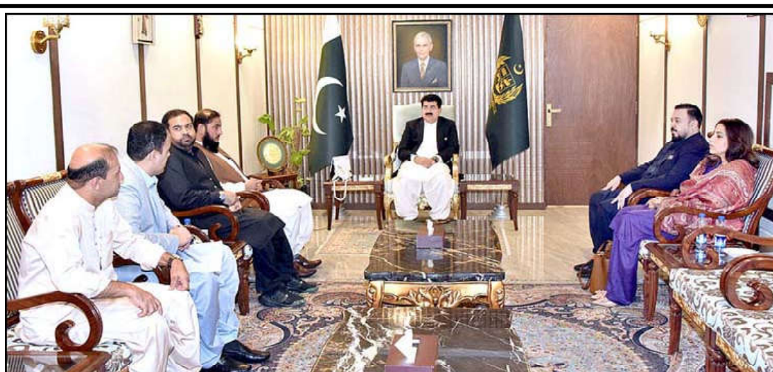
ISLAMABAD: A delegation of Gwadar Chamber of Commerce and Industries (GCCCI) calling on Chairman Senate, Muhammad Sadiq Sanjrani, at the Parliament House.

The services' imports increased by 19.57 percent by going up from $2,729 million last year to $3,263 million during the first four months of current fiscal year. Based on the figures, the services' trade deficit increased by 116.66 percent during the period under review by going up from $390 million last year to $847 million this year. Meanwhile, on year on year (YoY) basis, the services' exports from the country increased by 5.63 percent by going up from $621.07 million in October.