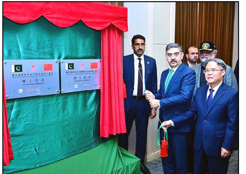
GWADAR: Caretaker Prime Minister Anwaar-ul-Haq Kakar unveils the plaques to inaugurate the completed Pak-China Friendship Hospital Project and the China-Aid Gwadar Seawater Desalination Project.