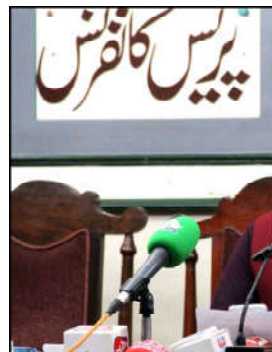
Asim Munir. The Minister Information stated so while addressing a hurriedly called

Independent Report QUETTA: The caretaker Provincial Minister for Information, Jan Achakzai has stated that the process of repatriation of illegal immigrants is continued at a fast pace.