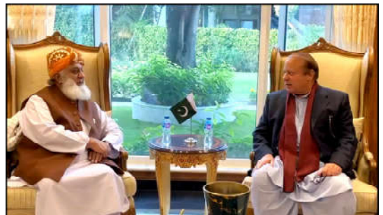
LAHORE: Chief of Jamiat Ulema-e-Islam (F) Maulana Fazlur Rehman meeting with PML-N Quaid Nawaz Sharif.