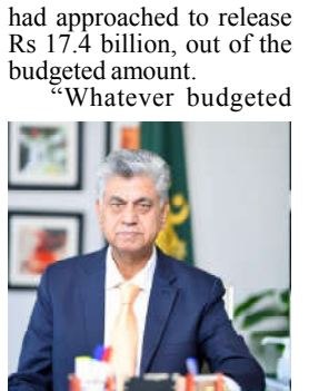
ISLAMABAD: Caretaker Minister for Information and Broadcasting and Parliamentary Affairs Murtaza Solangi.

ISLAMABAD (APP): Caretaker Minister for Information and Broadcasting and Parliamentary Affairs Murtaza Solangi on Monday ruled out any "crisis on meeting the financial needs of the ECP" in order to hold free, fair and transparent general elections in the country. "The Cabinet had approved Rs 42 billion for the budgetary needs of the ECP. An amount of Rs 10 billion was already released," the minister wrote on X formerly Twitter. He said the Election Commission of Pakistan