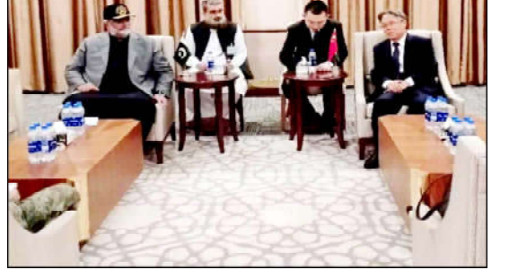
GWADAR: Chinese Ambassador in Pakistan Jiang Zaidong meeting with Caretaker Chief Minister Balochistan Mir Ali Mardan Khan Domki

had approached to release Rs 17.4 billion, out of the budgeted amount. "Whatever budgeted amount is needed by the ECP, will be released as per its needs accordingly," Solangi added.