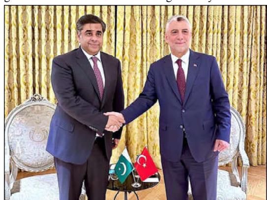
ISTANBUL: Caretaker Minister of Commerce and Industries, Dr. Gohar Ejaz meeting the Turkish Trade Minister H.E. Dr. Omer Bolat on the sidelines of the 39th Ministerial of COMCEC.