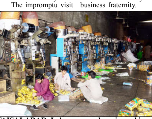
FAISALABAD: Labourers are busy in packing of snacks (Paparr) in a local factory in the city.