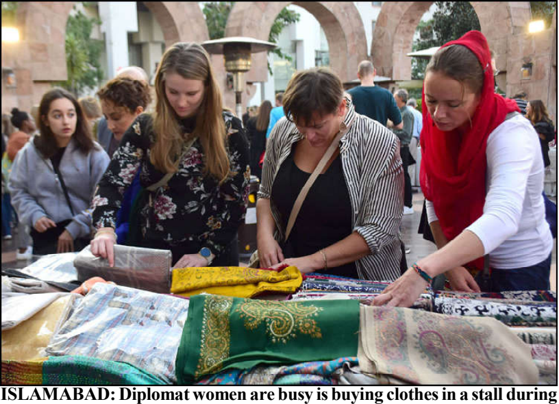
Annual Christmas Market organized by German Embassy at a local hotel in

As the conference unfolds, expectations are high for fruitful discussions and partnerships that will not only elevate Pakistan's IT industry but also contribute to the growth and development of the Qatari technology sector.