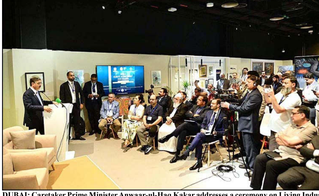
DUBAI: Caretaker Prime Minister Anwaar-ul-Haq Kakar addresses a ceremony on Living Indus Initiative at COP-28 Pakistan Pavilion.

This initiative, he said, suggested that "we need a minimum indicative investment between US$11 and US$17 billion over the next 15 years to mobilize from the public sector, private sector, citizens, and com-