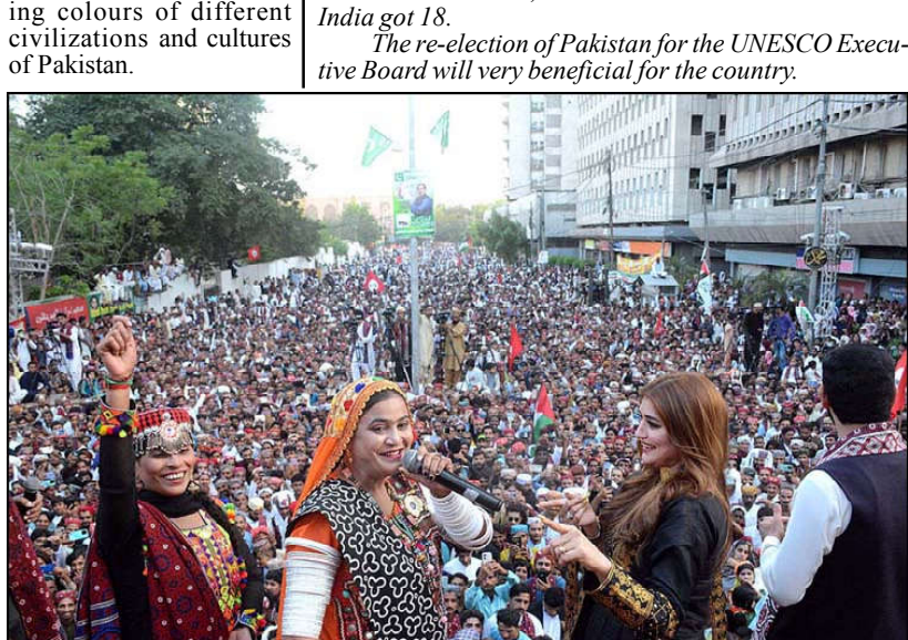
KARACHI: Folk singer performing Sindhi song during celebration of Sindhi Ajrak Topi Culture Day at Karachi Press Club.