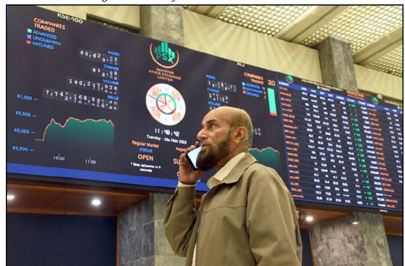
KARACHI: Pakistani stockbrokers monitor the share prices during a trading session at the Pakistan Stock Exchange (PSX) as The Pakistan Stock Exchange (PSX) witnessed a historic surge in intraday trade as the benchmark index.

About tourism, he said that the scenic valleys of northern areas of Pakistan are more beautiful than Switzerland but Pakistan should make these areas easily accessible for the tourists.