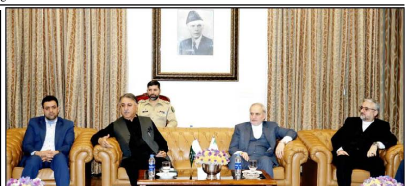
QUETTA: A delegation led by Iranian Ambassador to Pakistan, Raza Amiri Moghaddam meeting with Governor Balochistan, Malik Abdul Wali Khan Kakar.

As a traditional Kuwaiti welcoming gesture, the caretaker prime minister was also presented "Kahwa" upon his arrival.