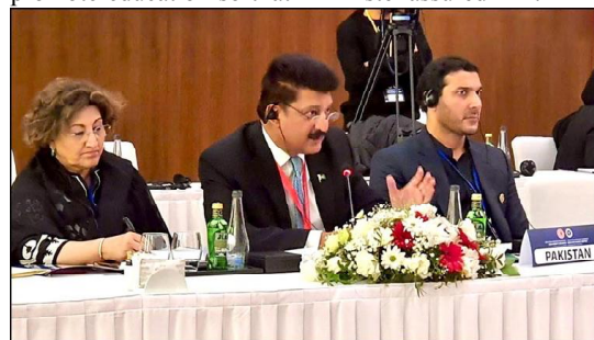
TURKIYE: Opposition Leader in Senate, Senator Dr Shahzad Waseem addressing on Asian Parliamentary Assembly (APA) Executive Council meeting.

our society remains bright. He further said that only quality education can change the destiny of nations. Teachers are national builders, they must guide students to the right path and prepare them for any new challenges in life, he added. On the occasion, the principal of Boys High School Qasim Khan Hameed Ullah briefed to minister on which minister assured him.