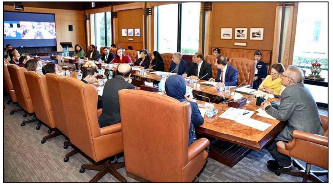
ISLAMABAD: President Dr. Arif Alvi chairing a meeting on mental health issues in Pakistan, at Aiwan-e-Sadr.

He called for improving the effectiveness of the Humraaz app, besides strengthening the mental health support system in the country. He highlighted that mental health was a major concern for Pakistan which required coordinated efforts by both the public and private sectors to utilize their expertise. He further emphasized the need for an integrated approach on all mental health-related programmes and initiatives to effectively address the mental health challenge being faced by the country.