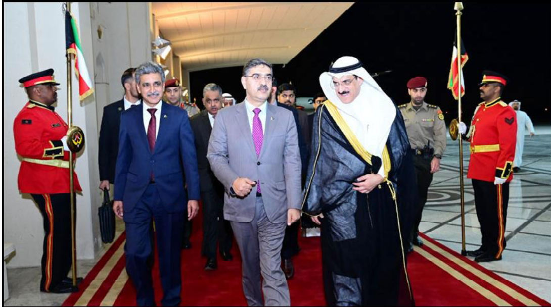
KUWAIT: Kuwait's Minister for Electricity, Water and Renewable Energy Dr Jassim Mohammed Abdullah Al-Ostad receiving Caretaker Prime Minister Anwaar-ul-Haq Kakar upon arrival of a two-day official visit to meet the Kuwaiti leadership

Ph: 2841470/2841473 Vol: XVIII No. 323, Jamadi-ul-Awwal 13, 1445 AH Tuesday NOVEMBER 28, 2023, Pages 08, Price Rs.15