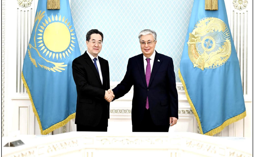
ASTANA: Chinese Vice Prime Minister Ding Xuexiang meeting with Kazakhstan President Kasym-Jomart Tokayev