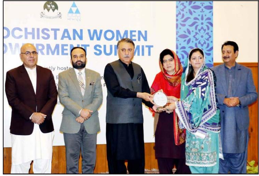
QUETTA: Governor Balochistan, Malik Abdul Walk Khan Kakar giving away awards to best performers during first Balochistan women summit organized by the Provincial Information Department in collaboration with the Pakistan Poverty Alleviation Fund.