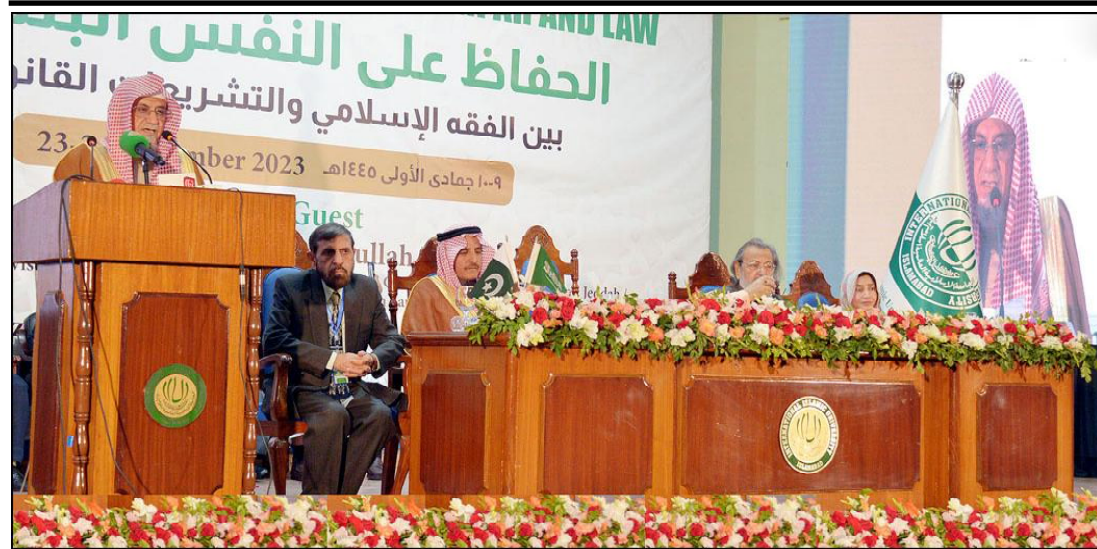
ISLAMABAD: Imam-e-Kaaba, Professor Dr. Saleh bin Abdullah bin Humaid addressing a ceremony held at the Faisal Masjid Campus of International Islamic University, Islamabad (IIUI).