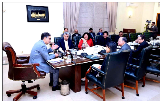
ISLAMABAD: A delegation of All Pakistan Newspapers Society calls on the Caretaker Prime Minister Anwaar-ul-Haq Kakar

Caretaker Information and Broadcasting Minister Murtaza Solangi, Federal Information Secretary and relevant senior officers also attended the meeting.