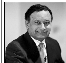
By Husain Haqqani

Imran Khan's PTI rushed to condemn the recent meeting between former prime minister Nawaz Sharif and the US ambassador to Pakistan, Donald Blome, as "a significant intrusion into Pakistan's internal matters."