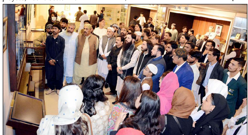
ISLAMABAD: A group of Youth Representatives along with Tribal elders from Balochistan visiting Senate Museum at Parliament house.

He said Israel was targeting civilians and infrastructure in densely populated civilian areas, which constituted war crimes. The ameer said there was no respite for the people of Palestine, who had been enduring worst violence of modern age for the past several days. He demanded that murderers and oppressors should be punished for their crimes against humanity. He asked people to boycott all products of Israel. He also called on international community to play its role for stopping bombing on Palestine. He said that so far the world had abjectly failed to protect Gaza's hapless citizens from Israel's attacks.