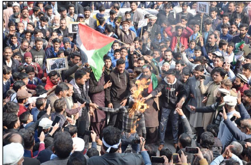
MUZZAFFERABAD: People burn the effigy of Israeli Prime Minister Netanyahu during protest at Garhi Dupatta Chowk, to show solidarity with oppressed Muslims of Palestine, in the Capital of A.J.K.

The chief minister also extended his heartfelt felicitations to the High Commissioner on the brilliant win of the Australian Cricket Team in the ICC Cricket World Cup, 2023. Talking to the delegates, the Chief Minister said that it was the top priority of his government to serve the people to the maximum and to promote good governance in all the departments and sectors of the province.