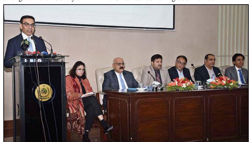
ISLAMABAD: Caretaker Minister for Energy, Power and Petroleum Muhammad Ali addressing during seminar on "Renewable Energy, the Way Forward" at Information Service Academy.

FY 2022-23. Further, SNGPL has laid and commissioned various major operational phases of 16" dia, 12" dia, 8" dia, 6" dia and 4" dia for Peshawar interior city, Cantonment, Warsak Road, Hayatabad, Pabbi and Kohat areas FY 2022-23. Similarly, in the current Fiscal Year, SNGPL is carrying out several mega projects for ensuring smooth supply of gas to our esteemed consumers specially during cooking hours. These include laying of 10" dia x 20.8 Km Charsadda-Peshawar line transmission line, laying of 16" dia x 11.2 KMs operational phase line in Kohat, laying of 6" x 10.5 KM operational phase line in Charsadda. Apart from these, work on operational phases for further augmenting the network of walled city. Peshawar are also in progress. After completion of these mega projects, gas availability of Peshawar, Charsadda, Sardheri, Kohat cities will improve. In addition to this, SNGPL Peshawar is carrying out 403 KM of rehabilitation project during the current FY i.e. 2023-24.