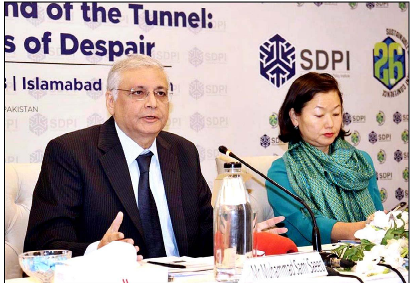
ISLAMABAD: Caretaker Minister for Planning Development & Special Initiatives, Muhammad Sami Saeed addresses at the 26th Sustainable Development Conference (SDC) organized by the Sustainable Development Policy Institute (SDPI).

It is noted that Pakistan has vast potential for foreign investment in the fields of agriculture as Pakistan is a semi-industrialized economy with a well-integrated agricultural sector that contributes 22.9 per cent to Gross Domestic Product (GDP) and creates 37.4 per cent of jobs, ensures food security and provides raw materials for industry.