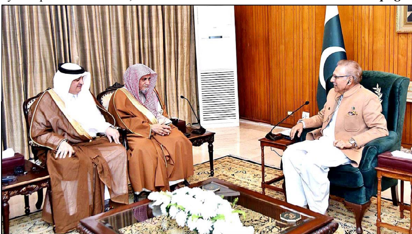
ISLAMABAD: President Dr. Arif Alvi in a meeting with Imam Khatib of Masjid Al-Haram and Advisor at Saudi Royal Courts of Saudi Arabia, Dr. Saleh bin Abdullah Humaid, at Aiwan-e-Sadr