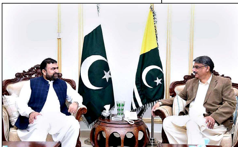
ISLAMABAD: Caretaker Federal Minister for Interior Sarfraz Ahmed Bugti in a meeting with the Prime Minister of Azad Jammu and Kashmir Chaudhry Anwar ul Haq