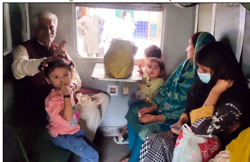
LARKANA: Sikh Pilgrims are leaving from Larkana on a special train to participate in celebrations of the birth anniversary of Baba Guru Nanak in Nankana Sahib, at Railway Station in Larkana.

The dwellers of area demanded of the SNGPL authorities to take notice of the Sui gas crisis and resolve it immediately so that they may not suffer any more due to the issue in extreme winter.