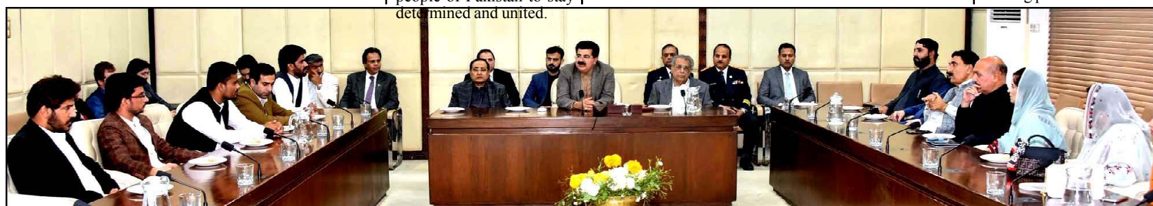
ISLAMABAD: Chairman Senate, Muhammad Sadiq Sanjrani in a meeting with the students and faculty members of Law Department of University of Turbat held at Parliament House in Islamabad