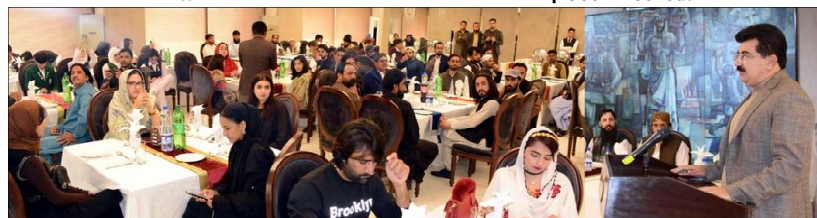
Chairman Senate, Muhammad Sadiq Sanjrani addressing the youth representatives alongwith tribal elders from Balochistan at Parliament House, Islamabad.