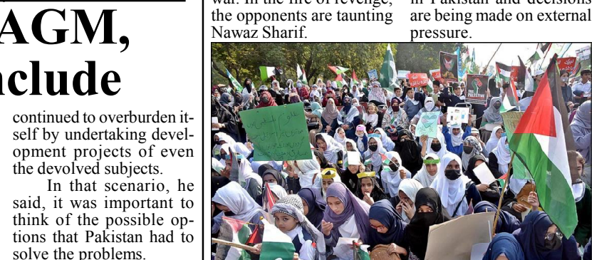
ISLAMABAD: Students carrying Palestinian flags, banners and placards as they hold pro-Palestinian demonstration to show solidarity with Palestinians outside Faisal Mosque.

continued to overburden itself by undertaking development projects of even the devolved subjects. In that scenario, he said, it was important to think of the possible options that Pakistan had to solve the problems. "In the short to medium term, there is no doubt that Pakistan needs to turn towards the IMF (International Monetary Fund) for support," he said, adding a typical IMF programme required countries to focus on reducing fiscal deficits, and employ tight monetary policy. In recent years, he said, the IMF had pressed Pakistan to reform its state-owned enterprises' governance and energy sectors on a priority basis. Faisal Rashid said in the medium to long term, Pakistan needed to develop an economic reforms plan.