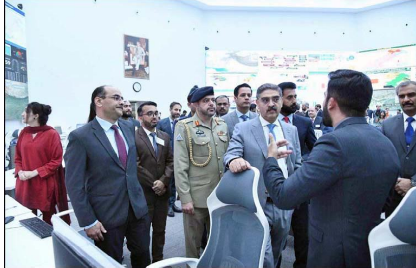
ISLAMABAD: Caretaker Prime Minister Anwaar-ul-Haq Kakar interacting with team members and officers during his visit to National Emergency Operation Centre.