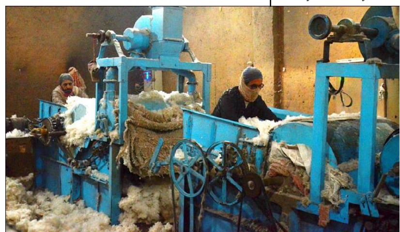
PESHAWAR: Workers busy in preparing cotton before making quilt on his workplace at factory in Dabgari Bazaar.