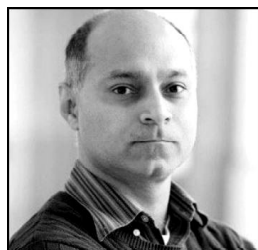
By Khurram Husain

The state, the economy and the people pull the resource envelope of the country in different directions. This is especially the case when periods of macroeconomic adjustments get going, meaning when an IMF programme is being implemented.