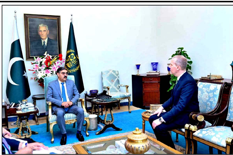
ISLAMABAD: Ambassador of the Russian Federation to Pakistan, Danila Ganich calls on caretaker Prime Minister Anwaar-ul-Haq Kakar

The participants affirmed that Pakistan Army will continue defending and serving the nation in every possible way; in our journey towards enduring stability and security. The forum urged the proud people of Pakistan to stay determined and united.