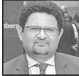
By Miftah Ismai

There is a debate in Pakistan on the foreign trade strategy we should pursue: export promotion, or import substitution? In much of the world, especially Southeast Asia, the debate has been won by export promotion to spectacular effect. We, however, are still confused, trying to carry out the best of both strategies and ending up with the worst of both.