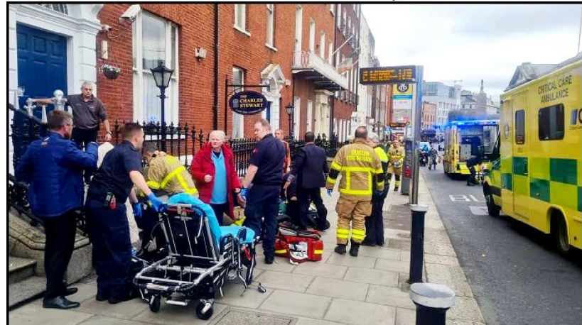
Emergency services at the scene of a suspected stabbing at Parnell Square in Dublin city centre

But in a bulletin on Wednesday evening, the Icelandic meteorological office said the probability of a sudden eruption "is decreasing every day and is considered low" due to declining magma flow and seismic activity.