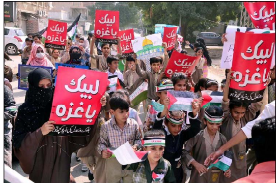
HYDERABAD: Teachers and students of Nation Public School are holding protest demonstration against Israeli cruel and inhumane acts and express unity with the innocent people of Palestine, held in Hyderabad.

Gujranwala with 780 cases. The situation is still continuing, with Lahore reporting an additional 124 new dengue cases, Rawalpindi with 25, Multan with 16, Gujranwala with 24, Faisalabad with 04 while Narowal reported 04 cases in the last 24 hours. Sahiwal reported 03 case of dengue virus whereas Sheikhupura, Chakwal and Sialkot each recorded 02 new cases of dengue in the same time frame. Kasur, Attock, Sargodha.