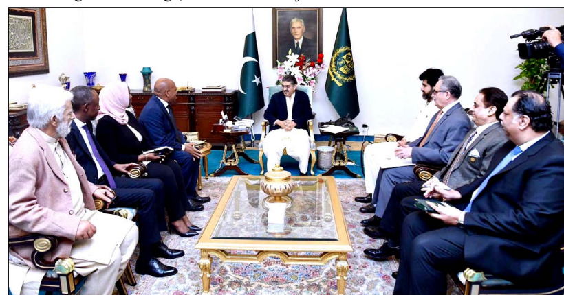
ISLAMABAD: President of the Senate of the Republic of Rwanda, Dr. Kalinda Francois Xavier calls on Caretaker Prime Minister Anwaar-ul-Haq Kakar.