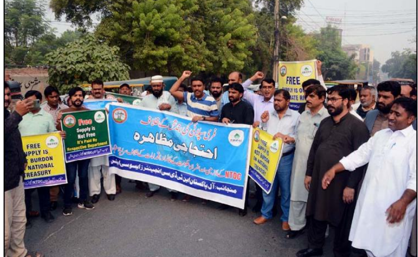
MULTAN: Members of All Pakistan NTDC Engineers Association are holding protest demonstration for acceptance of their demands, held at Multan press club.