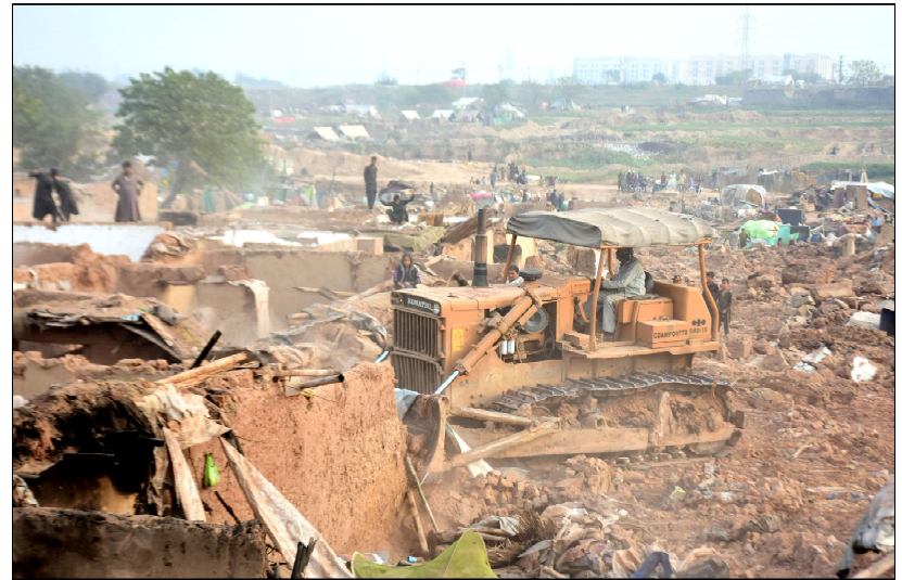
ISLAMABAD: Workers are demolishing the illegally contracted houses at Afghan Basti I-12 as govt announce warning for people living in Pakistan illegally to leave the country as security forces on Wednesday rounded up, detained and deported dozens of Afghans who were living in the country illegally, after a government-set deadline for them to leave

At the same time, Ambassador Akram pushed for a "much more robust effort" to counter the rise of racial hatred, religious supremacy and extreme and violent nationalism and fascism in certain parts of the world. "Islamophobia is a major element of the new phenomena manifested in the discrimination and attacks against Muslims, hijab 'bans', the repeated burning of the Holy Quran, blasphemous caricatures and the vandalization of Islamic symbols and holy sites," he said, adding that such acts cannot be allowed under the cover of "freedom of expression". "In our eastern neighbourhood -- India -- the pandemic of Islamophobia poses the danger of Muslim genocide," the Ambassador Akram said, saying that the menace should be frontally dealt with by the Council.