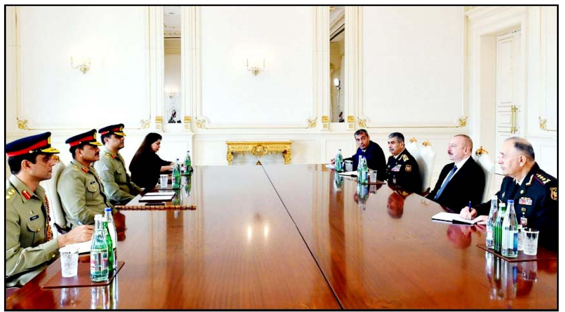
BAKU: Chief of Army Staff General Syed Asim Munir meeting with President of Republic of Azerbaijan Ilham Aliyev