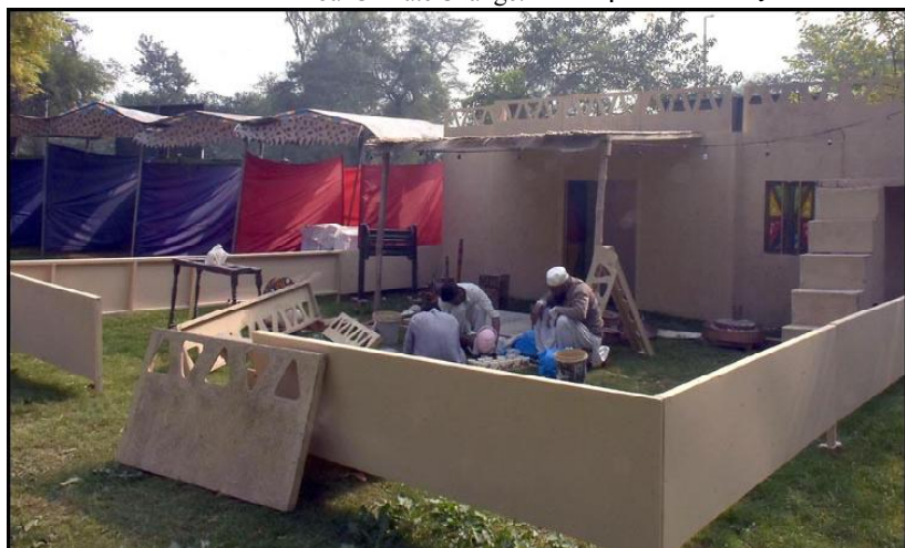
ISLAMABAD: Workers busy in preparing Sindh pavilion for upcoming Lok Mela in Lok Virsa.

He explained that in 2024, 25 awareness campaigns will be held in 67 selected districts that report poor maternal nutrition indicators. DG Health said that improving the knowledge and capacity of healthcare providers to address maternal nutrition issues and promote a collective responsibility approach is the need of the hour. The key objective of the campaign is to raise awareness about the importance of maternal nutrition and improve the capacities of health workers in public.