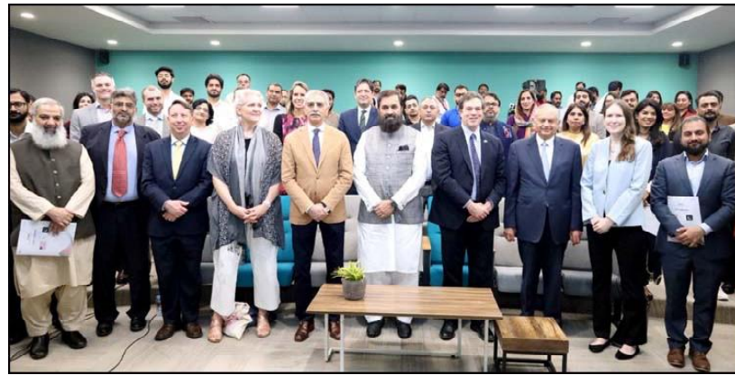
LAHORE: Governor Punjab Muhammad Balighur Rehman in a group photo with participants of an inaugural ceremony of "Tabeer" project at LUMS University National Incubation Center.

based on advanced Smart and Safe City concepts. The primary objective of the project was to establish governance processes that leverage technology and digital systems to manage city-wide resources in real-time through the Command and Control Centre. All systems would be interconnected using fast, reliable, and secure GPON, he added. The MD mentioned that key systems integrated into this project.