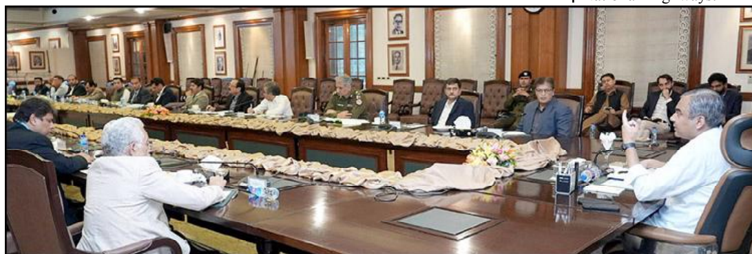
LAHORE: Chief Minister Punjab Mohsin Naqvi presiding over a meeting at CM office with regard to take stock of the smog situation.

Mayor Karachi Barrister Murtaza Wahab briefed the World Bank delegation about the structure of the local government system and the management of civic affairs in Karachi. He said that the city is divided into 46 towns and thousand wards, each UC chairman represents his area in the KMC council and at the lower level.