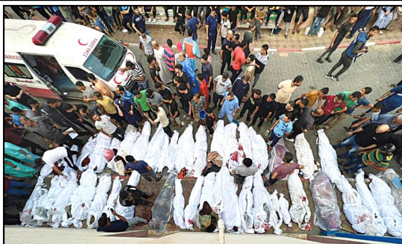
Palestinian fighters offered stiff resistance to invading forces, but the relentless Israeli bombing of the besieged enclave claimed at least 50 lives in the Jabalia refugee camp.

into shelters for hundreds of displaced families. On Tuesday, Tel Aviv said it struck 300 targets during its fourth night of land operations in northern Gaza. Warplanes kept up a relentless barrage of strikes on Gaza, while Israel also claimed that its forces were engaging Hamas fighters inside their vast tunnel network beneath Gaza. "Over the last day... IDF struck approximately 300 targets, including anti-tank missile and rocket launch posts below shafts, as well as military compounds inside underground tunnels belonging to Hamas," an Israeli military statement said. Footage from the Israeli military showed tanks and armoured bulldozers churning up bomb-scarred dirt tracks and troops going from building to building. In addition, AFP images showed plumes of smoke rising above Gaza and Israeli helicopters raining down rockets on the northern Gaza Strip.