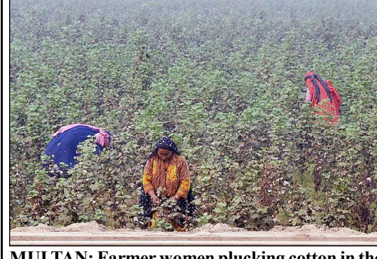
MULTAN: Farmer women plucking cotton in the field at Central Cotton Research Institute.

ISLAMABAD (APP): The per tola price of 24 karat gold decreased by Rs1,200 to Rs.211,800 on Wednesday as compared to its sale at Rs 213,000 on last trading day. The price of 10 grams of 24 karat gold also decreased by Rs1,029 to Rs181,584 from Rs182,613 whereas the price of 10 gram 22 karat gold went down to Rs166,452, the All Sindh Sarafa Jewellers Association reported.