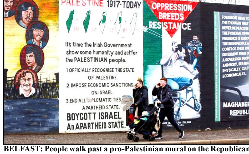
BELFAST: People walk past a pro-Palestinian mural on the Republican Falls Road.

The facility is expected to include an observatory with a satellite ground station, and should help China "fill in a major gap" in its ability to access the continent, the Center for Strategic and International Studies (CSIS) said in a report this year. The station is also well situated to collect signals intelligence over Australia and New Zealand and telemetry data on rockets launched from Australia's new Arnhem Space Centre, it said. China rejects suggestions that its stations would be used for espionage. The two icebreakers, Xuelong 1 and Xuelong 2, the name means "Snow Dragon" in Chinese, set sail from Shanghai with mostly personnel and logistics supplies on board. The cargo ship "Tianhui", or "Divine Blessings", taking construction material for the station, set off from the eastern port of Zhangjiagang.