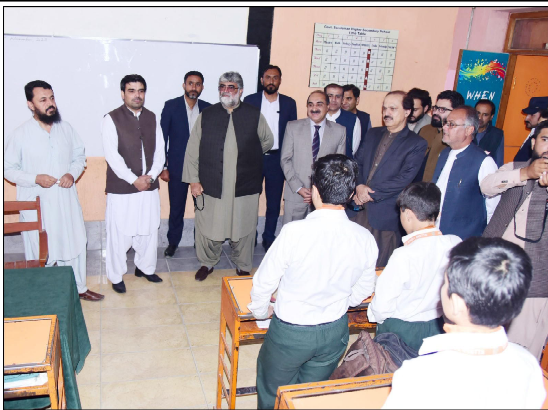
QUETTA: Caretaker Chief Minister Balochistan Mir Ali Mardan Khan Domki talking with students during his visit to Sandaman High School

ISLAMABAD (APP): The Petroleum Division (PD) of the Energy Ministry on Wednesday rejected a news item appearing in a section of media about the effectiveness of the new gas tariff from back date, clarifying that the revised prices would be applicable from November 1, 2023. "Reports in some newspapers claiming that the prices are effective from back date, which is misleading. It is categorically stated that gas price revision is effective from November 01, 2023" a news release said. The ministry further said that the press release issued by the petroleum division after approval of the cabinet and Economic Coordination Committee (ECC) on October 30 clearly stated that the revision of gas prices would be effective from November 1.