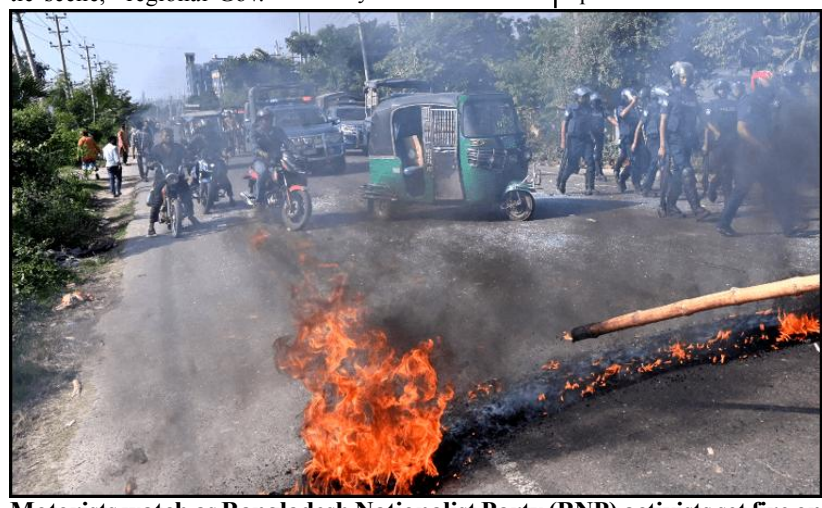
Motorists watch as Bangladesh Nationalist Party (BNP) activists set fire on a road as they attempt to block a highway during clashes with the police in Arahazar, some 40km from Dhaka.