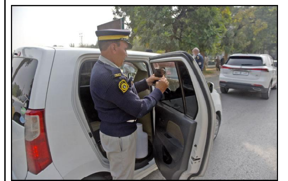
ISLAMABAD: Traffic Police Warden is removing black paper from the window screen of a car at Sector G-7 in Federal Capital.