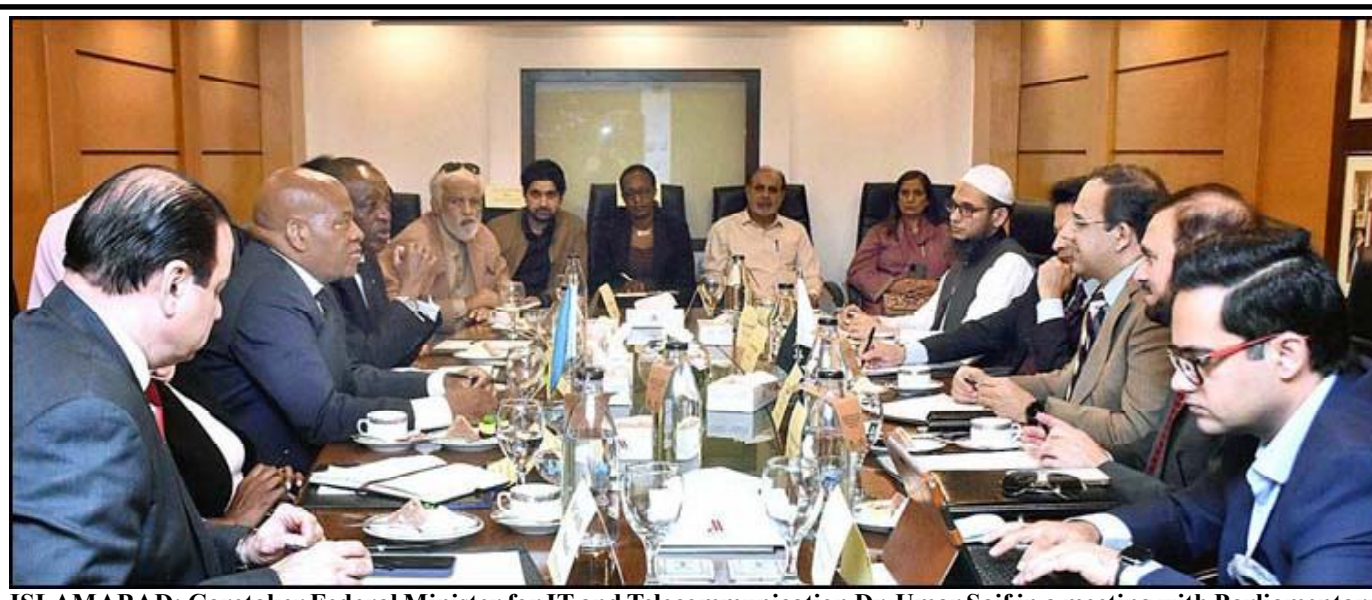
ISLAMABAD: Caretaker Federal Minister for IT and Telecommunication Dr. Umar Saif in a meeting with Parliamentary delegation of Rwanda.