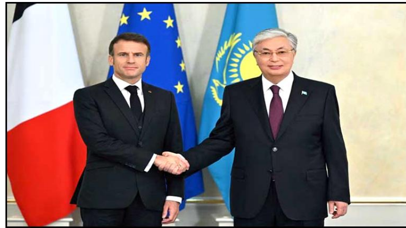
ASTANA: French President Emmanuel Macron meeting with Kazakh President Kassym-Jomart Tokayev, in Kazakhstan.

Monitoring Desk SEOUL: US Secretary of State Antony Blinken will visit South Korea on Nov 8 and 9 to discuss North Korea and alliance issues with Foreign Minister Park Jin, South Korea's foreign ministry said on Wednesday. Park and Blinken will also discuss economic security, cooperation on industrial technology and regional issues of mutual interest, the ministry said. The visit marks the first by a US secretary of state in two and a half years. It comes amid heightened security cooperation between the allies and growing concerns about North Korea's military cooperation with Russia.