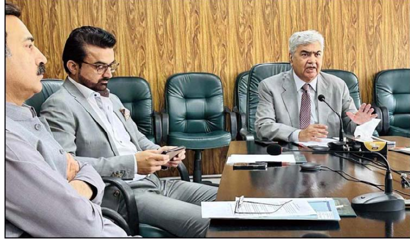
ISLAMABAD: Federal Minister for National Food Security & Research Dr. Kausar Abdullah Malik chairing a meeting of All Pakistan Solvent Extractors Association at Ministry of NFS&R.

25.5% on a year-on-year (YoY) basis in October 2023 as compared to an increase of 29.7% in the previous month and 24.6% in October last year. On a month-on-month (MoM) basis, it increased to 1.1% in October 2023 as compared to an increase of 1.7% in the previous month and an increase of 4.5% in October 2022. On the other hand, the rural CPI increased to 28.9% on a year-on-year basis in October 2023 as compared to an increase of 33.9% in the previous month and 29.5% in October 2022. On a month-on-month basis, the inflation increased to 1.1 percent in October 2023 as compared to an increase of 2.0 percent in the previous month and an increase of 4.7 percent in October 2022. The urban CPI inflation increased to