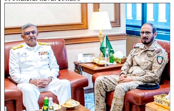
RIYADH: Chief of the Naval Staff, Admiral Naveed Ashraf exchanges views with Chief of the General Staff of Saudi Armed Forces, General Fayyadh Bin Hamed Al-Ruwaili during meeting held at Royal Saudi Naval Forces (RSNF) Headquarters in Riyadh

The Commander RSNF appreciated Pakistan Navy's role in support of collaborative maritime security in the region and acknowledged the significance of strong bilateral defence collaboration.