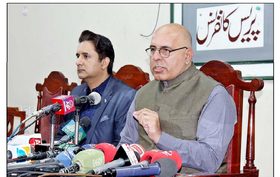
The caretaker Minister Information was addressing a press conference along with other officials.

The action is being taken against all those residing in the province with-