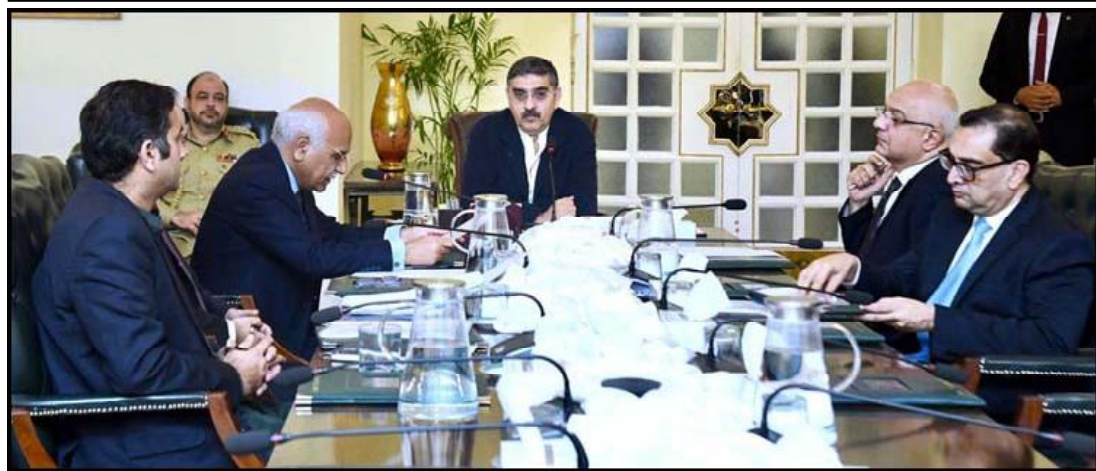
ISLAMABAD: Caretaker Prime Minister Anwaar-ul-Haq Kakar chairs a meeting regarding the Benazir Income Support Program (BISP).