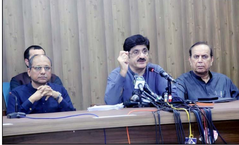
KARACHI: Peoples Party senior leader and former Sindh Chief Minister Syed Murad Ali Shah along with others addresses to media persons during press conference held at PPP Bilawal House Media Cell in Karachi.