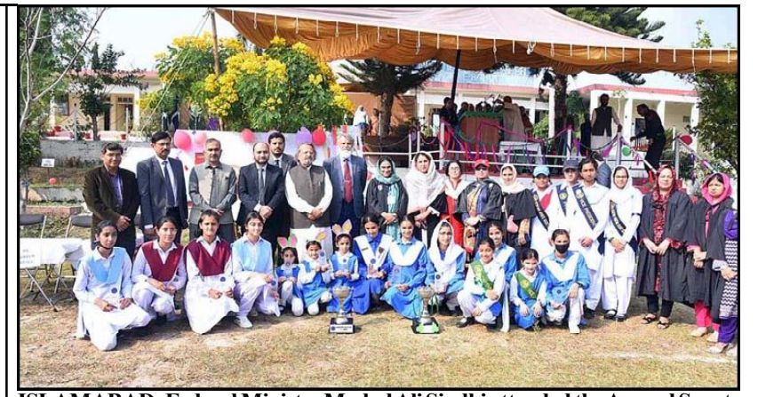
ISLAMABAD: Federal Minister Madad Ali Sindhi attended the Annual Sports Day of Islamabad Model College for Girls F-8/1.

He said the Lok Mela, which was scheduled to take place from November 3 to 13 at the Lok Virsa Complex in Shakarparian, would be more than a mere exhibition of Pakistan's heritage.