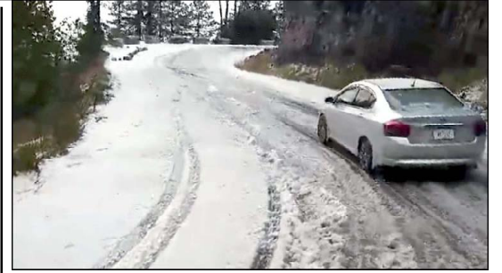
ABBOTTABAD: An eye-catching view of a snow covered area during the first heavy snowfall of winter season, which more decreases the temperature below in minus degree Celsius, at Ayubia Koza Gali road in Abbottabad on.