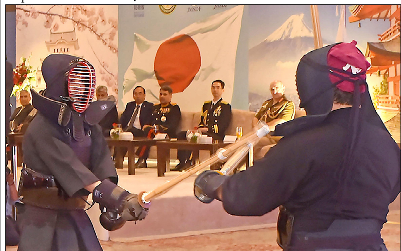
ISLAMABAD: Japanese Players are demonstrating the Martial Arts performance during an event regarding the celebrations of the Japan Self-Defense Forces Day 2023 at local hotel in Federal Capital.