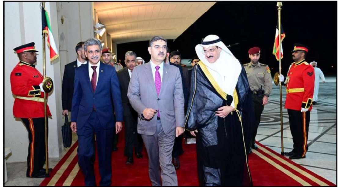
KUWAIT: Kuwait's Minister for Electricity, Water and Renewable Energy Dr Jassim Mohammed Abdullah Al-Ostad receiving Caretaker Prime Minister Anwaar-ul-Haq Kakar upon arrival of a two-day official visit to meet the Kuwaiti leadership

Martial law legal should also be tried. He further remarked why the action was taken on November 3 steps. The action will be taken in regard to attack on judges on November 3 then question of fair trial will rise. Was attacking the judges more grave matter than suspending the constitution and dissolving assemblies. We should speak the truth. If any decision has to be abolished then it should be abolished. Which gave way to martial law. The CJP remarked what happened in the past I cannot abolish it. If we have to become nation then we have to correct future by seeing the past. Lawyers should come and tell why the pictures of the judges who abrogated the constitution are hung here. Why only judge should point out it while sitting here. Media too is responsible for it. They should also be held accountable. Tell us how many journalists were opponent and how were supporters of the martial law. We should learn lesson from the history. We should teach it to children as well. Justice Athar Minallah remarked history then is this whenever some one grows strong, no one speaks against him. When powerful grown weak then Asima Jillani decision comes.