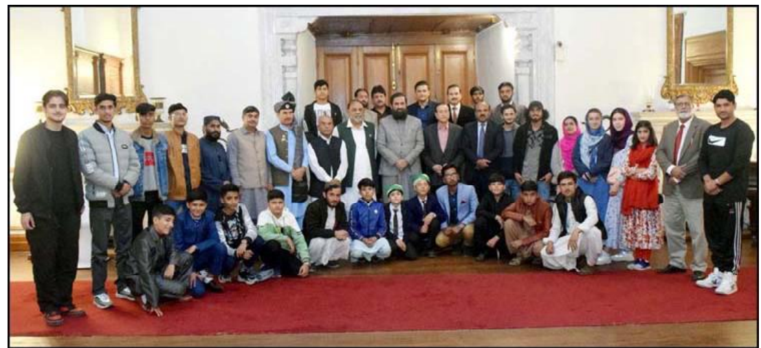
LAHORE: A delegation of students and teachers from various provinces (Caravan of Goodwill and National Unity) under the auspices of the Idara-i-Nazria-i-Pakistan in a group photo with Governor Punjab Muhammad Balighur Rehman at Governor House.

there are institutions like Akhuwat and Edhi Foundation, adding that Pakistan is better than many countries of the world. Punjab Governor Muhammad Balighur Rehman said that people and delegations from different walks of life keep visiting the Governor's House, but the delegation under goodwill and national unity caravan is unique in the sense that it is comprised of four provinces.