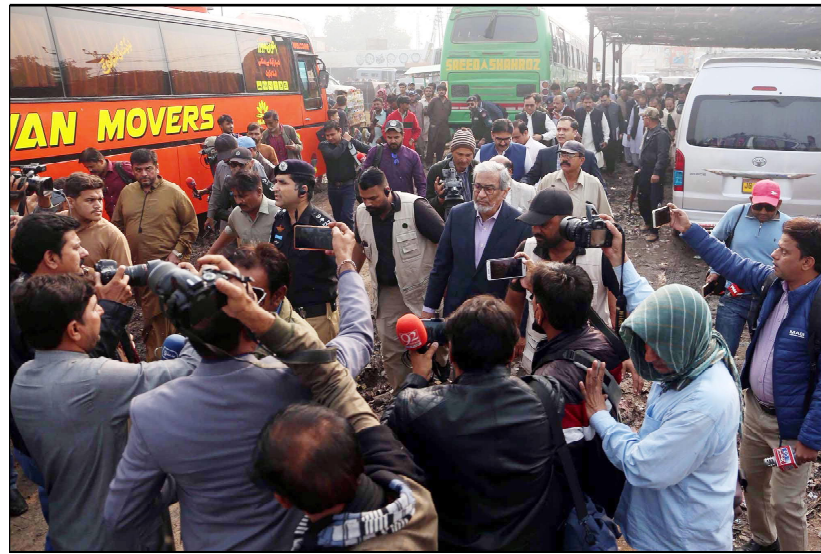
HYDERABAD: Caretaker Sindh Chief Minister Justice (Retd) Maqbool Baqar inspecting Badin Stoop during his visit