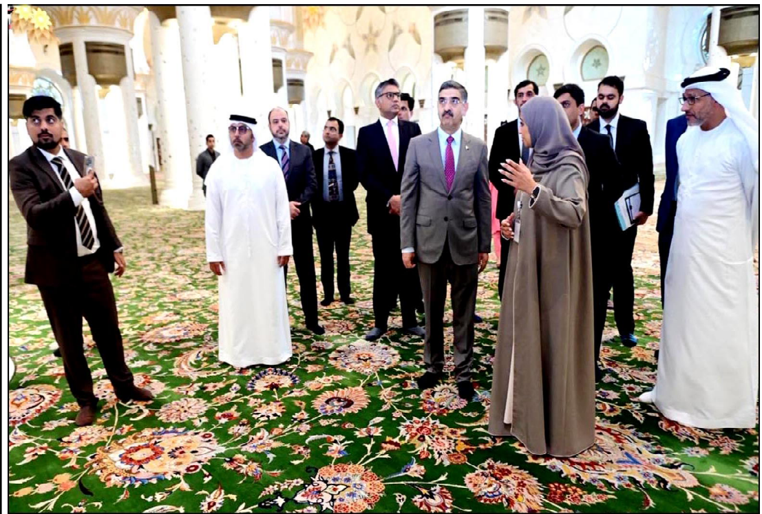
ABU DHABI: Caretaker Prime Minister Anwaar-ul-Haq Kakar visiting the Sheikh Zayed Grand Mosque