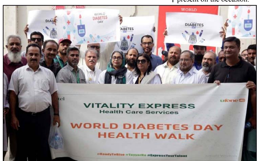
KARACHI: Participants are holding awareness walk on the eve of world Diabetes Day organized by telecommunication Company Limited (PTCL) in Karachi.

KARACHI (INP): Smuggled items worth millions of rupees were confiscated during joint operation of Rangers and Customs in Baldia Yusuf Goth. According to details, on an intelligence tip-off regarding presence of smuggled goods, the Sindh Rangers and Customs raided a godown. During joint operations, 12 trucks of smuggled items including Iranian blankets, confectionary items and other edibles were confiscated. The recovered smuggled items valued Rs120 million in Pakistani market. The customs sealed the godown and started raids to arrest the elements involved in smuggling.