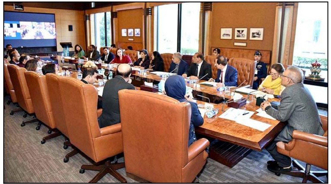
ISLAMABAD: President Dr. Arif Alvi chairing a meeting on mental health issues in Pakistan, at Aiwan-e-Sadr.

scored the need for raising awareness about mental health issues to educate the people about the importance of seeking mental health counselling. The role of the family in providing psychological support and helping manage health issues was also highlighted. During the meeting, the need for collective measures and an integrated approach involving various stakeholders, including relevant ministries, Pakistani psychiatric associations based in the United States and the United Kingdom, and civil society was also stressed.