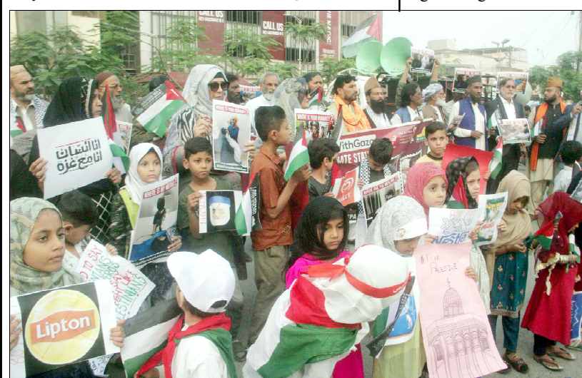
KARACHI: Activists of Palestine Foundation holds protest at Tariq Road to show solidarity with the oppressed Muslims of Palestine.

SUKKUR (INP): Ameer Jamaat-e-Islami (JI), Sirajul Haq has asserted that the proposed national government advocated by Pakistan Peoples Party (PPP) co-chairman Asif Zardari lacks constitutional legitimacy, saying the proposal is designed to perpetuate the dominance of the same feudal and imported technocrats who have held power for decades, thereby preserving the existing status quo. Speaking at an election convention held at Mehran Cultural Centre on Tuesday, he warned against the victory of former ruling parties in the upcoming elections, asserting that it would signify the defeat of Pakistan. Sirajul Haq criticized that its leadership would save the country, questioning the track record of those who previously held power.