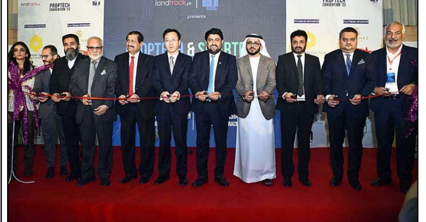
KARACHI: Consul General of China in Karachi Yang Yundong, Consul General of the United Arab Emirates in Karachi Bakheet Ateeq AlRemeithi and Governor of Sindh Kamran Khan Tessori perform the inauguration by cutting ribbon at PropTech Convention & BuildAsia Expo at the Karachi Expo Center.