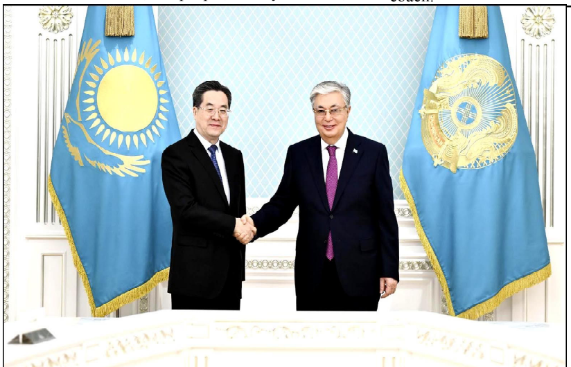
ASTANA: Chinese Vice Prime Minister Ding Xuexiang meeting with Kazakhstan President Kasym-Jomart Tokayev