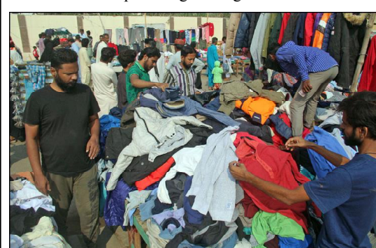
KARACHI: People are buying woolen clothes from vendors after increasing coldness.

While no humanitarian situation is comparable in terms of devastation, these disasters have all affected and continue to affect millions of people, exposing them to disease, hunger, and displacement, with women and children being the most vulnerable.