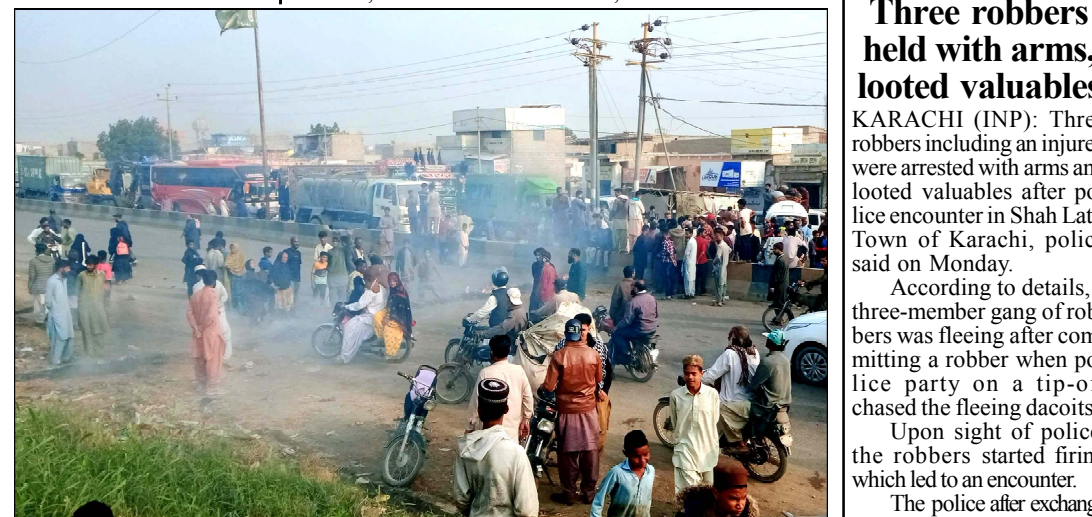
HUB: Residents of Yousaf Goth are blocked road and burn tires as they are holding protest demonstration against prolong electricity and sui gas load shedding in their area, at RCD road in Hub