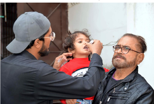
HYDERABAD: Health worker administering polio drop to a child during anti-polio immunization campaign