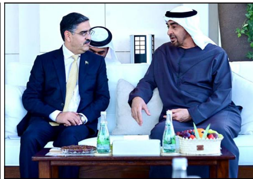
ABU DHABI: Caretaker Prime Minister Anwaar-ul-Haq Kakar meeting with President of the United Arab Emirates Sheikh Mohamed bin Zayed Al Nahyan