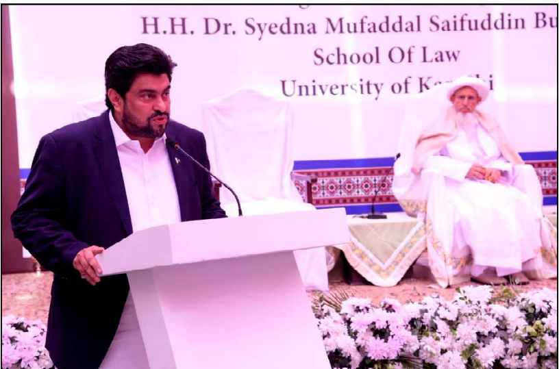
KARACHI: Sindh Governor Kamran Khan Tessori addressing inaugural ceremony of new building of School of Law held at Karachi University