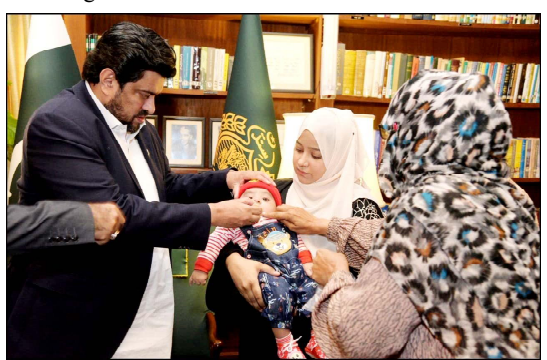
KARACHI: Governor Sindh Kamran Khan Tessori administering polio drop to a child to inaugurate anti-polio immunization campaign