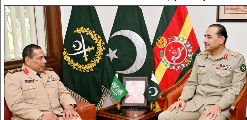
RAWALPINDI: Lieutenant General Fahd bin Abdullah Al-Mutair, Commander of the Royal Saudi Land Forces (RSLF) called on General Syed Asim Munir, NI (M), Chief of Army Staff (COAS) at GHQ.

According to spokesperson of Ministry of Religious Affairs, the collection of Hajj application in 15 designated banks under official Hajj scheme will continue till December 12. According to announcement of Ministry of Religious Affairs, almost about 89605 Pakistanis will perform Hajj under government scheme next year. In case of receiving more than prescribed number of applications, lucky draw will be held. Women will be able to perform Hajj without Maharram for the first time. According to spokesperson, applications can be submitted on valid Pakistani passport till December 16, 2024. Hajj applications can also be processed on passport apply token. Spokesperson of Ministry of Religious Affairs said that quota of 25000 has been allocated under sponsorship scheme.