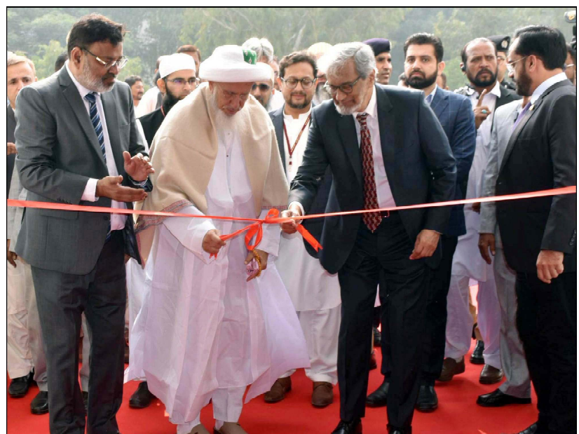
KARACHI: Caretaker Sindh Chief Minister, Justice (Retd) Maqbool Baqar and Syedna Mufaddal Saifuddin, Chief Dawoodi Bohra Jamat inaugurating the New Building of School of Law held at Karachi University

vestment from the United Arab Emirates into Pakistan and will help realize various initiatives envisioned under the Special Investment Facilitation Council (SIFC). The prime minister termed the signing of MoUs as a historic event that will usher in a new era of Pak-UAE economic partnership. During the meeting, Prime Minister Kakar expressed profound gratitude for the UAE's firm support to Pakistan in the economic and financial domain.