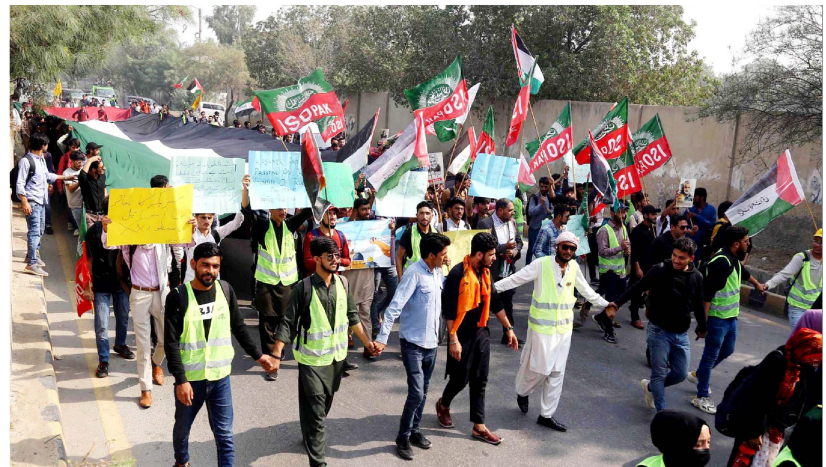
KARACHI: Members of Imamia Students Organization (ISO) holding protest rally against Israeli cruel and inhumane acts and express unity with the innocent people of Palestine, at University road