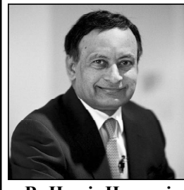
By Husain Haqqani

Imran Khan's PTI rushed to condemn the recent meeting between former prime minister Nawaz Sharif and the US ambassador to Pakistan, Donald Blome, as "a significant intrusion into Pakistan's internal matters." But the party failed to express similar indignation over a letter by eleven US members of Congress belonging to President Biden's Democratic Party, calling for suspension of security assistance to Pakistan pending an inquiry into human rights abuses inside Pakistan. The letter specifically included Imran Khan's name amongst those whose human rights were allegedly being violated. The fact is that there is nothing unusual about either the US ambassador meeting a major political figure in the country where he is posted or American Congressmen expressing their views on the human rights situation of any country. The conduct of foreign relations between nations requires diplomats' meetings with politicians and public figures of all shades. Blome's meeting with Nawaz Sharif is no more an indication of US preferences in Pakistan's politics than his earlier meetings with other party leaders amounted to endorsing anyone for high office. Furthermore, US foreign policy is primarily conducted by the president and his team in the executive branch of government not through letters by small groups of Congressmen and women. Members of the US Con-