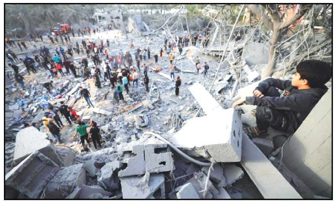
A child looks at the rubble of a house after an Israeli strike in Khan Yunis

The agreement includes a temporary truce of at least four days, which may be extended to a maximum of 10, in which the fighting will be completely paused and will involve the entry into the Strip of between 100 and 300 trucks of food and medical aid and fuel.