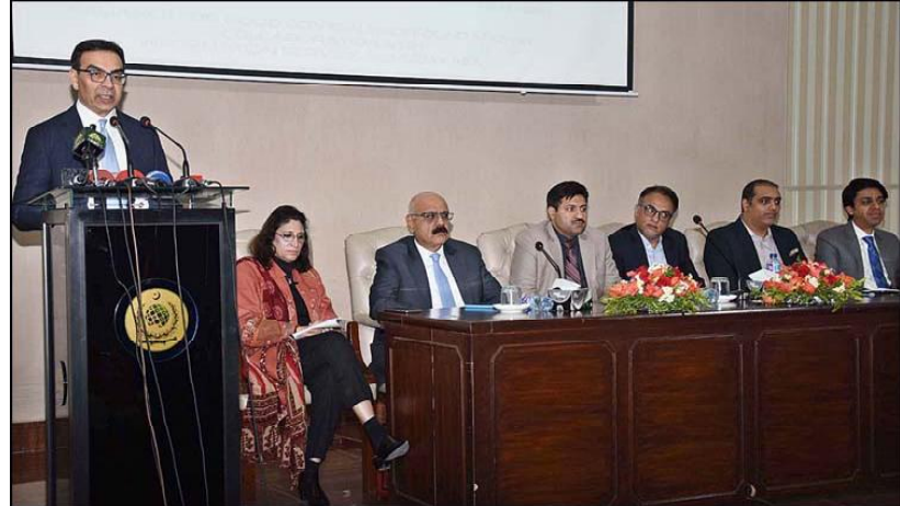
ISLAMABAD: Caretaker Minister for Energy, Power and Petroleum Muhammad Ali addressing during seminar on "Renewable Energy, The Way Forward" at Information Service Academy.