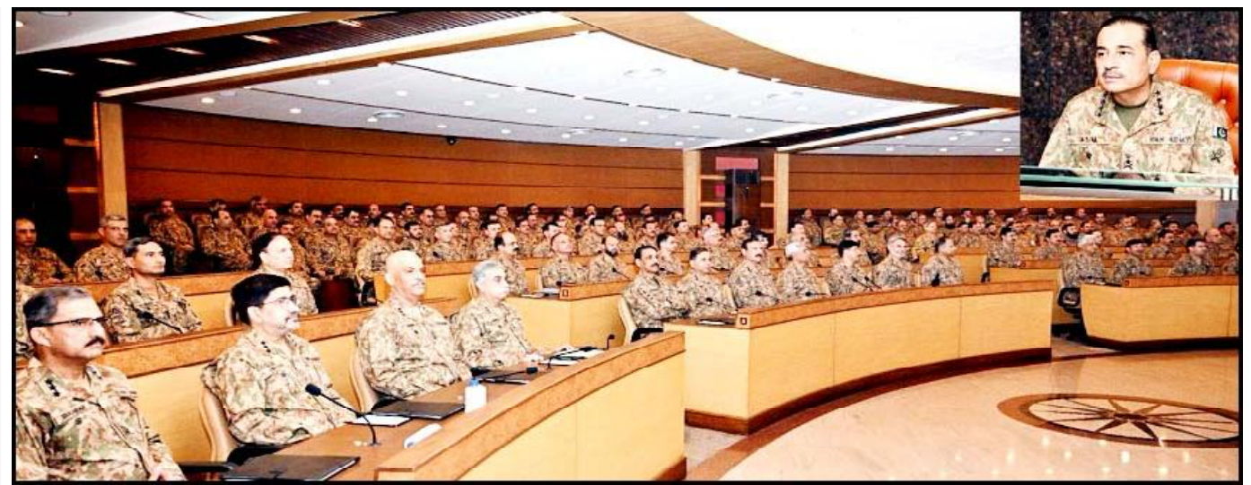
RAWALPINDI: Chief of Army Staff General Syed Asim Munir addressing 82nd Formation Commanders Conference

The forum expressed unequivocal diplomatic, moral and political support to the people of Palestine and reiterated Pakistan's principled stance supporting the two-state solution, based on pre-1967 borders with Al Quds Al Sharif as the capital of Palestine.