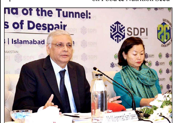
Muhammad Sami Saeed on Thursday said the government remained dedicated to addressing the challenges of climate change as key interventions were being taken under the umbrella of Special Investment Facilitation Council (SIFC).

The minister addressed the thematic session titled, "Impact of Climate Change on Food & Nutrition Security"