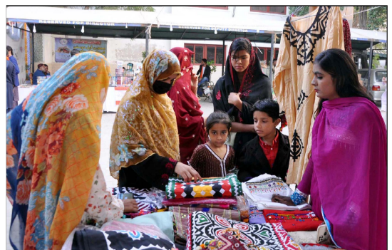
HYDERABAD: Visitors take keen interest at stalls during Sindh Rwadari Festival held at Sindh Museum

"We hope that together these Foreign Ministers will contribute to international consensus with regards to a peace conference on the Middle East and the Palestinian question."