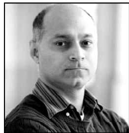
By Khurram Husain

The state, the economy and the people pull the resource envelope of the country in different directions. This is especially the case when periods of macroeconomic adjustments get going, meaning when an IMF programme is being implemented. The state needs revenue. The economy requires liquidity. The people want incomes. Each of these can come from different sources, and they are finite. When the economy is growing, these resources grow in tandem and, for a moment, it seems as if everybody is getting what they want. These are the feel-good years. But when the growth stops, a tug-of-war ensues between the state, big business and 'the people' to secure their respective shares of the pie. Each episode of adjustment looks substantially the same, but differences of detail do emerge. Growth stalls, interest rates rise, the currency is devalued, utility prices rise, taxes are applied. But look at where the resources flow during these times, and you'll get a better idea of who is getting how much when the pie shrinks. An episode of adjustment began in July this year, when the country signed onto its latest IMF Stand-by Arrangement, and its first review just ended successfully. Now look closely at where the resources have gone during these months. Banks declared record-high profits all year. Between July and September of the year, the whole corporate sector