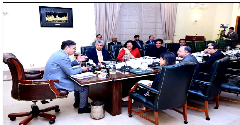
ISLAMABAD: A delegation of All Pakistan Newspapers Society calls on the Caretaker Prime Minister Anwaar-ul-Haq Kakar

The President deeply thanked KSA for its economic support to Pakistan in difficult times as well as for extending humanitarian aid and supporting development projects, especially in the education and healthcare sectors in Pakistan.