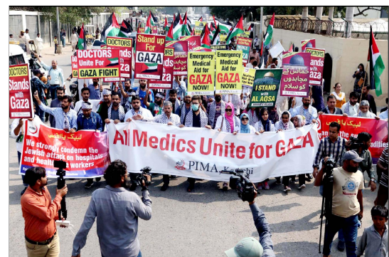
KARACHI: Members of Pakistan Islamic Medical Association (PIMA) are holding protest demonstration against Israeli cruel and inhumane acts and express unity with the innocent people of Palestine, held outside Jinnah Postgraduate Medical Centre (JPMC) building in Karachi