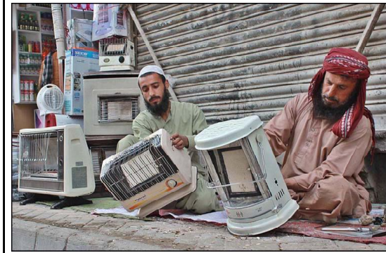
QUETTA: Man repairs gas heater at main Quetta bazaar.