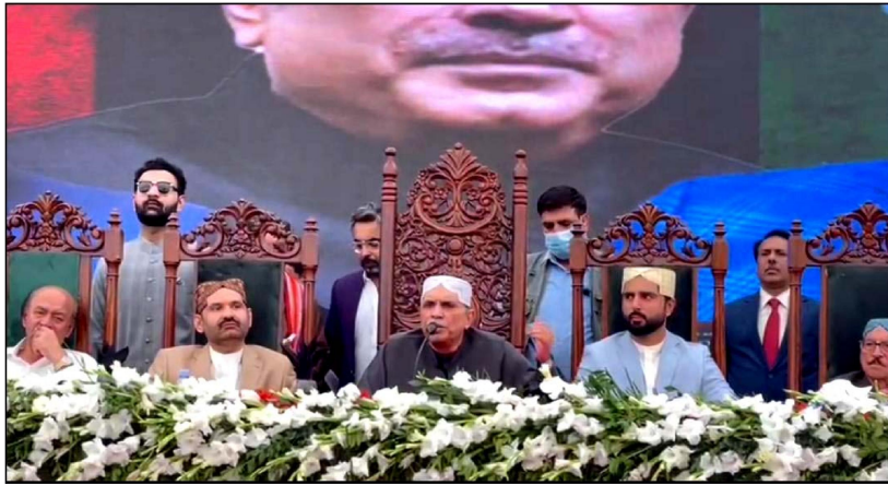
GHOTKI: Former president and chairman Pakistan People's Party Parliamentarians (PPP), Asif Ali Zardari addressing a ceremony in Ghotki