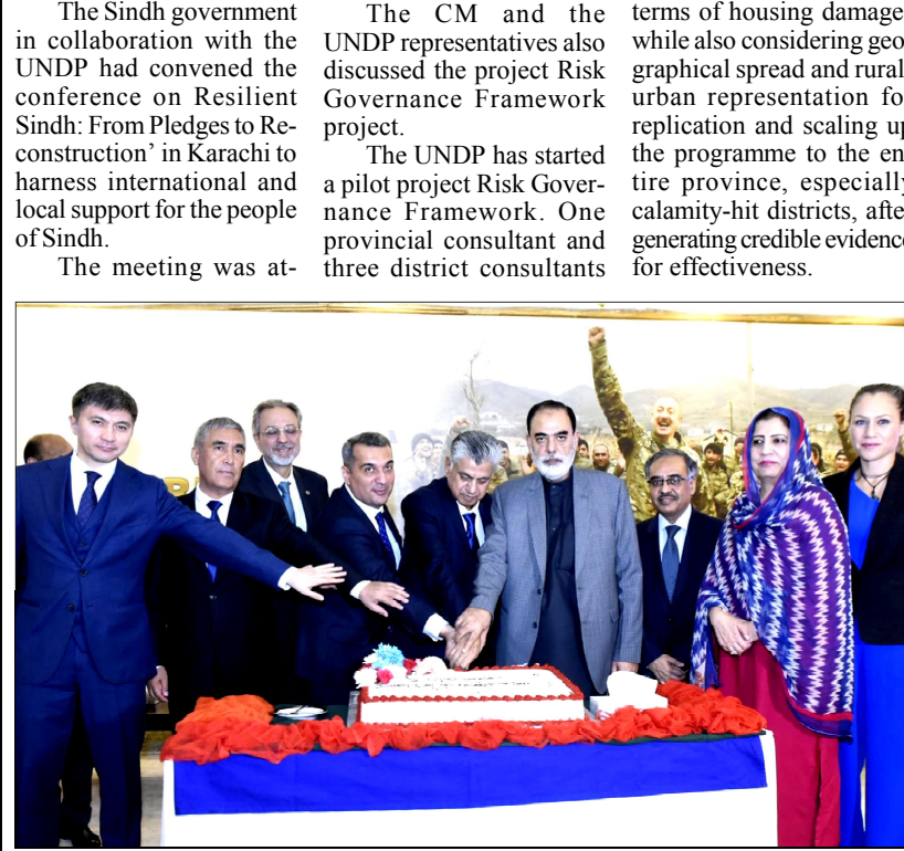
ISLAMABAD: Caretaker Information Minister Murtaza Solangi, Ambassador of the Republic of Azerbaijan to Pakistan Khazar Fahadov cutting the cake along with others on the occasion of the Victory Day of the Republic of Azerbaijan