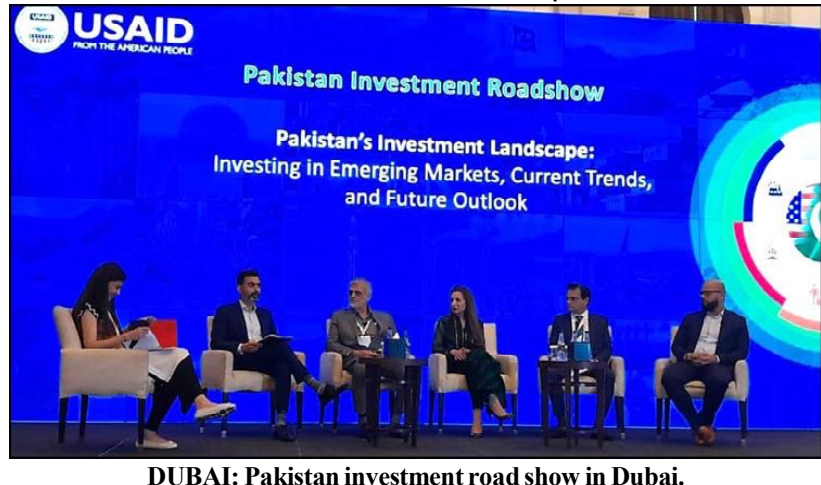
DUBAI: Pakistan investment road show in Dubai.