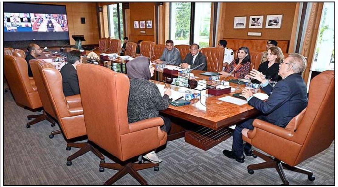
ISLAMABAD: President Dr. Arif Alvi chairing a follow-up meeting on mental health issues in Pakistan, at Aiwan-e-Sadr.

He also underscored the need for increasing the number of mental health professionals, besides taking steps for the capacity building of human resources to provide quality counselling and assistance to people.