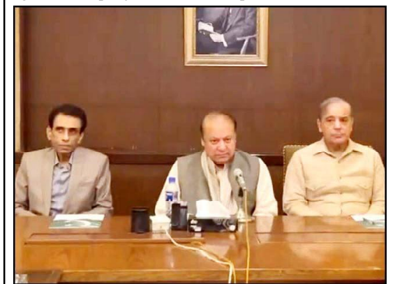
Pakistan Muslim League-Nawaz (PML-N) supreme Nawaz Sharif, party president Shehbaz Sharif and Muttahida Qaumi Movement-Pakistan (MQM-P) convener Khalid Maqbool Siddiqui during a meeting.