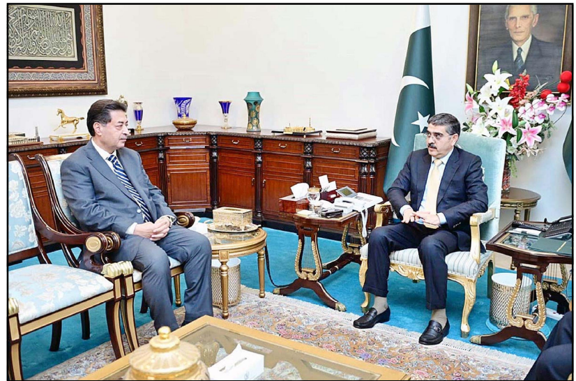
ISLAMABAD: Chief Election Commissioner Sikander Sultan Raja calls on Caretaker Prime Minister Anwaar-ul-Haq Kakar.