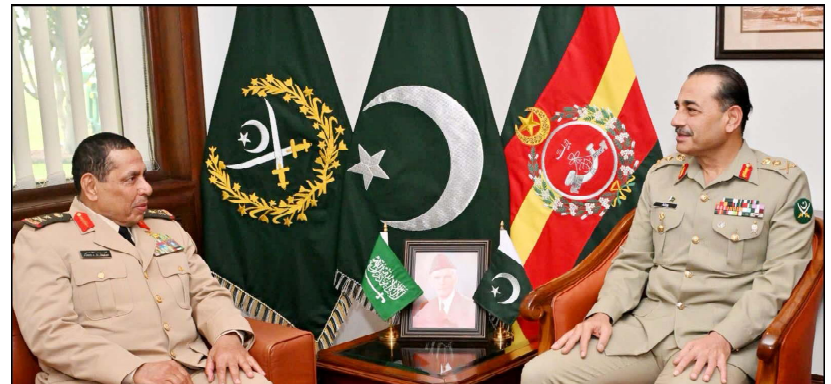
RAWALPINDI: Lieutenant General Fahd bin Abdullah Al-Mutair, Commander of the Royal Saudi Land Forces (RSLF) called on General Syed Asim Munir, NI (M), Chief of Army Staff (COAS) at GHQ.