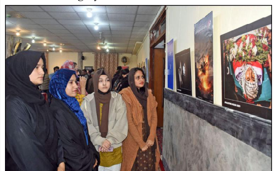
LAHORE: People are taking interest in paintings during exhibition regarding the "Ghaza" at Khana-e-Farhang (Iran) in Provincial Capital.

The chief minister also directed KPK Inspector General of Police for immediate arrest of all the culprits involved in the gory incident.