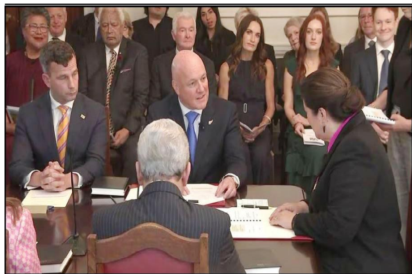
WELLINGTON: Former airline boss Christopher Luxon formally took office as New Zealand's prime minister vowing to tame inflation and bring down interest rates