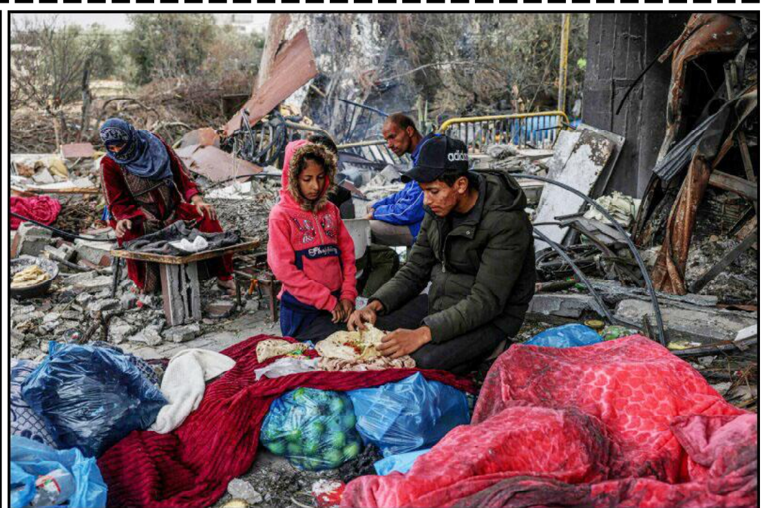
Palestinians eat outside amid the destruction caused by Israeli strikes in the village of Khuzaa, east of Khan Yunis near the border fence between Israel and the southern Gaza Strip

Once the truce ends, Netanyahu said at the weekend, "we will return with full force to achieve our goals: the elimination of Hamas; ensuring that Gaza does not return to what it was; and of course the release of all our hostages."