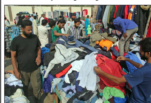
KARACHI: People are buying woolen clothes from vendors after increasing coldness.

While no humanitarian situation is comparable in terms of devastation, these disasters have all affected and continue to affect millions of people, exposing them to disease, hunger, and displacement, with women and children being the most vulnerable.