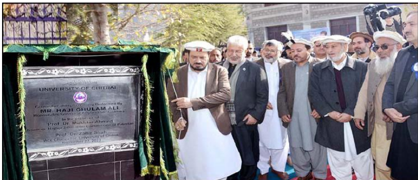
CHITRAL: Governor Khyber Pakhtunkhwa Haji Ghulam Ali performed ground breaking ceremony of the University of Chitral main campus during his visit to district Chitral.

universities with no ranking would also be stopped. Haji Ghulam Ali said the education standard of Govt College Peshawar was very low in Peshawar in the past. The Governor said when he took over as district Nazim Peshawar, he was surprised after seeing in the newspaper that three students of Government College Peshawar had topped the examination in the province and became very pleased. The governor said the students were the future of Pakistan and great responsibility rested on their teachers and parents to focus on their studies so that they could effectively shoulder the future responsibilities.