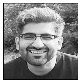
By Umair Javed

Laws alone can only do so much. If women who experience physical or sexual violence at home or elsewhere fear being ostracized by their family, friends or community for speaking out or somehow being blamed for their situation, cases of gender-based violence will never reach the stage where the law can take action. A first step towards getting the most out of the laws that seek to protect women is to then challenge and change the culture that seeks to disempower women by legitimizing or rationalizing gender-based violence. This is not solely a gender-based violence issue but one of social justice as well, with poorer women less likely to be able to afford the costs that come with filing a case and hiring the legal help needed to prosecute it, highlighting the need to provide legal and financial resources to victims of gender-based violence.