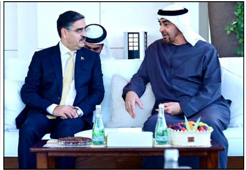
ABU DHABI: Caretaker Prime Minister Anwaar-ul-Haq Kakar meeting with President of the United Arab Emirates Sheikh Mohamed bin Zayed Al Nahyan

He expressed the hope that the MoUs that were signed by the two countries would turn into tangible projects very soon.