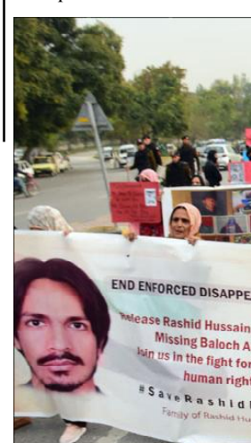
ISLAMABAD: Relatives of missing persons holds protest rally from National Press Club to Super Market, for the recovery of their relatives.

joint exercise in Counter Terrorism domain among the Special Forces of Pakistan, Bahrain, Iraq and Kuwait. The exercise is aimed at nurturing of joint employment and interoperability besides, harnessing the historic military to military relations among the brotherly countries.