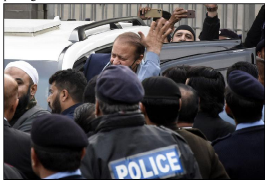
ISLAMABAD: Former Prime Minister and leader of PML-N Mian Muhammad Nawaz Sharif leaving after his hearing at Islamabad High Court in Federal Capital.

Sanitization operation was being carried out to eliminate any other terrorists found in the area.