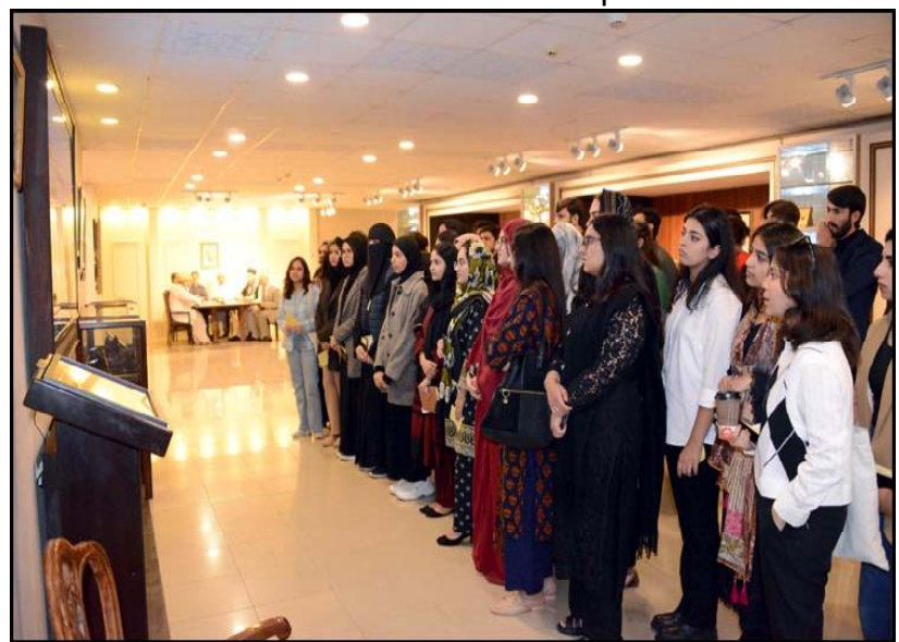
A group of Students and Faculty Members of National University of Science and Technology (NUST), Islamabad visiting Senate Museum at Parliament House, Islamabad.

year, $44.6 million effort. Thanks to the project, today hundreds of thousands of residents of KP have better more reliable access to safe, clean, drinking water, waste management, and improved sanitation. The project's accomplishments include: The rehabilitation of 140 clean drinking water facilities serving 448,000 people. Replacement of 25,700 meters of old and rusted water mains, ensuring clean, reliable vehicles and the establishment of a repair and maintenance workshop for waste management equipment. "We should all be proud of the profound impact the Municipal Services Project has had on the lives of approximately 1.9 million residents in Peshawar's urban areas - improved hygiene conditions, reduced risk of urban flooding, and better environmental protection," Ambassador Blome said.