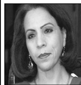
By Dr Farzana Bari

The recently released UNDP 2023 Gender Social Norms Index (GSNI) reveals the shocking persistence of gender biases globally. The index tracks people's attitudes towards women across four dimensions — political, education, economic and physical integrity in both lower and higher HDI countries.