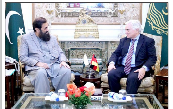
LAHORE: Ambassador of Germany to Pakistan, Alfred Grannas, called on Governor Punjab Muhammad Balighur Rehman at Governor House.

The Governor Punjab said, "We are thankful to Germany for continuous support to Pakistan for GSP plus status." He further emphasized the need of students exchange programme between Pakistan and Germany. He said that the academic exchange program will strengthen people to people contact between the two countries.