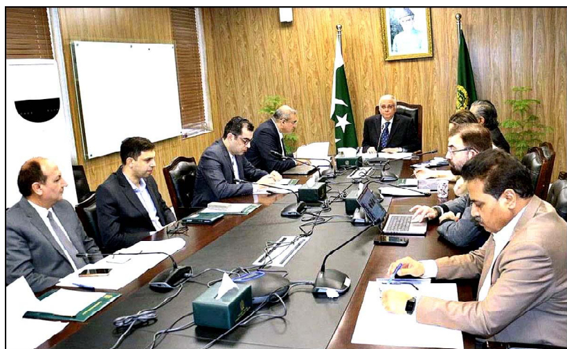
ISLAMABAD: Caretaker Minister for Planning Development & Special Initiatives, Muhammad Sami Saeed chairing Steering Committee meeting to review progress over Integrated Flood Resilience Adaptation Project

ISLAMABAD (APP): Caretaker Federal Minister for Information, Broadcasting and Parliamentary Affairs Murtaza Solangi on Wednesday said that a politically stable and economically strong Pakistan was vital for the protection of the rights of minorities in India, especially Kashmiris who had been struggling for their right to self-determination for over seven decades. Addressing the Kashmir seminar, jointly organised by the Friends of Kashmir and the Kashmir Media Service, he said Pakistan had always extended its moral, political and diplomatic support for the just cause of Kashmiris and would continue to do so till freedom of the occupied territory. He said India was a so-called democracy where minorities were being mistreated and victimised by the majoritarian Hindu hardliners. He said after the unfortunate Jaranwala incident, the Government of Pakistan expressed solidarity with the victims, but the Government of India never supported the victims of the atrocities of Hindutva brigade.