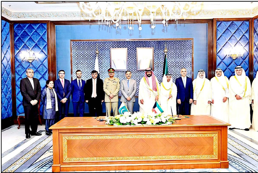
KUWAIT: Caretaker Prime Minister Anwaar-ul-Haq Kakar, First Deputy Prime Minister and Minister for Interior of Kuwait, Sheikh Talal Al-Khaleed Al-Ahmad Al-Sabah, Pakistan's Chief of the Army Staff General Syed Asim Munir and Pakistani delegation in a group photo after the signing of MoUs of cooperation between Pakistan and Kuwait.

Vol. XIII No. 332 Reg. mails-B / ID-445 Thursday November 30, 2023, Jamadi-ul-Awal 15, 1445 A.H. Ph: 2158688, 2158997 Pages 4: Rs. 12