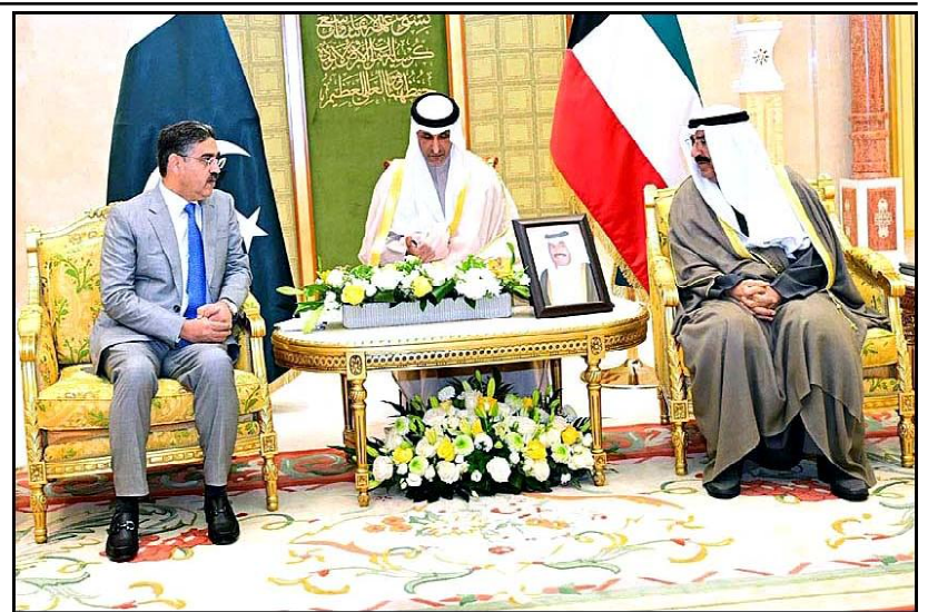
KUWAIT: Caretaker Prime Minister Anwaar-ul-Haq Kakar meets Crown Prince of Kuwait H.H. Sheikh Meshal Al-Ahmad Al-Jaber Al-Sabah.

KARACHI (APP): The State Bank of Pakistan (SBP), Wednesday, informed that the Kingdom of Saudi Arabia extended the term for the deposit of US$ 3 billion placed with Pakistan for another year. "The Saudi Fund for Development (SFD) on behalf of the Kingdom of Saudi Arabia has extended the term for the deposit of US$ 3 billion, maturing on 05 December 2023, for another year," said a statement issued here. The $ 3 billion deposit agreement was initially signed through the SFD with the SBP in the year 2021 and the said amount has been placed with the State Bank of Pakistan on behalf of the Islamic Republic of Pakistan. It is worth noting that the amount was rolled over subsequently in 2022, after the issuance of the royal directives that reflect the continuation of the close relationship between the two brotherly countries. The recent extension of the term of the deposit for one more year is a continuation of the support provided by the Kingdom of Saudi Arabia to the Islamic Republic of Pakistan, which will help to maintain the foreign currency reserves of Pakistan and contribute to the economic growth of the country, it concluded.