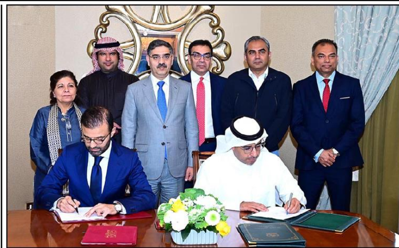
KUWAIT: Caretaker Prime Minister Anwaar-ul-Haq Kakar witnessing the signing of MoUs between private sectors of Pakistan and Kuwait.

However, according to the Forex Association of Pakistan (FAP), the buying and selling rates of the Dollar in the open market stood at Rs 285.4 and Rs 288 respectively. The price of the Euro increased by Rs 1.10 to close at Rs 313.49 against the last day's closing of Rs 312.39, according to the State Bank of Pakistan (SBP).