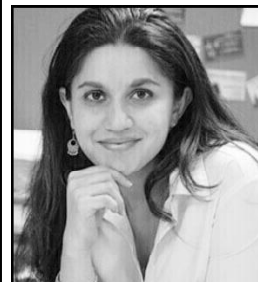
By Rafia Zakaria

Every year, thousands of tourists visit the ruins of the Italian city of Pompeii. This city, which sits at the foot of Mount Vesuvius, was destroyed by a volcanic eruption in 79 AD. The vegetation that covered the mountain had hidden some of the signs of the oncoming eruption but eventually the rivers of molten lava began to flow into the city.