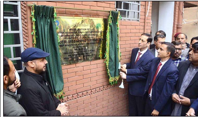
PESHAWAR: Caretaker Chief Minister Khyber Pakhtunkhwa Justice (R) Syed Arshad Hussain Shah and President of Press Club Arshad Aziz Malik inaugurating the solar system and renovation work of Press Club.

he said that a strict campaign against encroachment, price hike, profiteering, adulteration, crimes, traffic problems and drugs were launched in KP under the campaign. Seeking the cooperation of journalists in the fight against narcotics, the chief minister said that training through agriculture and livestock departments would be provided to people and farmers enabling them to get maximum production from crops. The Khushal campaign's positive effects would soon become visible. Tourism in KP would be promoted through awareness, linkages with tourist operators and hotel unions besides exploration of new destinations for tourism.