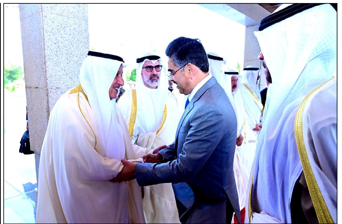
KUWAIT: Caretaker Prime Minister Anwaar-ul-Haq Kakar meeting with Kuwaiti Cabinet Ministers during the welcoming ceremony at Bayan Palace

Echoing deep concerns over the scale of needs in Gaza, the UN World Health Organization (WHO) noted that an assessment carried out in the north at the start of the pause in fighting on 24 November had shown that "everybody everywhere has dire health needs".