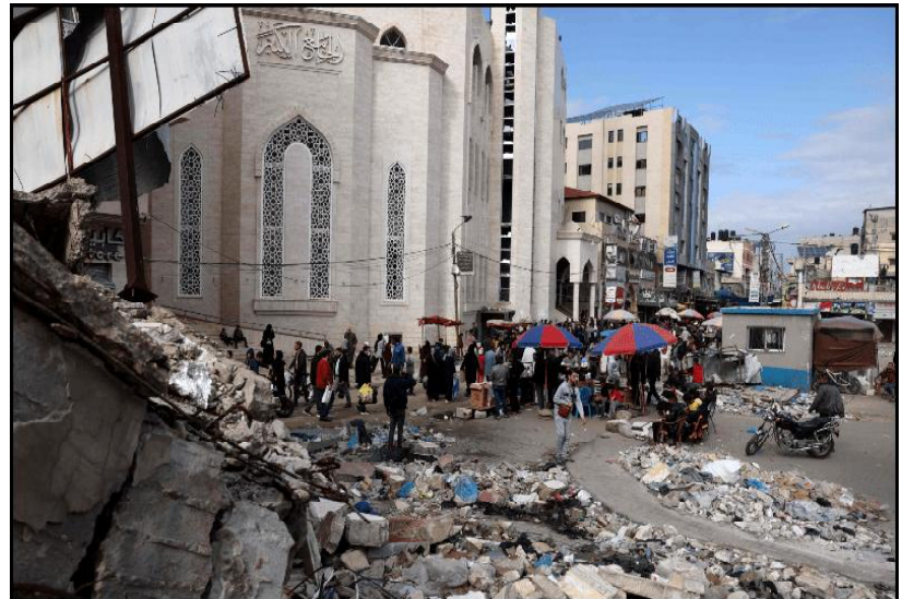
People walk past destroyed buildings, opposite the Grand Mosque of the southern Gaza Strip city of Khan Yunis