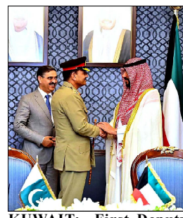
KUWAIT: First Deputy Prime Minister and Minister of Interior of Kuwait Sheikh Talal Al-Khaleed Al-Ahmad Al-Sabah shaking hands with Chief of the Army Staff of Pakistan General Syed Asim Munir.