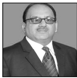
By Syed Ali Nawaz Gilani

Pakistan's ability to maximize the benefits of the China-Pakistan Economic Corridor (CPEC) hinges on the formulation of a practical and inclusive industrial policy. The success of CPEC in fostering Pakistan's industrial development necessitates a strategic approach that actively involves stakeholders, particularly those from medium and small industries. Without a comprehensive policy framework addressing the needs of a diverse industrial landscape, the nation may fall short of fully capitalizing on CPEC's transformative potential.