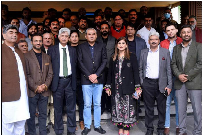
LAHORE: A group photo of Caretaker Federal Minister for Information and Broadcasting, Murtaza Solangi along with Caretaker CM Punjab Mohsin Raza Naqvi and other members during 59th Anniversary of PTV Lahore Center.

LAHORE (APP): Punjab Caretaker Chief Minister Mohsin Naqvi inaugurated Lahore's Cavalry Ground Underpass on Sunday, which has been completed in a record time of two-and-a-half months, instead of six months. Addressing the inaugural ceremony, he congratulated the people of Lahore on completion of the underpass. He felicitates people of Lahore, especially the residents of Gulberg and Defence on the completion of the Cavalry underpass. He said that people should confine themselves within their houses on holidays for reduction in smog. They should not come out of their houses unnecessarily. "If we take care of our environment, then positive changes will come into effect," he added. The level of smog has reduced due to lessening of traffic during previous three days, he added. "We had to close the main road due to construction work and that's why Cavalry underpass was a difficult project," he said and added that with the opening of Ghora Chowk flyover on Dec 7, the route would become signal-free from the Centre Point up to Defence Mor. About two lakh vehicles would pass through the road daily after opening of Cavalry underpass. People had to stop at three signals earlier, he added. "We are focusing more on the three important projects namely Lahore, Rawalpindi Ring Roads and the Bund Road project and striving for an early completion of these projects," he added. DG LDA, his team and the contractor completed the Cavalry underpass by working day and night, he said.