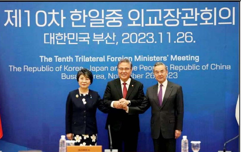
Chinese Foreign Minister Wang Yi, South Korean Foreign Minister Park Jin and Japanese Foreign Minister Yoko Kamikawa pose for a photo prior to the 10th trilateral foreign ministers' meeting in Busan, South Korea