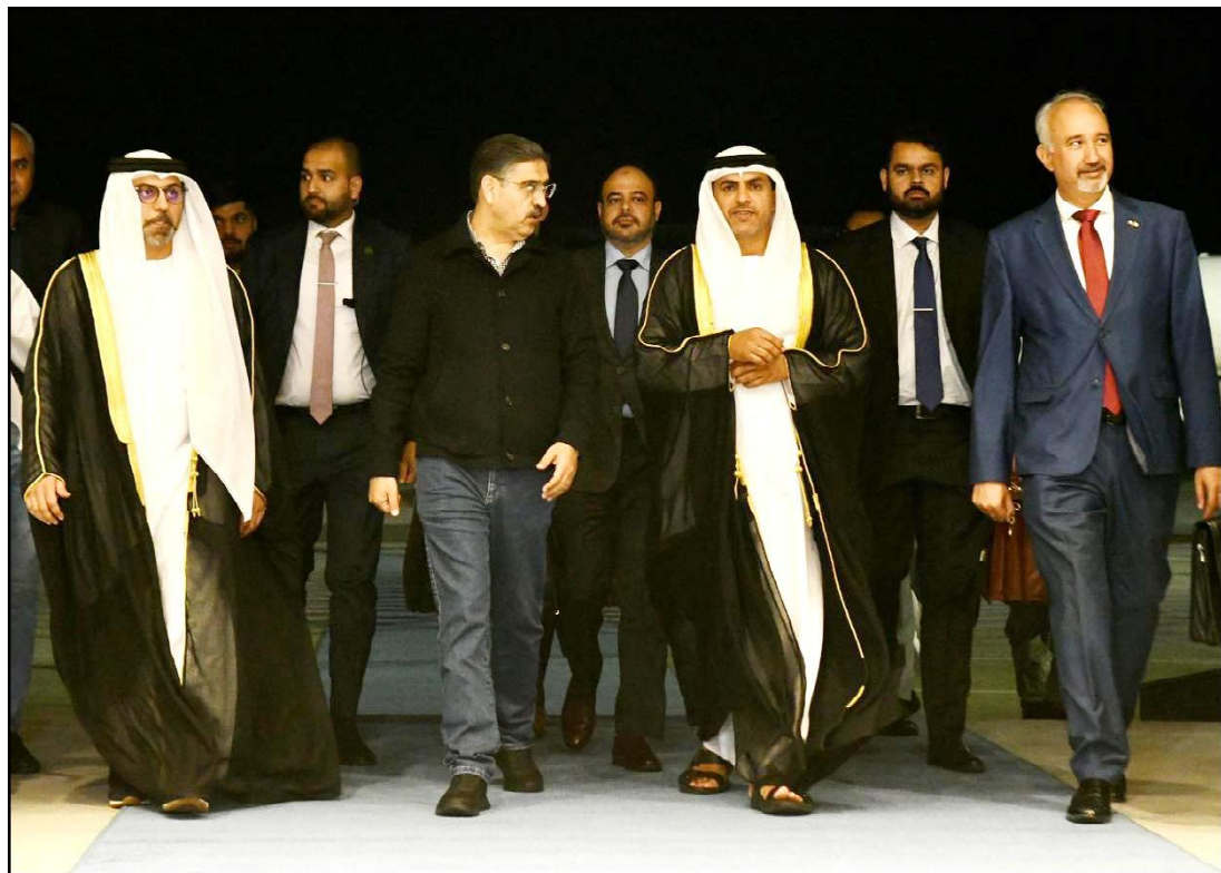
Caretaker Prime Minister Anwar ul Haq Kakar has arrived in Abu Dhabi on a two-day visit to the United Arab Emirates.

Vol. XIII No. 329 Reg. mails-B/ID-445 Monday November 27, 2023, Jamadi-ul-Awal 12, 1445 A.H. Ph: 2158688, 2158997 Pages 4: Rs. 12