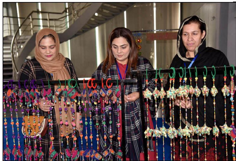
LAHORE: People enjoying the second day of exhibition at the Pak China Industry Exhibition at the Expo Center.

The conclusion of the competition marked a significant moment as awards were distributed to commend outstanding achievements, said a news release issued here on Sunday.