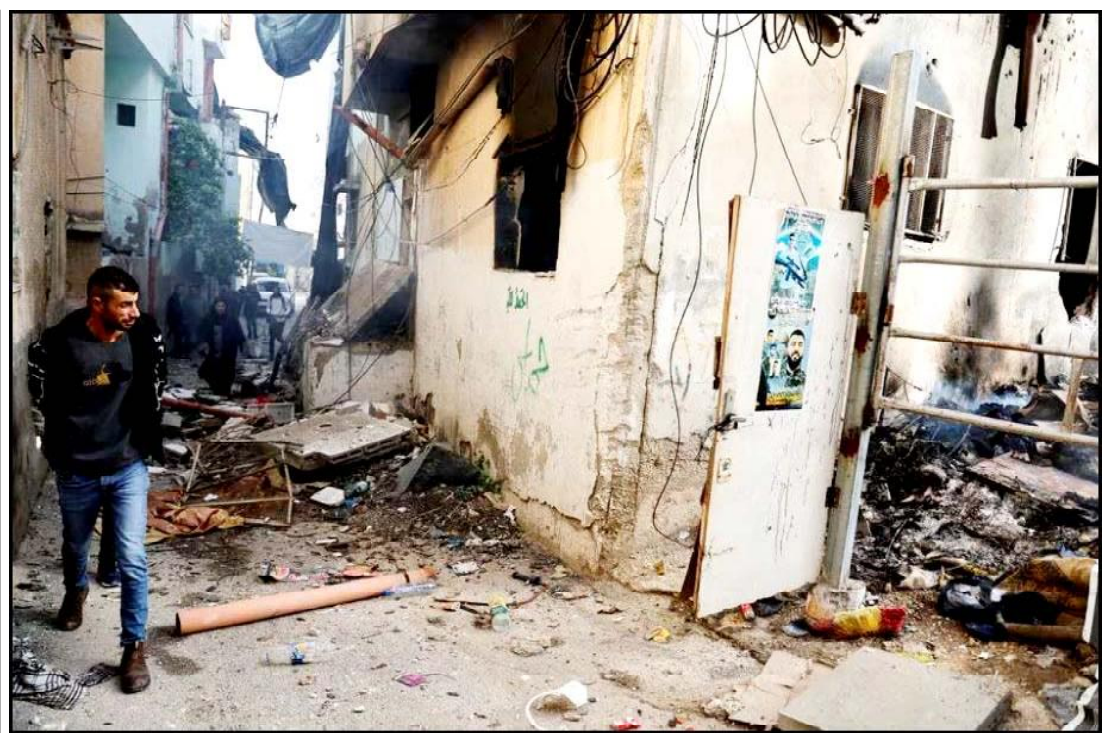
A Palestinian checks the damage in a street in the aftermath of an Israeli raid in Jenin, in the Israeli-occupied West Bank.

LAHORE: A group photo of Caretaker Federal Minister for Information and Broadcasting, Murtaza Solangi along with Caretaker CM Punjab Mohsin Raza Naqvi and other members during 59th Anniversary of PTV Lahore Center.