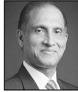
By Aizaz Ahmad Chaudhry

For nearly two years, the subject of geoeconomics has been discussed in Pakistan's academic and official echelons. In an article published in this paper in December 2021, this writer had discussed the prospects of geoeconomics benefiting Pakistan by leveraging our economic geography to address geostrategic challenges — it being understood that geoeconomics is not a replacement for geopolitics and that both must work in tandem.