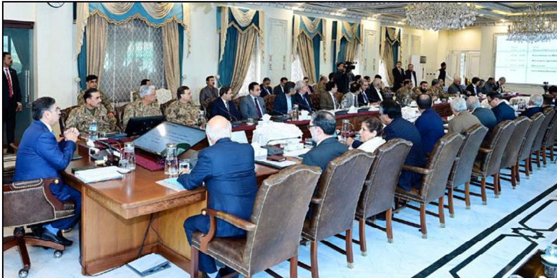
ISLAMABAD: Caretaker Prime Minister Anwaar-ul-Haq Kakar chairing a special session of the Apex Committee of SIFC held to foster strategic partnerships with friendly countries.

Vol. XIII No. 328 Reg. mails-B / ID-445 Saturday November 25, 2023, Jamadi-ul-Awal 10, 1445 A.H. Ph: 2158688, 2158997 Pages 4: Rs. 12