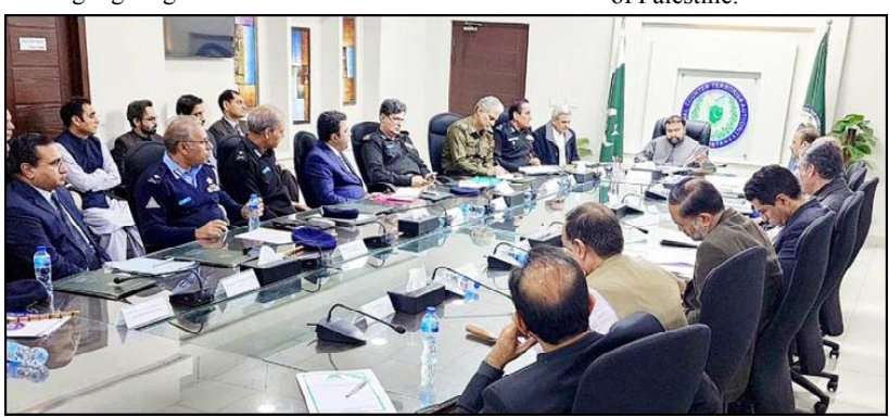
ISLAMABAD: Caretaker Federal Minister for Interior Sarfraz Ahmed Bugti chairing National Action Plan Coordination Committee Meeting.

The court rejected the police's request for the physical remand of former National Assembly speaker Asad Qaiser and sent the PTI leader to jail.