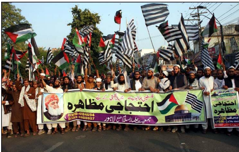
LAHORE: Activists of Jamiat Ulema-e-Islam (JUI-F) are holding protest demonstration against Israeli cruel and inhumane acts and express unity with the innocent people of Palestine, at Lahore press club