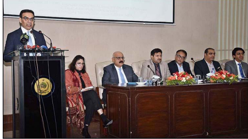
ISLAMABAD: Caretaker Minister for Energy, Power and Petroleum Muhammad Ali addressing during seminar on "Renewable Energy, The Way Forward" at Information Service Academy.