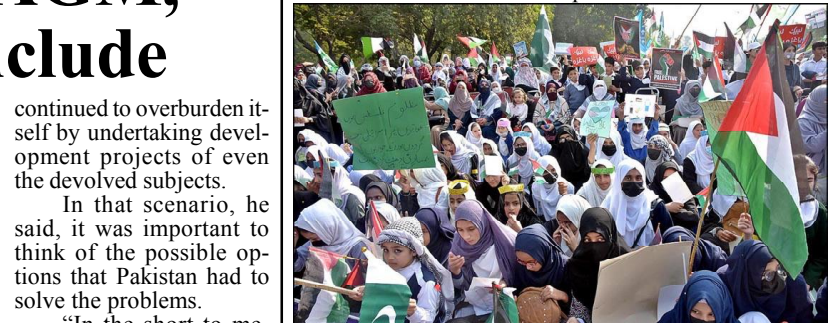
ISLAMABAD: Students carrying Palestinian flags, banners and placards as they hold pro-Palestinian demonstration to show solidarity with Palestinians outside Faisal Mosque.