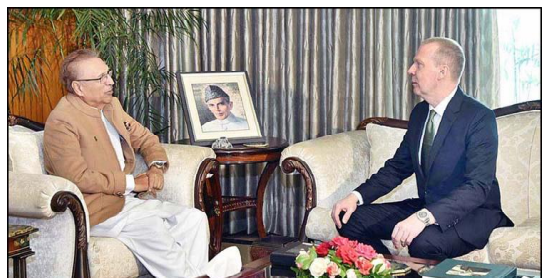
ISLAMABAD: The outgoing Ambassador of the Russian Federation, Daniia Ganich called on President Dr. Arif Alvi at Aiwan-e-Sadr.

economy but transform it", he added. He said he had devised a comprehensive plan for promoting regional languages as it would help to promote the rich culture of the provinces, adding, that artists need to promote a soft image of Pakistan worldwide through their talents. The main purpose of the new cultural policy is to work for the revival of cultural organizations and the promotion of art and culture as no nation can develop by putting its culture behind it. Replying to a question, the minister said that Pakistan is blessed with a huge number of ancient and historic places, adding, that these places keep us linked to our past and conserve our culture and customs for centuries. Pakistan is a treasury of ancient culture and customs through centuries, he added. Pakistan needs massive financial resources, administrative capacity and effective governance to protect and promote its cultural heritage which is also going to help in economic growth, he added. The minister further expressed his concern over the decline of drama production at Pakistan Television (PTV), stressing the need to revive the local drama industry with quality content.