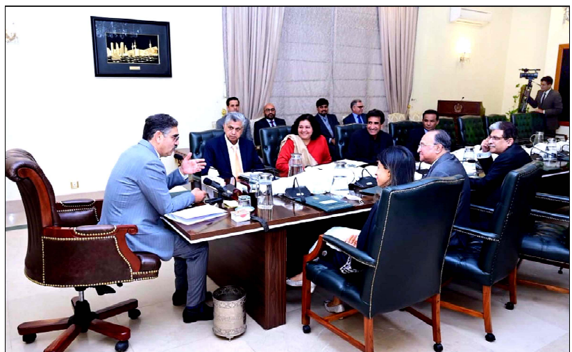
ISLAMABAD: A delegation of All Pakistan Newspapers Society calls on the Caretaker Prime Minister Anwaar-ul-Haq Kakar

The President lauded the leadership of KSA for the recent Saudi-Iran normalization of relations and termed it a major breakthrough that would bring peace and security in the region, besides promoting trade and development. He also appreciated the Saudi initiatives for peace and stability in Yemen, Syria, and Sudan. The President deeply thanked KSA for its economic support to Pakistan in difficult times as well as for extending humanitarian aid and supporting development projects, especially in the education and healthcare sectors in Paki-