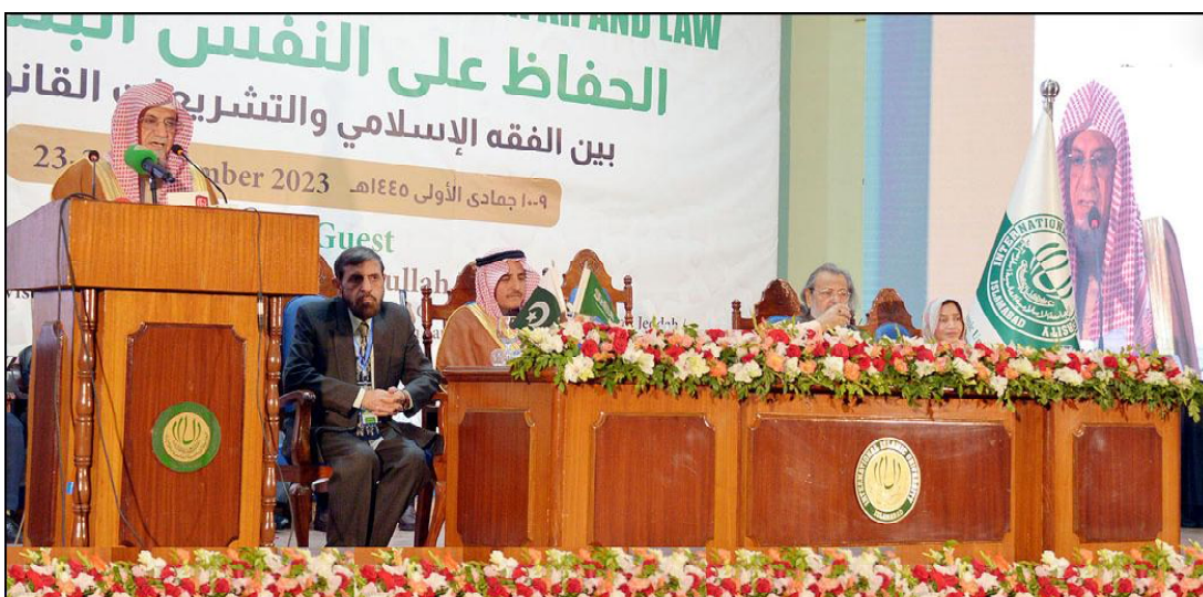
ISLAMABAD: Imam-e-Kaaba, Professor Dr. Saleh bin Abdullah bin Humaid addressing a ceremony held at the Faisal Masjid Campus of International Islamic University, Islamabad (IIUI).