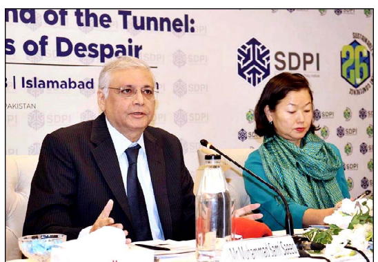
Special Investment Facilitation Council (SIFC). He made these remarks while addressing the 26th Sustainable Development Conference (SDC) organized by the Sustainable Development Policy Institute (SDPI) here, a news release said.

The court observed that the trial would be proceeded from the position of August 29, and instructed the officials of Adiala Jail to produce the two accused before it on November 28.