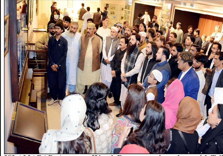
ISLAMABAD: A group of Youth Representatives along with Tribal elders from Balochistan visiting Senate Museum at Parliament house.

ISLAMABAD (APP): Thousands of children took out a rally here on Thursday against Israel's bombing of Gaza, assuring their moral support to the innocent people. The rally, which began from Centaurs Chowk and culminated near Faisal Mosque was arranged by Jamaat-e-Islami (JI). The participants were carrying banners and placards, inscribed with slogans such as "Free Palestine", "Down with Israel", and "Stop genocide in Palestine". Addressing the participants Ameer JI, Siraj-ul-Haq demanded an immediate end to Israeli bombing in Gaza Strip. "Gaza has become a graveyard. This gathering is a message for the oppressors that they must stop genocide," he added. He said Israel was targeting civilians and infrastructure in densely populated civilian areas, which constituted war crimes. The ameer said there was no respite for the people of Palestine, who had been enduring worst violence of modern age for the past several days. He demanded that murderers and oppressors should be punished for their crimes against humanity. He asked people to boycott all products of Israel. He also called on international community to play its role for stopping bombing on Palestine. He said that so far the world had abjectly failed to protect Gaza's hapless citizens from Israel's attacks.