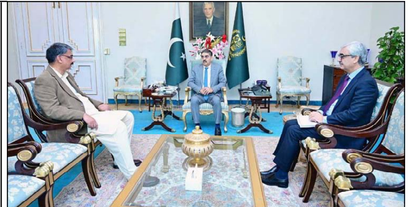
ISLAMABAD: Prime Minister of AJK Chaudhry Anwaar-ul-Haq and Chief Secretary of AJK Dawood Muhammad Bareach called on caretaker Prime Minister Anwaar-ul-Haq Kakar.

ISLAMABAD (APP): Caretaker Prime Minister Anwaar-ul-Haq Kakar on Thursday said Pakistan would continue to extend political, moral, and diplomatic support to its Kashmiri brethren till the resolution of the Jammu and Kashmir dispute. He stated this as Prime Minister of Azad Jammu and Kashmir Chaudhry Anwar ul Haq called on him here at the PM House. The prime minister vowed support for Kashmiris till the implementation of the resolutions of the United Nations Security Council. The AJK prime minister extended an invitation to PM Kakar to visit Azad Jammu and Kashmir and thanked him for addressing the issues pertaining to energy, water resources, and infrastructure. Chief Secretary AJK Dawood Muhammad Bareach was also present.