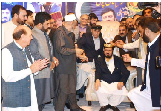
PESHAWAR: Khyber Pakhtunkhwa Governor Haji Gulam Ali being crowned on his best services for Peshawar City and business community for the province.

makes the body healthy, and prevents diseases like diabetes and blood pressure. Governor Punjab said that diabetes affects every organ of the body, especially vision, heart, liver and kidneys. Governor Punjab said that Islam is a complete code of life. He said that we should adopt a healthy lifestyle. Governor Punjab said that as chancellor, he would also direct the vice-chancellors of all universities across the province in writing to organize awareness seminars and workshops to create awareness among the students and prevent this disease.