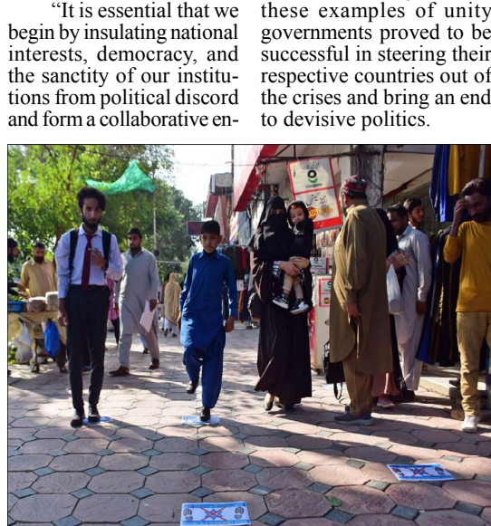
ISLAMABAD: People are walking on the Israeli flag set by traders on floor outside their shop at Aabpara Market, to show solidarity with oppressed Muslims of Palestine in Federal Capital.