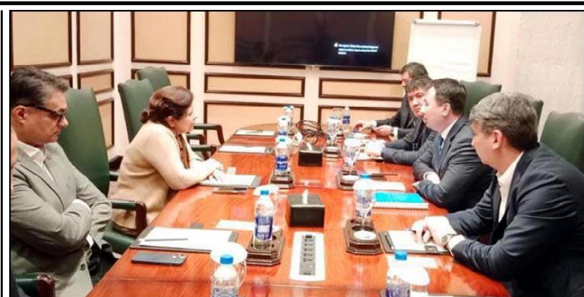
ISLAMABAD: Caretaker Federal Minister for Finance, Revenue, and Economic Affairs, Dr. Shamshad Akhtar, convened a pivotal meeting today with the esteemed Deputy Prime Minister of Uzbekistan, H.E. Dr. Jamshid Khodjaev Abdulkhakovovich.