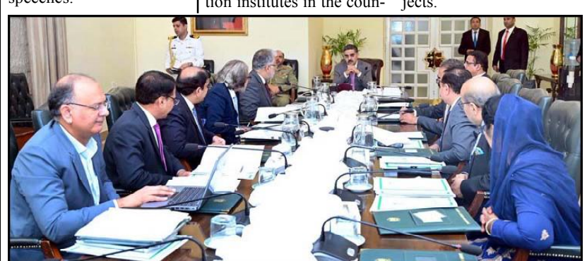
ISLAMABAD: Caretaker Prime Minister Anwaar-ul-Haq Kakar chairing a meeting regarding the Higher Education Commission of Pakistan.

He observed that for promotion of human and technical resources, they would have to extend facility of stipends in the science and engineering subjects.