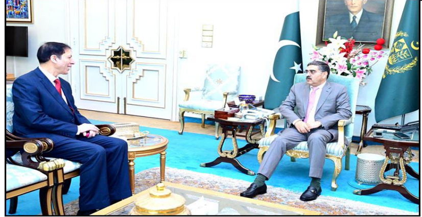
ISLAMABAD: Caretaker Chief Minister Khyber Pakhtunkhwa Justice (R) Arshad Hussain called on caretaker Prime Minister Anwaar-ul-Haq Kakar.