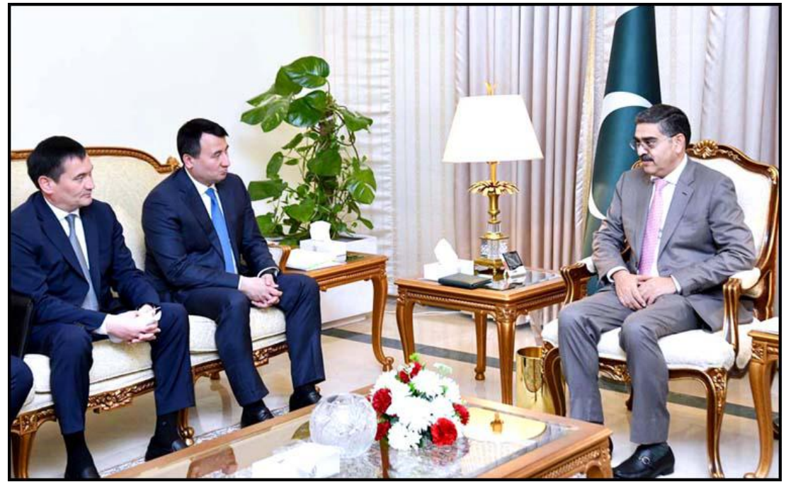
ISLAMABAD: Deputy Prime Minister of Uzbekistan, H.E. Dr. Jamshid Khodjaev Abdulkhakomovich calls on the Caretaker Prime Minister Anwaar-ul-Haq Kakar.

He expressed the hope that both sides would continue active engagement for the timely completion of the Uzbekistan-Afghanistan-Pakistan Railway Project.