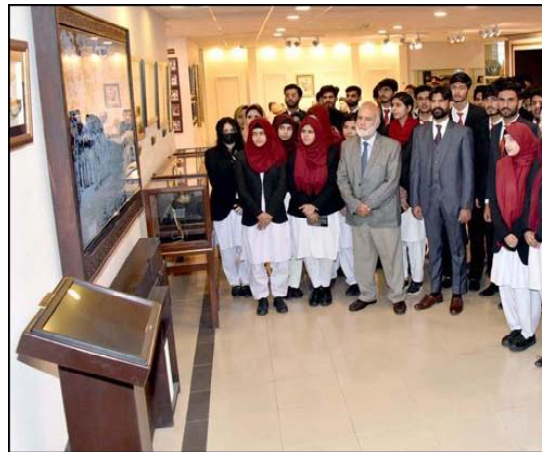
ISLAMABAD: A group of students and faculty members of National Law College, Rawalpindi visiting Senate Museum at Parliament House.