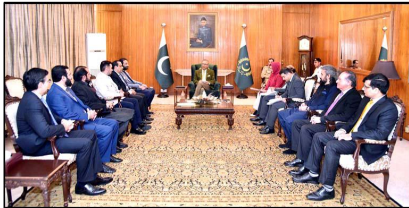
ISLAMABAD: A delegation of honorary consuls of different friendly countries based in Peshawar call on President Dr Arif Alvi, at Aiwan-e-Sadr.