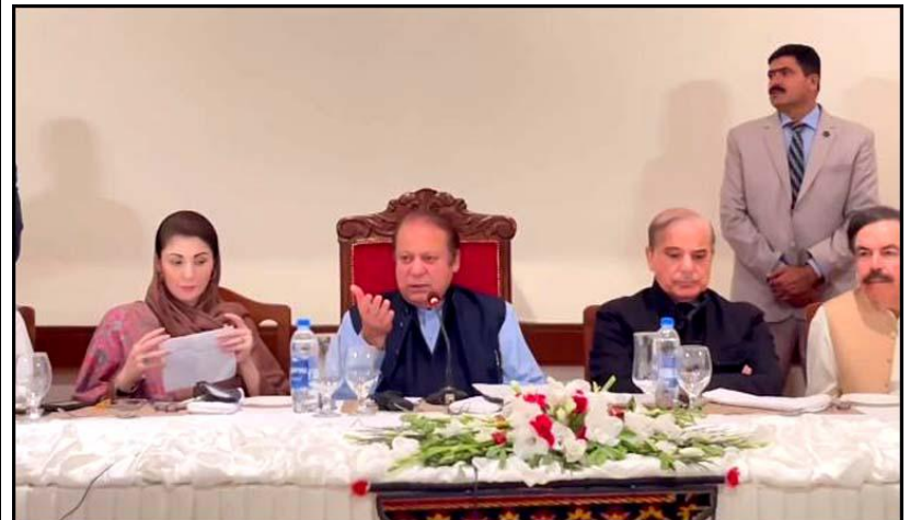
PML N supremo Nawaz Sharif addressing party workers in Quetta. Former PM Shehbaz Sharif and Maryam Nawaz are also present on the occasion.

The court remarked Attorney General Sahib present in court the record whatever is tomorrow.