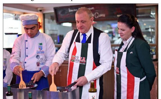
ISLAMABAD: Ambassador of the Italy to Pakistan Andreas Ferrarese along with his spouse are busy in cooking the Italian Cuisine during the "Week of the Italian Cuisine in the World" at local hotel in Federal Capital.

ISLAMABAD (APP): The Capital Development Authority (CDA) has completed almost 90 percent work of installation of new led lights, repair and maintenance of old street lights along the streets, service roads and main avenues of the federal capital. "The authority has already allocated funds in this regard last month which will not only help to ensure proper lighting arrangement on these roads and streets but also control the criminal activities in the capital," a CDA official told APP. The official said the shortage of street lights in different sectors of the federal capital caused a recent increase in street crimes, prompting residents to raise the issue with the relevant authorities. He said the CDA was also taking concrete steps to ensure the provision of urban facilities to the city dwellers and maintenance of infrastructure, including the installation of street lights, road carpeting and resolving water-related issues, neglected in the past. "Special attention is being given to the completion of the remaining development works in the sectors I, G, H and D series, provision of civic facilities, and facilitating the home builders in these sectors in pursuance of the directives of Chairman CDA Capt @ Anwar ul Haq," he said. Now, he said the work of installation of streetlights in the main roads and within the sectors would ensure proper lighting management in sectors, G-7, G-8, G-9, G-10-11, I-10, I-14. Work in sectors I-16, D-12 and others is also in full swing, he added.