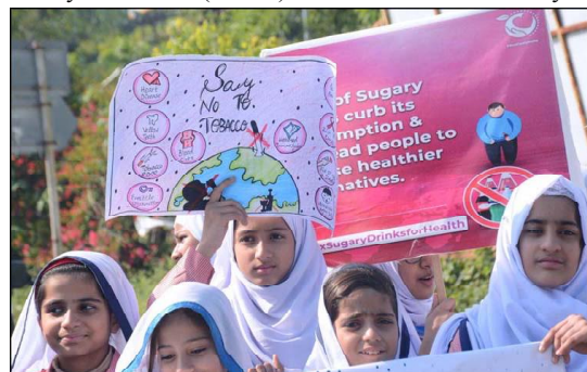
ISLAMABAD: Students holding placards during an awareness walk regarding Diabetes on the eve to mark World Diabetes Day organized by Pakistan National Heart Association at National Press Club Islamabad.