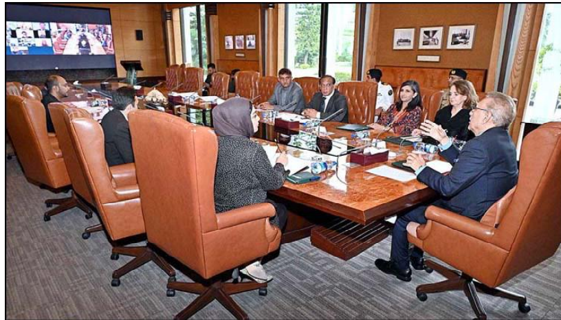
ISLAMABAD: President Dr. Arif Alvi chairing a follow-up meeting on mental health issues in Pakistan, at Aiwan-e-Sadr.