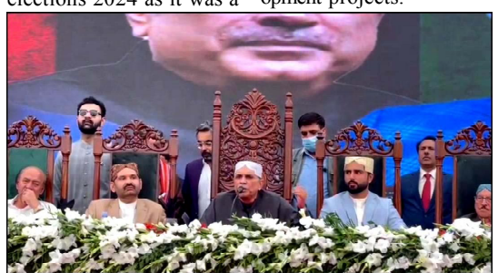
GHOTKI: Former president and chairman Pakistan People's Party Parliamentarians (PPP), Asif Ali Zardari addressing a ceremony in Ghotki

He said that every bill took sufficient time in the process of preparation and the past government did the necessary work on it. The law ministry and respective legal branch had advised him to present the said bill in the House, the minister said. Deferring the bill, Chairman Senate Muhammad Sadiq Sanjrani said that he would give his opinion in this regard besides taking the Attorney General's point of view.