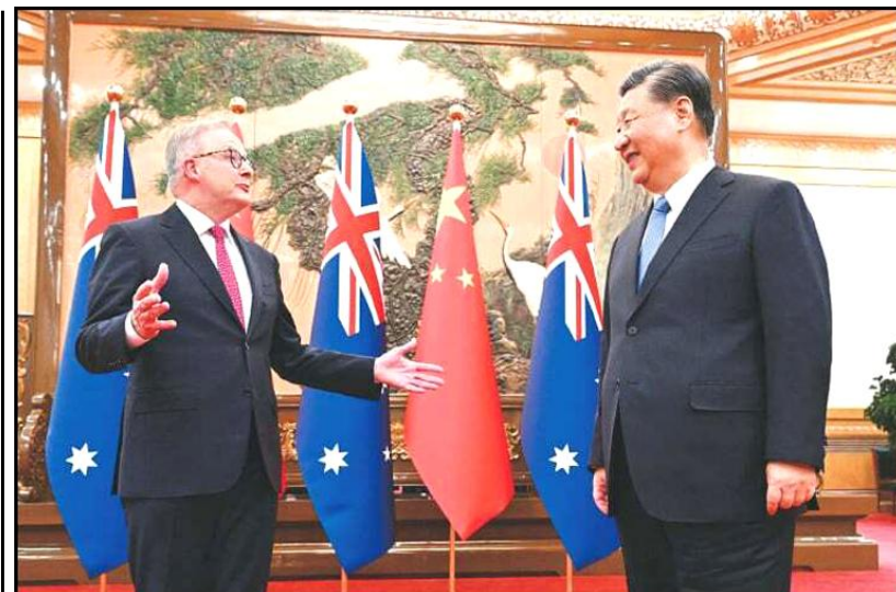
Australian Prime Minister Anthony Albanese meets Chinese President Xi Jinping at the Great Hall of the People, in Beijing.