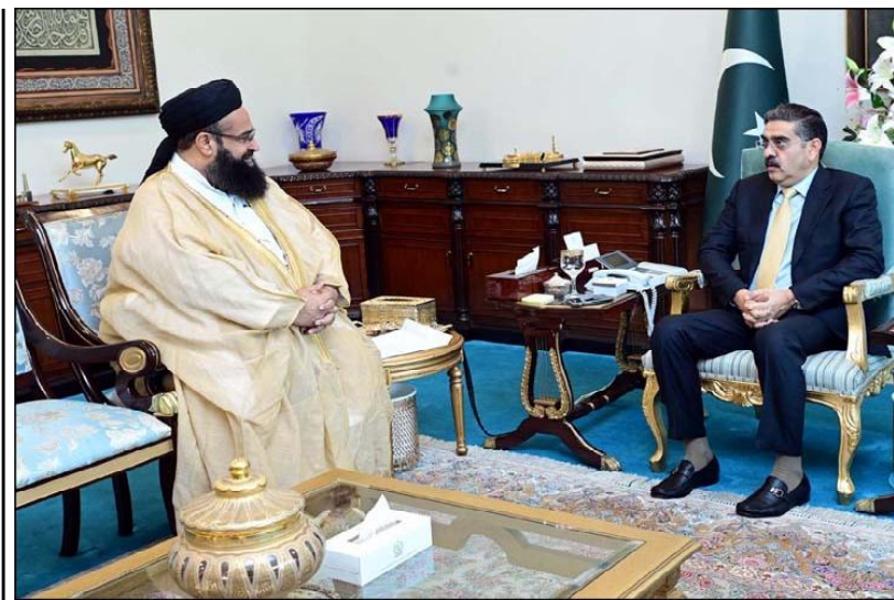
ISLAMABAD: Caretaker Prime Minister, Anwaar-ul-Haq Kakar exchanging views with Maulana Tahir Ashrafi, Special Representative of the Prime Minister for Religious Harmony and Pakistan Diaspora in Middle East and Islamic Countries during meeting held in Islamabad.