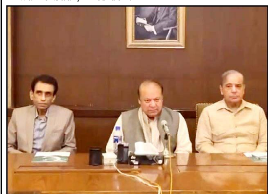
Pakistan Muslim League-Nawaz (PML-N) supremo Nawaz Sharif, party president Shehbaz Sharif and Muttahida Qaumi Movement-Pakistan (MQM-P) convener Khalid Maqbool Siddiqui during a meeting.