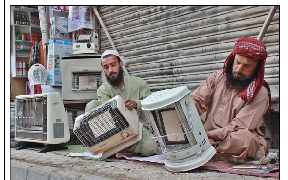
QUETTA: Man repairs gas heater at main Quetta bazaar.

He said that the law has been introduced in Punjab under which 150 mediation centers have been established while 12,000 advocates have been nominated as mediators.