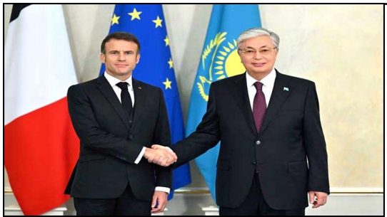
ASTANA: French President Emmanuel Macron meeting with Kazakh President Kassym-Jomart Tokayev, in Kazakhstan.

Monitoring Desk WASHINGTON: President Joe Biden's administration is preparing to announce that it will develop a national strategy to combat Islamophobia, according to people briefed on the matter, as it faces skepticism from many in the Muslim American community for its staunch support of Israel's military assault on Hamas in Gaza. The White House announcement had originally been expected to come last week when Biden held a meeting with Muslim leaders, but was delayed, three people said. Two of them said the delay was due in part to concerns from the Muslim American community that the administration lacked credibility on the issue given its robust support for Israel's military, whose strikes against Hamas militants have also killed thousands of civilians in Gaza. The people spoke on the condition of anonymity because they were not authorized to publicly discuss the White House