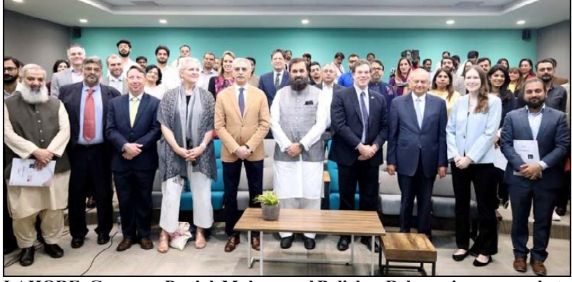
LAHORE: Governor Punjab Muhammad Balighur Rehman in a group photo with participants of an inaugural ceremony of "Tabeer" project at LUMS University National Incubation Center.