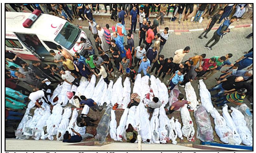
Palestinian fighters offered stiff resistance to invading forces, but the relentless Israeli bombing of the besieged enclave claimed at least 50 lives in the Jabalia refugee camp.