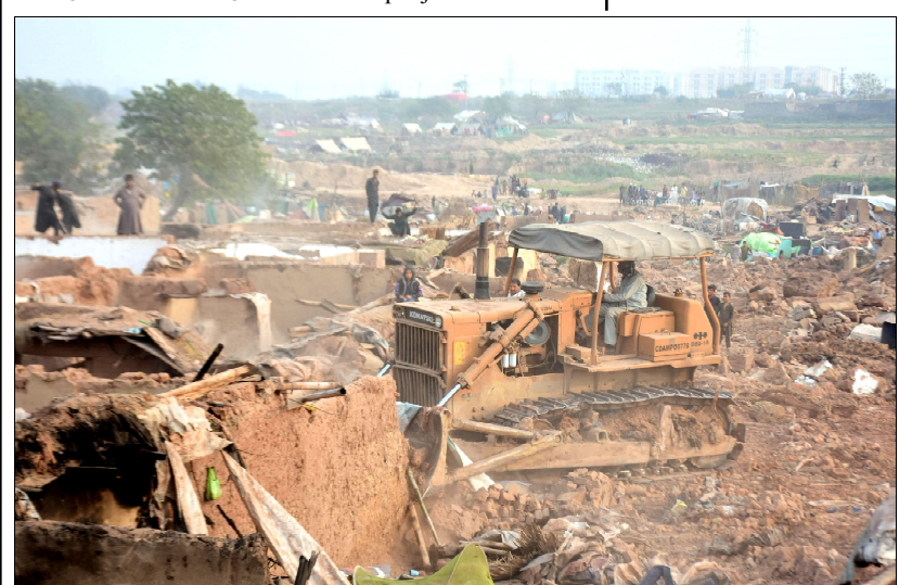
ISLAMABAD: Workers are demolishing the illegally contracted houses at Afghan Basti I-12 as govt announce warning for people living in Pakistan illegally to leave the country as security forces on Wednesday rounded up, detained and deported dozens of Afghans who were living in the country illegally, after a government-set deadline for them to leave

PESHAWAR (APP): At least 25 people were killed during skirmishes between warring tribes over land dispute in Kurram tribal districts so far. According to an official statement here issued by a spokesman of Home Department KP, the rival tribes now agreed to vacate the bunkers and trenches in affected areas of Kurram district where the situation started towards improvement due to efforts of Khyber Government and law enforcement agencies. Several peace jirgas were held during last week attended by the area elders and representatives of the Government and law enforcement agencies that brought significant improvement in the area. The government was trying to open all roads in one of two days so that delivery of medicines, food and other necessary commodities could be ensured.