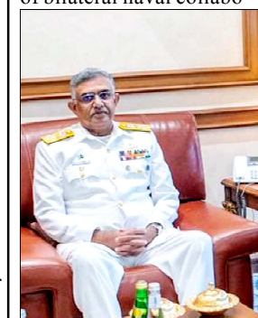
RIYADH: Chief of the Naval Staff, Admiral Naveed Ashraf exchanges views with Chief of the General Staff of Saudi Armed Forces, General Fayyadh Bin Hamed Al-Ruwaili during meeting held at Royal Saudi Naval Forces (RSNF) Headquarters in Riyadh