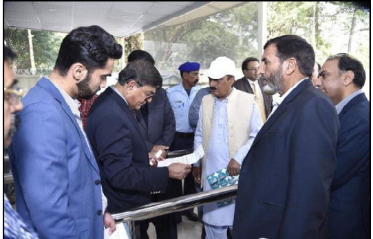
Wafaqi Mohtasib Inspection Team is attending to the complaint of a customer during their inspection visit to CDA.