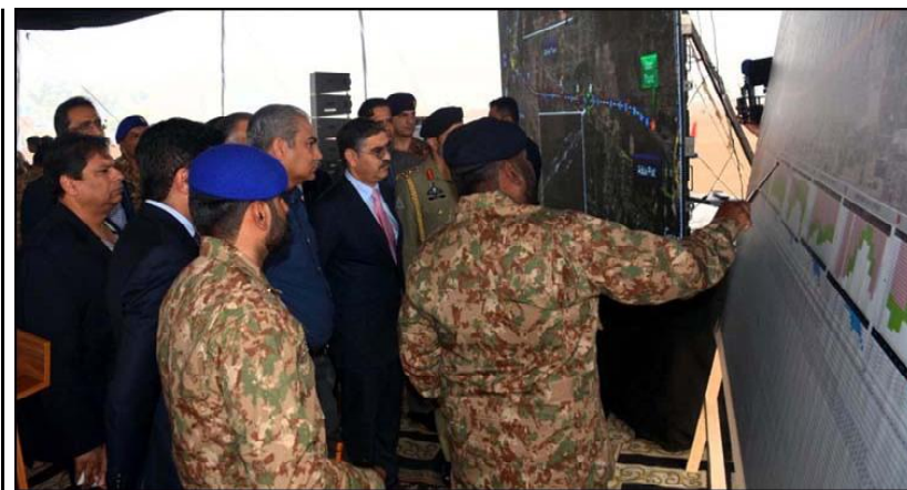
LAHORE: Caretaker Prime Minister, Anwar-ul-Haq Kakar receives briefing regarding the construction of the southern portion (SL-3) of Lahore Ring Road, in Lahore.

He appreciated the Punjab Government's program for reconstruction and rehabilitation of hospitals under Caretaker Chief Minister Mohsin Naqvi.