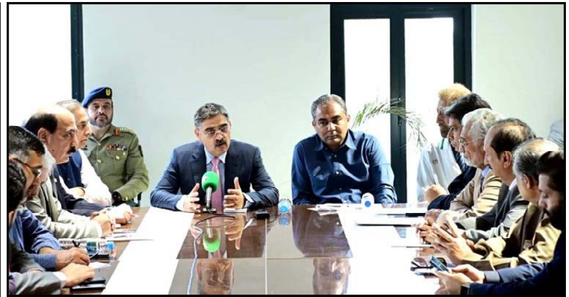
LAHORE: Caretaker Prime Minister, Anwaar-ul-Haq Kakar addresses to media persons during press conference, at Mayo Hospital in Lahore.

Moreover, it was also the domain of the ECP to allocate election symbols, he added.