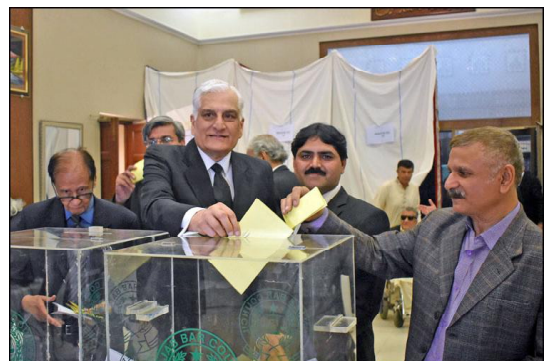
LAHORE: Former Federal Minister Zahid Hamid is casting the vote during the annual election of Supreme Court Bar Election, in Provincial Capital.

CM Mohsin Naqvi said that temporary camps and holding areas have been established in different districts for the illegal immigrants.