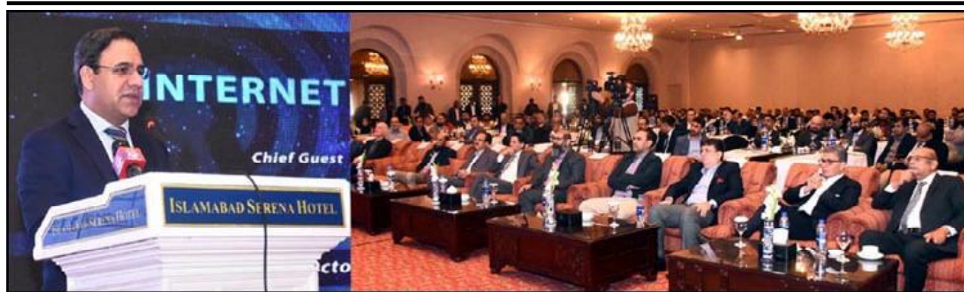
Caretaker Federal Minister for IT and Telecommunication Dr. Umar Saif addressing event titled "Internet Governance in Pakistan" in Islamabad.