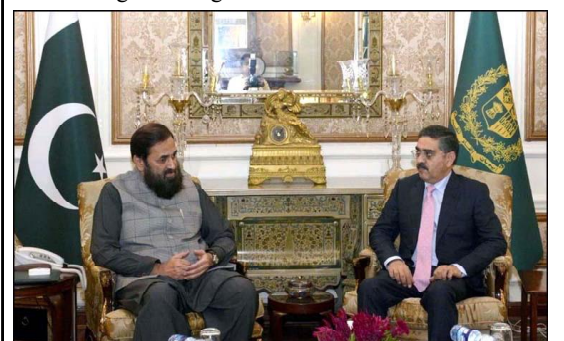
LAHORE: Caretaker Prime Minister, Anwar-ul-Haq Kakar exchanging views with Muhammad Ballegh-Ur-Rahman, Governor Punjab during meeting held in Lahore.

Punjab cabinet ministers, Prime Minister Anwar-ul-Haq Kakar praised Chief Minister Mohsin Naqvi's swift actions in promptly passing on the benefits of reduced petroleum prices to the people of the province. He personally took to the field, providing relief to the citizens - a gesture that set a significant example.