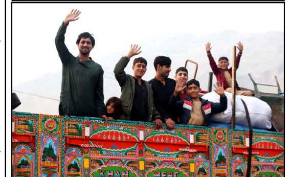
LANDIKOTAL: A large number of unregistered Afghan refugees families are willingly enroute their homeland with their homes necessities after the government of Pakistan decided in the apex committee meeting to return all those Afghans who are living in Pakistan unlawfully, at Machini area in Landikotal.

It may be mentioned here that six labourers were also killed by unknown armed men in Turbat last month.