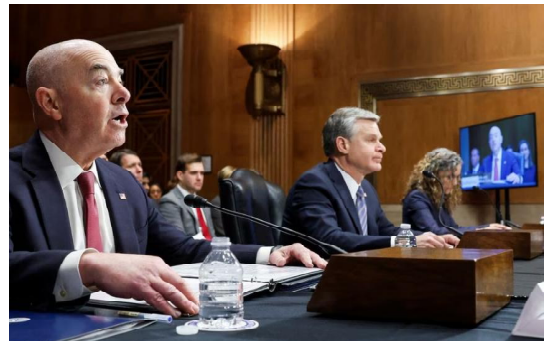
U.S. Homeland Security Secretary Alejandro Mayorkas testifies next to FBI Director Christopher Wray and National Counterterrorism Center Director Christine Abizaid during a Senate Homeland Security and Governmental Affairs hearing on threats to the United States, on Capitol Hill in Washington, U.S.

Shoigu was given a military honor guard reception before a meeting with Zhang on Monday. The Russian Tass news agency quoted Zhang as saying that China is ready to respond with Russia to security threats and challenges and "jointly maintain global strategic balance and stability." Ukraine's defense attaché took issue with the conference giving the floor to Shoigu and the defense minister of pro-Russia Belarus on Monday, followed by an Iranian official who defended Russia's invasion on Tuesday.