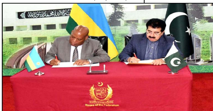
ISLAMABAD: Chairman Senate, Muhammad Sadiq Sanjrani and Dr. Kalinda Francois-Xavier, President of the Senate of Republic of Rwanda signing a memorandum of understanding (MOU), at Parliament House in Islamabad.

However, such statements are mockery and far from reality and have no legal base.