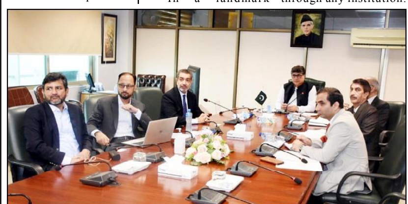
Caretaker Minister for Privatisation, Fawad Hasan Fawad holds a stakeholder meeting for privatisation of HFBCL in Islamabad.

During Q1 FY2024, the strong revenue performance led to a primary surplus of Rs 417bn (0.4% of GDP) against the target of Rs 87bn under the IMF Standby agreement (SBA). FBR revenues clocked in at Rs 2,042bn compared to the target of Rs 1,978bn during Q1, with a strong 37% y/y increase in direct taxes.