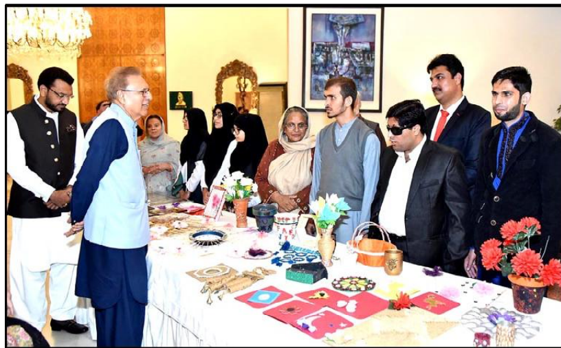
ISLAMABAD: President Dr Arif Alvi viewing the handicrafts made by visually impaired persons, at Aiwan-e-Sadr.