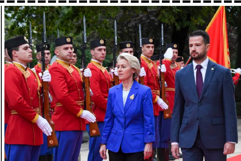
European Commission President Ursula von der Leyen, center left, reviews the honour guard with Montenegro's President Jakov Milatovic in Montenegro's capital Podgorica.