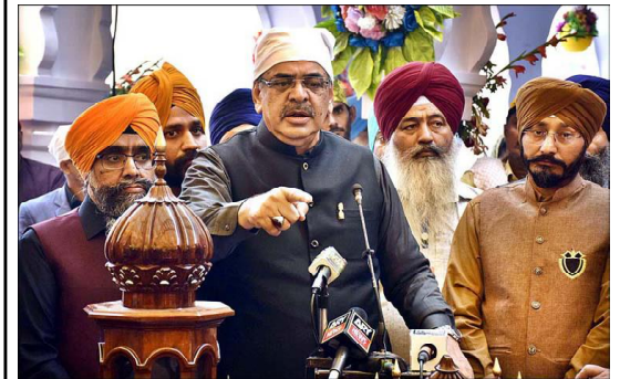
NANKANA SAHIB: Caretaker Federal Minister for Religious Affairs and Interfaith Harmony, Aneeq Ahmed addressing on the occasion of 554th birth anniversary of Guru Nanak Dev.

This platform would also promote the culture of praise and recognition of services of others.