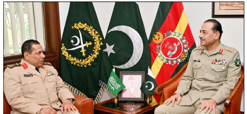
RAWALPINDI: Lieutenant General Fahd bin Abdullah Al-Mutair, Commander of the Royal Saudi Land Forces (RSLF) called on General Syed Asim Munir, NI (M), Chief of Army Staff (COAS) at GHQ.

Army presented the guard of honour to the visiting dignitary. Meanwhile Lieutenant General Fahd Bin Abdullah Muhammad Al Mutair, Commander of the Royal Saudi Land Forces called on General Sahir Shamshad Mirza, Chairman Joint Chiefs of Staff Committee, at Joint Staff Headquarters, Rawalpindi today. During the meeting, both sides deliberated upon various areas of mutual interest, bilateral cooperation including defence and security.