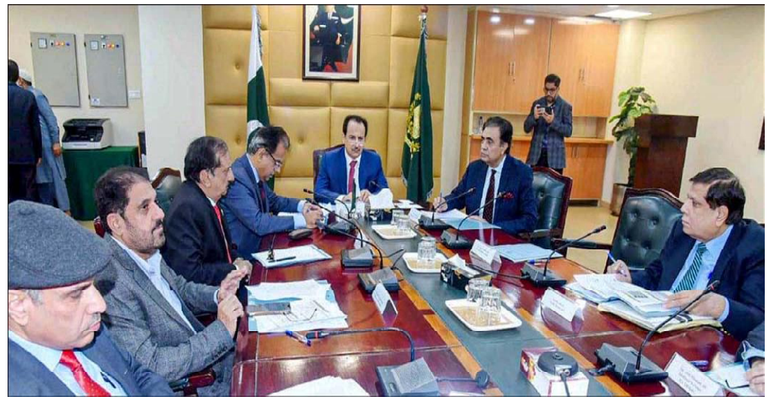
ISLAMABAD: Caretaker Federal Minister for National Health Services, Regulations and Coordination, Dr. Nadeem Jan chaired an Inter Ministerial meeting on health and population participated by all provinces Ministers and their representatives.

added. Private wheat stock comprises 3,37,270 metric tons in Punjab, 93,165 metric tons in Sindh, 14,918 metric tons in Khyber Pakhtunkhwa, and 4,157 metric tons in Balochistan. The Minister for Parliamentary Affairs said that Pakistan had over seven million (7,213,884) metric tons of wheat, with an additional imported stock of 10,33,845 metric tons, ensuring there was no short