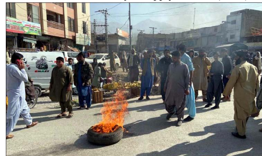
QUETTA: Residents of Satellite Town are blocked road and burn tires as they are holding protest demonstration against low pressure of sui gas in their area.