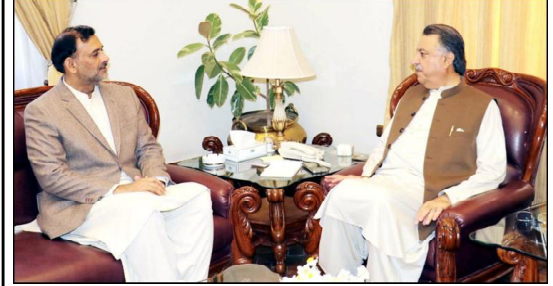
QUETTA: Accountant General Balochistan Hassan Saqlain meeting with Governor Balochistan Malik Abdul Wali Khan Kakar

The role of this forum is to provide national leadership, coordination and align roles and responsibilities of all stakeholders on national priorities and international commitments and also generate consensus on actions to address bottlenecks in implementation related to policy and strategic issues.