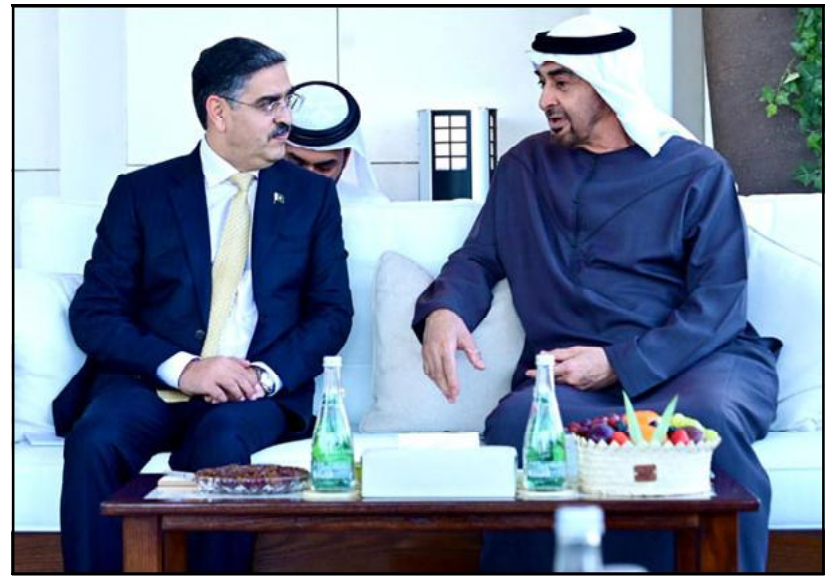
ABU DHABI: Caretaker Prime Minister Anwaar-ul-Haq Kakar meeting with President of the United Arab Emirates Sheikh Mohamed bin Zayed Al Nahyan

He expressed the hope that the MoUs that were signed by the two countries would turn into tangible projects very soon.