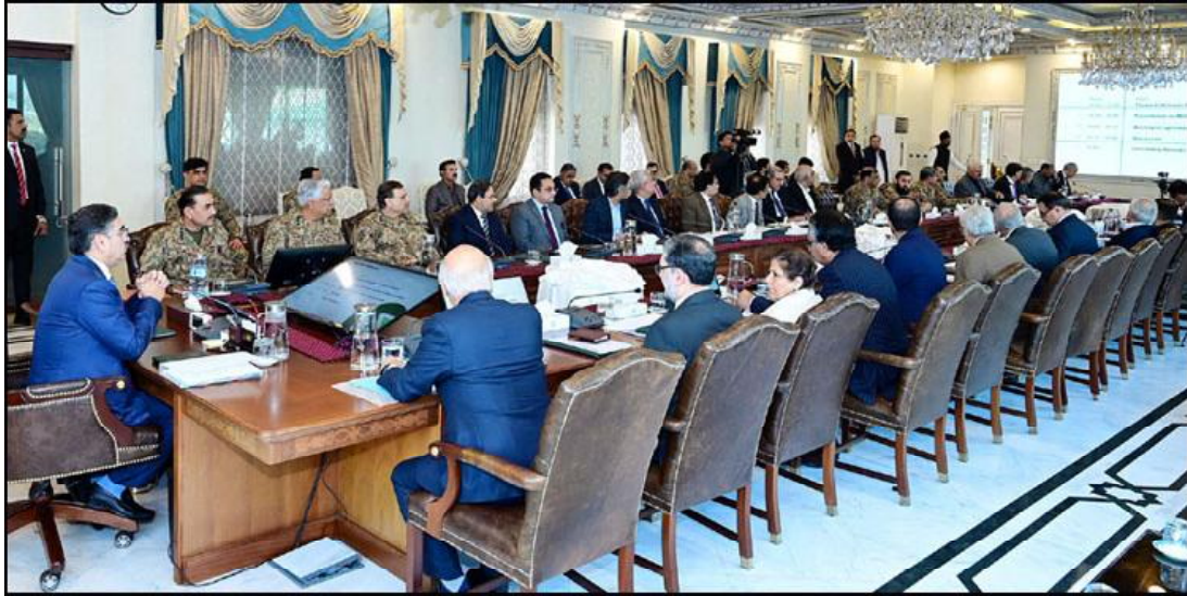
ISLAMABAD: Caretaker Prime Minister Anwaar-ul-Haq Kakar chairing a special session of the Apex Committee of SIFC held to foster strategic partnerships with friendly countries.

Ph: 2841470/2841473 Vol: XVIII No. 320, Jamadi-ul-Awwal 10, 1445 AH Saturday November 25, 2023, Pages 08, Price Rs.15