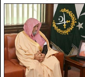
RAWALPINDI: His Excellency Sheikh Saleh bin Abdullah bin Muhammad Humaid, Imam-e-Kaaba called on General Syed Asim Munir, Chief of Army Staff (COAS) at General Headquarters, in City.

Imam-e-Kaaba said, "Islam is a religion of peace & brotherhood and there is no space for misconstrued interpretations of Islam." The dignitaries condemned the ongoing atrocities in the Gaza conflict and the oppression of the Muslims in the Indian Illegally Occupied Jammu and Kashmir (IIOJK), and expressed solidarity with the people of Palestine and Kashmir.