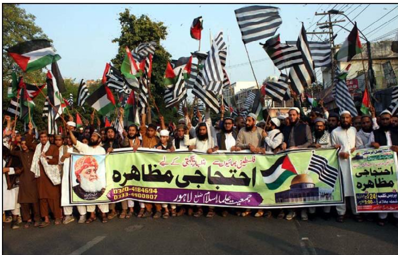
LAHORE: Activists of Jamiat Ulema-e-Islam (JUI-F) are holding protest demonstration against Israeli cruel and inhumane acts and express unity with the innocent people of Palestine, at Lahore press club