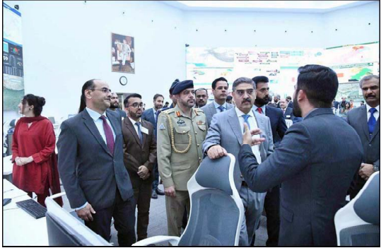
ISLAMABAD: Caretaker Prime Minister Anwaar-ul-Haq Kakar interacting with team members and officers during his visit to National Emergency Operation Centre.