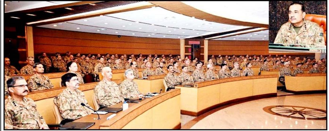
RAWALPINDI: Chief of Army Staff General Syed Asim Munir addressing 82nd Formation Commanders Conference

The forum expressed unequivocal diplomatic, moral and political support to the people of Palestine and reiterated Pakistan's principled stance supporting the two-state solution, based on pre-1967 borders with Al Quds Al Sharif as the capital of Palestine.