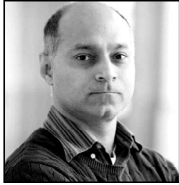
By Khurram Husain

The state, the economy and the people pull the resource envelope of the country in different directions. This is especially the case when periods of macroeconomic adjustments get going, meaning when an IMF programme is being implemented.