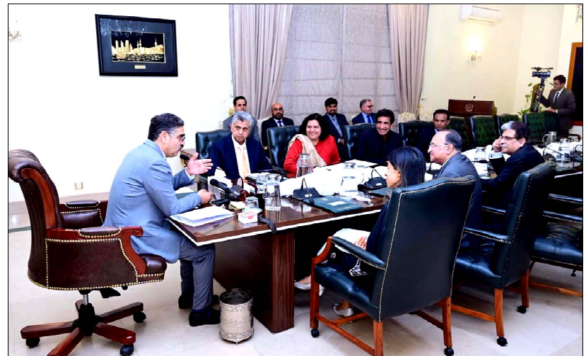
ISLAMABAD: A delegation of All Pakistan Newspapers Society calls on the Caretaker Prime Minister Anwaar-ul-Haq Kakar

The President lauded the leadership of KSA for the recent Saudi-Iran normalization of relations and termed it a major breakthrough that would bring peace and security in the region, besides promoting trade and development. He also appreciated the Saudi initiatives for peace and stability in Yemen, Syria, and Sudan. The President deeply thanked KSA for its economic support to Pakistan in difficult times as well as for extending humanitarian aid and supporting development projects, especially in the education and healthcare sectors in Pakistan.