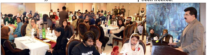
Chairman Senate, Muhammad Sadiq Sanjrani addressing the youth representatives along with tribal elders from Balochistan at Parliament House, Islamabad.