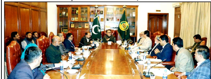
QUETTA: Governor Balochistan Malik Abdul Wali Khan Kakar presiding over a review meeting regarding IT Initiative Digital Balochistan

In all 300 jawans of ATF passed out at the passing out after completion of basic anti-terrorist training at the ATF school.