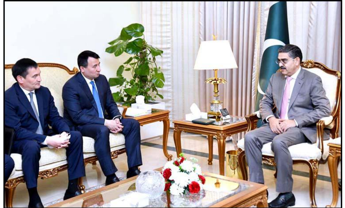
ISLAMABAD: Deputy Prime Minister of Uzbekistan, H.E. Dr. Jamshid Khodjaev Abdulkhakovich calls on the Caretaker Prime Minister Anwaar-ul-Haq Kakar.

The development work started for Balochistan, was stopped after the end of the PML-N government, Sharif added.