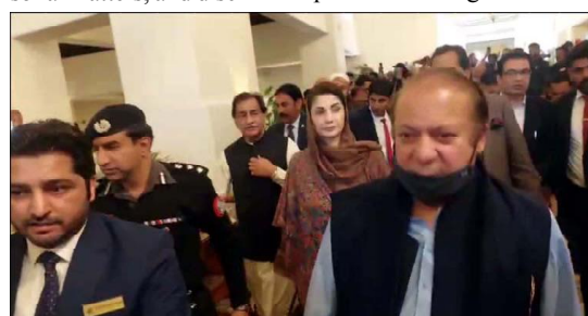
QUETTA: Muslim League (PML-N) Chief, Nawaz Sharif reached Quetta on 2-day visit as part of his party policy to form strategic alliances in all provinces ahead of the Feb 8 general elections. PML-N Chief Organiser, Maryam Nawaz is also present.

Achakzai lamented the destruction caused by the West, led by the United States, in Afghanistan to contain the former Soviet Union. He argued that the responsibility for the reconstruction, rebuilding, and development of Afghanistan lies with Russia, the American-led West, and other allies who participated in the Afghan war.