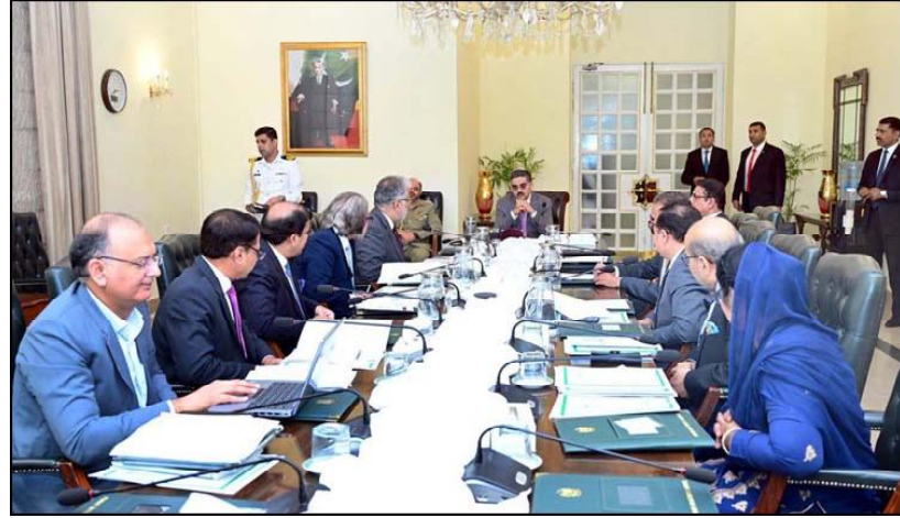
ISLAMABAD: Caretaker Prime Minister Anwaar-ul-Haq Kakar chairing a meeting regarding the Higher Education Commission of Pakistan.