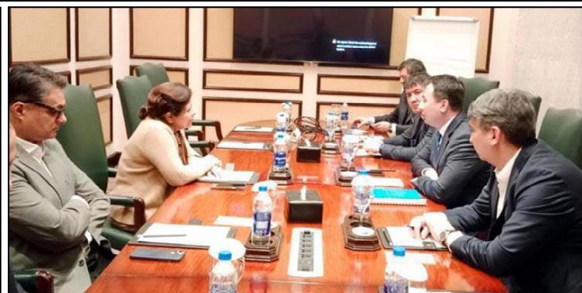
ISLAMABAD: Caretaker Federal Minister for Finance, Revenue, and Economic Affairs, Dr. Shamshad Akhtar, convened a pivotal meeting today with the esteemed Deputy Prime Minister of Uzbekistan, H.E. Dr. Jamshid Khodjaev Abdulkhakovovich.