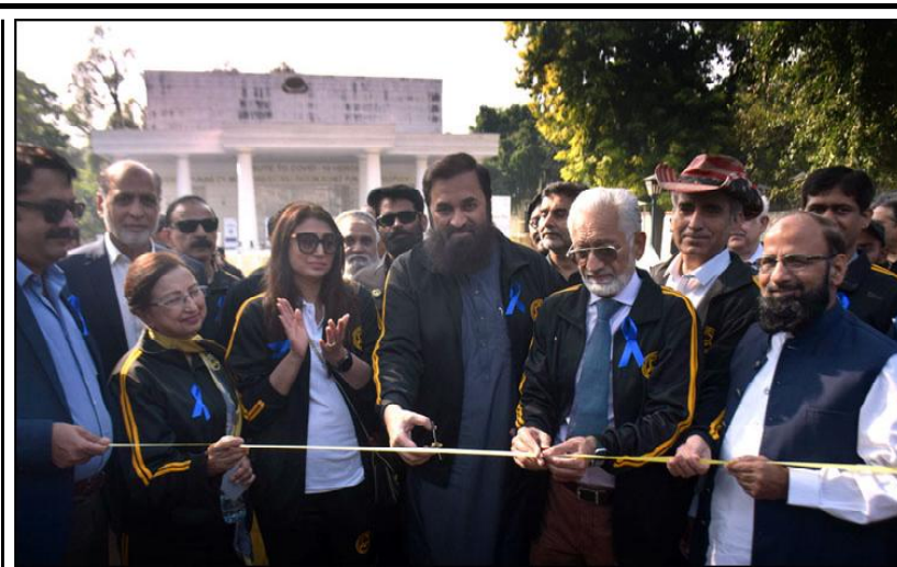
LAHORE: Governor Punjab Muhammad Balighur-Rehman cutting the ribbon to inaugurate the awareness walk ceremony on World Diabetes Day.

FAISALABAD (APP): The police department in collaboration with Counter Terrorism Department (CTD), Civil Defence, Elite Force, local administration and emergency departments arranged a mock exercise at the office of City Police Officer (CPO) to improve the efficiency and response of security personnel.