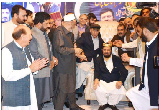
PESHAWAR: Khyber Pakhtunkhwa Governor Haji Ghulam Ali being crowned on his best services for Peshawar City and business community for the province.

makes the body healthy, and prevents diseases like diabetes and blood pressure. Governor Punjab said that diabetes affects every organ of the body, especially vision, heart, liver and kidneys. Governor Punjab said that Islam is a complete code of life. He said that we should adopt a healthy lifestyle. Governor Punjab said that as chancellor, he would also direct the vice-chancellors of all universities across the province in writing to organize awareness seminars and workshops to create awareness among the students and prevent this disease.