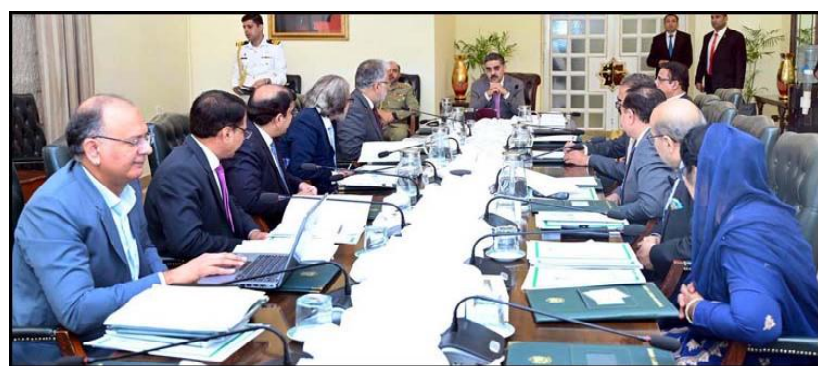
ISLAMABAD: Caretaker Prime Minister Anwaar-ul-Haq Kakar chairing a meeting regarding the Higher Education Commission of Pakistan.