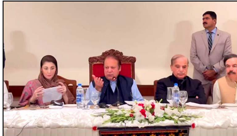
PML-N supreme Nawaz Sharif addressing party workers in Quetta. Former PM Shehbaz Sharif and Maryam Nawaz are also present on the occasion.