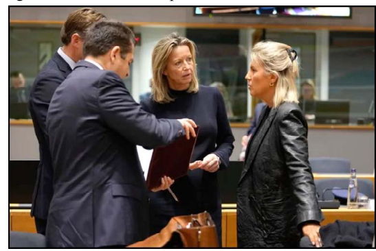
Belgium's Defense Minister Ludivine Dedonder, right, speaks with Netherlands' Defense Minister Kaja Ollongren, second right, during a meeting of EU foreign and defense ministers at the European Council building in Brussels.

Jokowi pressed Biden on steps to end Israel's war with Hamas. "Indonesia appeals to the U.S. to do more to stop the atrocities in Gaza. Ceasefire is a must for the sake of humanity," Widodo said in the Oval Office at the start of talks with the U.S. president.