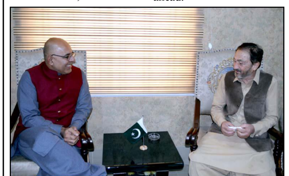
QUETTA: Caretaker Provincial Minister for Local Bodies Sheikh Mehmoodul Hassan meeting with Caretaker Information Minister Jan Achakzai