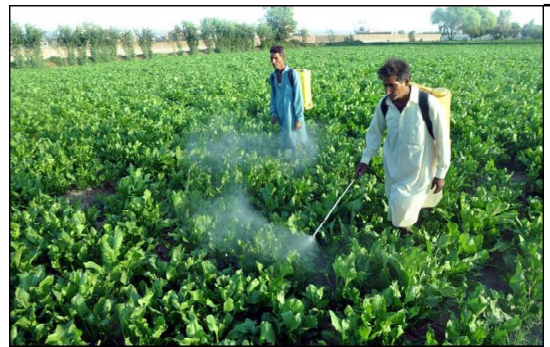
HYDERABAD: Farmers are spraying pesticides over crop at an agricultural field in Hyderabad.

Addressing participants in the 29th Junior Diplomatic Course from the Foreign Service Academy (FSA) Islamabad, he mentioned the "Look Africa" policy of the government and said that Pakistan would have direct access to African countries through this trans-shipping facility. He gave a brief introduction of Faisalabad and FCCI and said that trade organizations are of two types in Pakistan. "One is a trade specific association", he said and added that on the other hand, chambers represent the whole trade and industry in a particular area. He said that due to its holistic nature, its voice was considered as more balanced and effective. He said that the platform of the chamber was playing its productive role in tax policy, budget formulation and other policy related matters with the ultimate objective to protect the legitimate interest of the trade and industry in general and its members in particular.