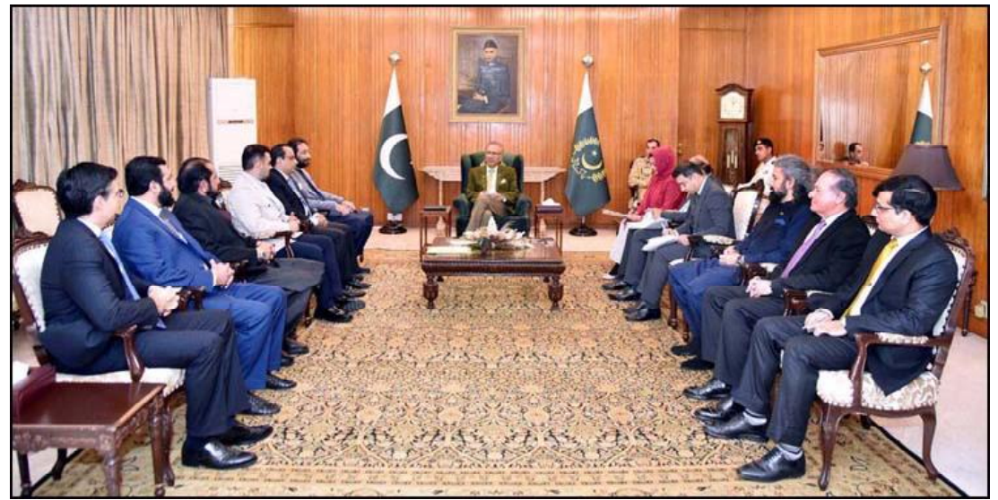
ISLAMABAD: A delegation of honorary consuls of different friendly countries based in Peshawar call on President Dr Arif Alvi, at Aiwan-e-Sadr.

He observed that for promotion of human and technical resources, they would have to extend facility of stipends in the science and engineering subjects. The caretaker prime minister was also given a briefing on the formulated strategy between the academia and the industry for a joint collaboration.