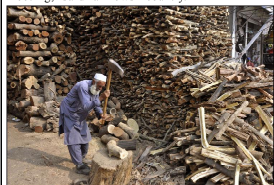
ISLAMABAD: Old man cutting wood into pieces for selling purpose at his workplace.

Therefore, to help grow the country's economy, "we must incentivise broadband fiber connectivity in the country."