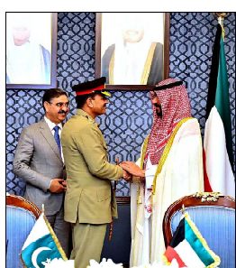
KUWAIT: First Deputy Prime Minister and Minister of Interior of Kuwait Sheikh Talal Al-Khaled Al-Ahmad Al-Sabah shaking hands with Chief of the Army Staff of Pakistan General Syed Asim Munir.