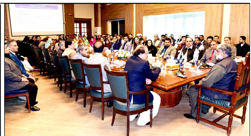
QUETTA: Caretaker Chief Minister Balochistan, Mir Ali Mardan Khan Domki addressing the participants of 12th National Security Workshop Balochistan

ISLAMABAD (Online): Pakistan and Kuwait have reiterated the desire to further deepen and broaden bilateral relations. The desire was expressed by Caretaker Prime Minister Anwaar-ul-Haq Kakar and Crown Prince of the State of Kuwait Sheikh Meshal Al Ahmed Al Jaber Al Sabah during their meeting in Kuwait Wednesday. The Prime Minister reaffirmed the importance Pakistan attaches to its relationship with Kuwait and reiterated the desire to further expand bilateral cooperation in diverse fields. He underscored the resolve to forge deeper economic engagement between Pakistan and Kuwait including in trade, energy, IT, Labour, Mineral and investments. Anwaar-ul-Haq Kakar expressed satisfaction at close cooperation between the two countries at the multilateral fora. He appreciated the measures undertaken by Kuwait for recruitment of Pakistani manpower in the fields of health, security and infrastructure. The Crown Prince of Kuwait reciprocated the sentiments of the Prime Minister.