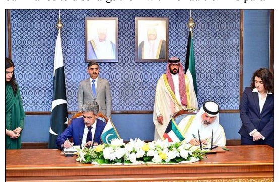
KUWAIT: Caretaker Prime Minister Anwaar-ul-Haq Kakar and First Deputy Prime Minister and Minister for Interior of Kuwait Sheikh Talal Al-Khaled Al-Ahmad Al-Sabah witnessing the signing of MoUs regarding cooperation in various fields between the two countries.

In his decision, he observed that although the complainant received a phone call from a number similar to the bank's helpline, after which, a sum of Rs 344,602 was transferred from his account, however, if the IB/EFT facility had not been opened by ABL, the customer could have been saved from the financial loss caused to him with no fault on his part.