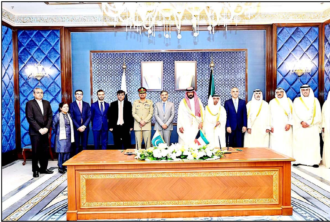
KUWAIT: Caretaker Prime Minister Anwaar-ul-Haq Kakar, First Deputy Prime Minister and Minister for Interior of Kuwait, Sheikh Talal Al-Khaled Al-Ahmad Al-Sabah, Pakistan's Chief of the Army Staff General Syed Asim Munir and Pakistani delegation in a group photo after the signing of MoUs of cooperation between Pakistan and Kuwait.

Ph: 2841470/2841473 Vol: XVI No. 181, Jamadi-ul-Awwal 15, 1445 AH Thursday November 30, 2023, Pages 08, Price Rs. 15