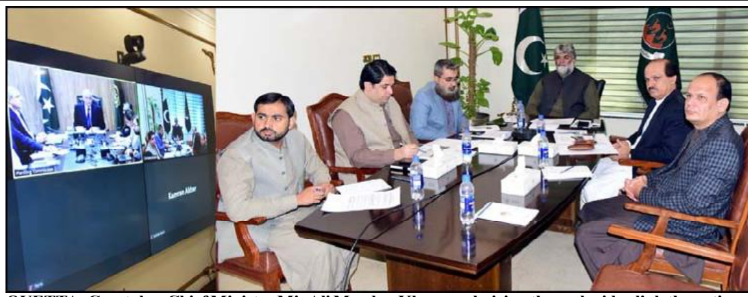
QUETTA: Caretaker Chief Minister Mir Ali Mardan Khan co-chairing through video link the national meeting of steering committee about the rehabilitation projects after the last year's devastating floods in Balochistan held in Islamabad.

Pak-Iran freight train service was restored after completion of repair and