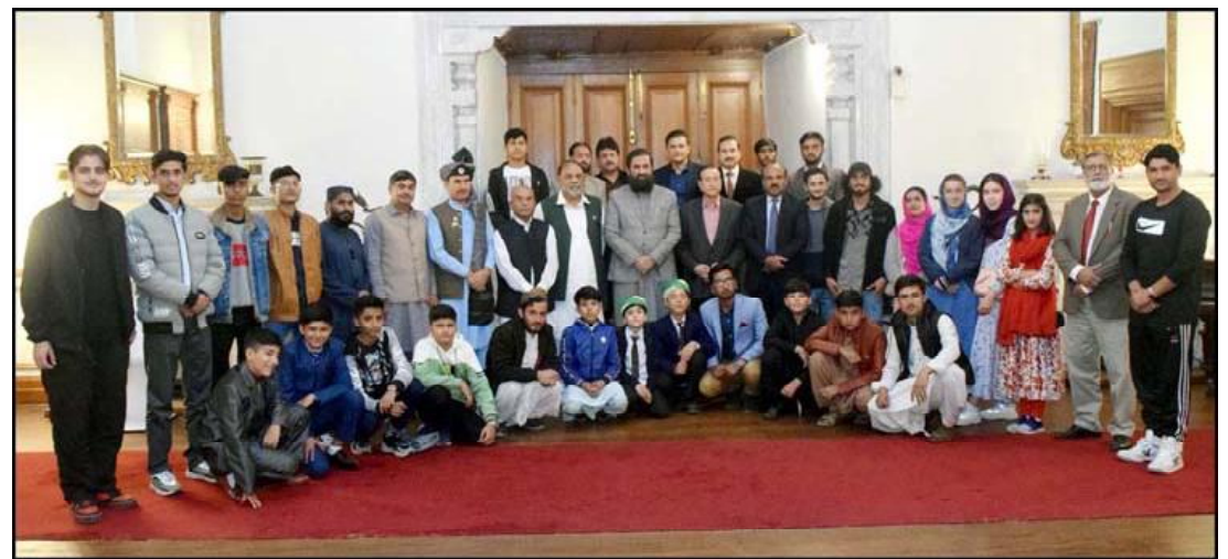
LAHORE: A delegation of students and teachers from various provinces (Caravan of Goodwill and National Unity) under the auspices of the Idara-i-Nazria-i-Pakistan in a group photo with Governor Punjab Muhammad Balighur Rehman at Governor House.

there are institutions like Akhuwat and Edhi Foundation, adding that Pakistan is better than many countries of the world. Punjab Governor Muhammad Balighur Rehman said that people and delegations from different walks of life keep visiting the Governor's House, but the delegation under goodwill and national unity caravan is unique in the sense that it is comprised of four provinces.