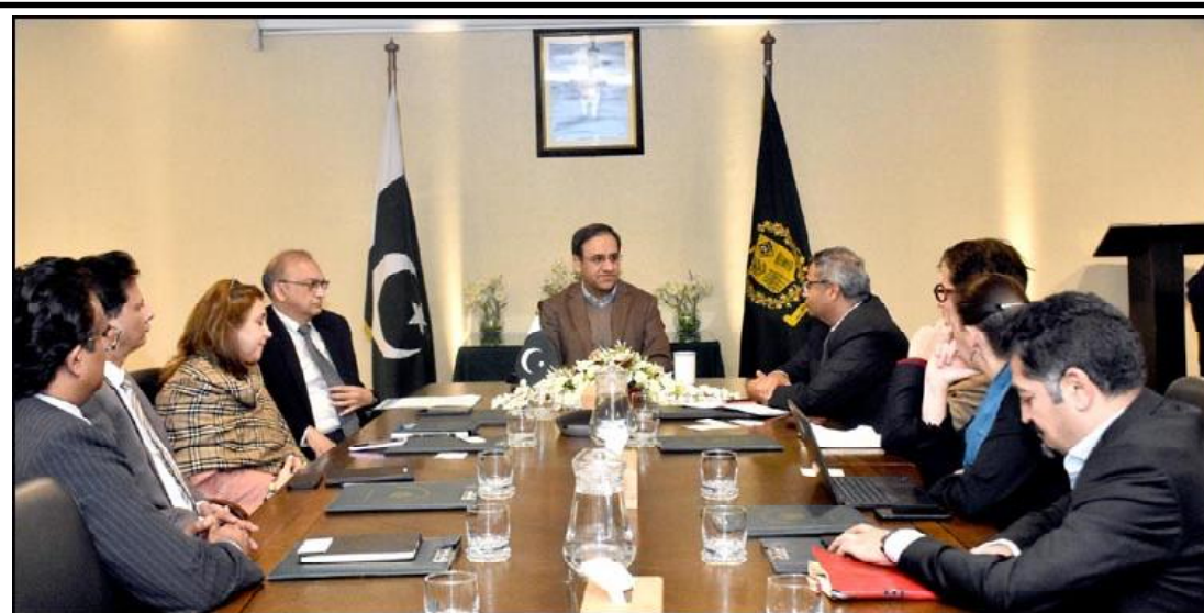
Caretaker Federal Minister for IT and Telecommunication, Dr. Umar Saif in a meeting with the World Bank delegation in Islamabad.

He suggested Pakistan Improve the quality of public spending and take serious measures to expand the revenue base, ensuring that the better off pay their share. The country to Pursue business regulatory and trade reforms and reduce the presence of the state in the economy to increase productivity, competitiveness, and exports, he said.