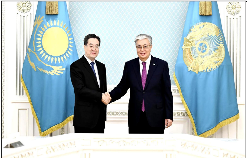
ASTANA: Chinese Vice Prime Minister Ding Xuexiang meeting with Kazakhstan President Kasym-Jomart Tokayev