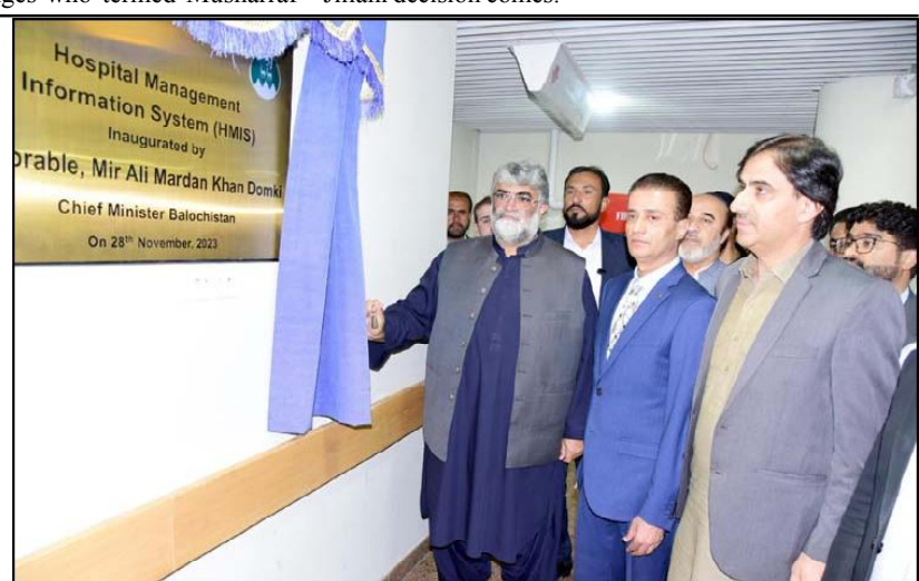
QUETTA: Caretaker Chief Minister Balochistan Mir Ali Mardan Khan Domki inaugurates Hospital Management Information System at Sheikh Khalifa bin Zayed Medical Complex.

As a traditional Kuwaiti welcoming gesture, the caretaker prime minister was also presented "Kahwa" upon his arrival.