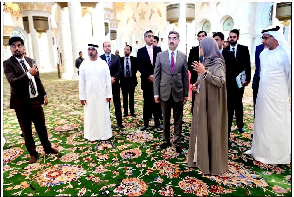
ABU DHABI: Caretaker Prime Minister Anwaar-ul-Haq Kakar visiting the Sheikh Zayed Grand Mosque