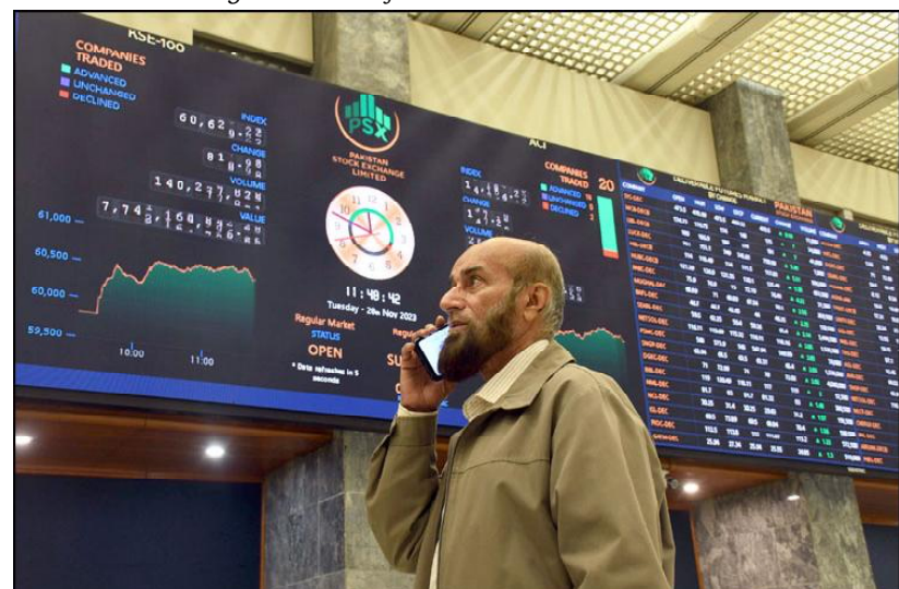
KARACHI: Pakistani stockbrokers monitor the share prices during a trading session at the Pakistan Stock Exchange (PSX) as The Pakistan Stock Exchange (PSX) witnessed a historic surge in intraday trade as the benchmark index.

About tourism, he said that the scenic valleys of northern areas of Pakistan are more beautiful than Switzerland but Pakistan should make these areas easily accessible for the tourists.