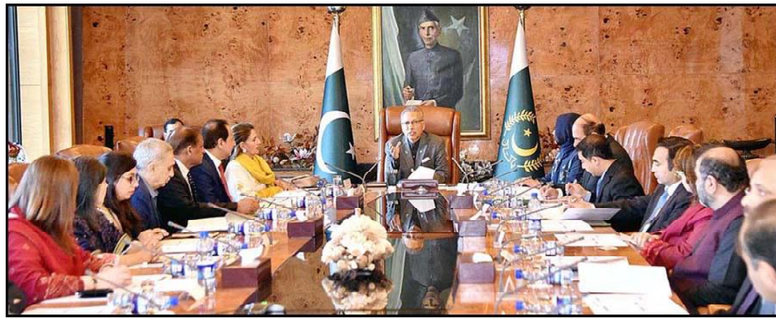
ISLAMABAD: President Dr. Arif Alvi chairing a meeting on mental health issues in Pakistan, at Aiwan-e-Sadr.