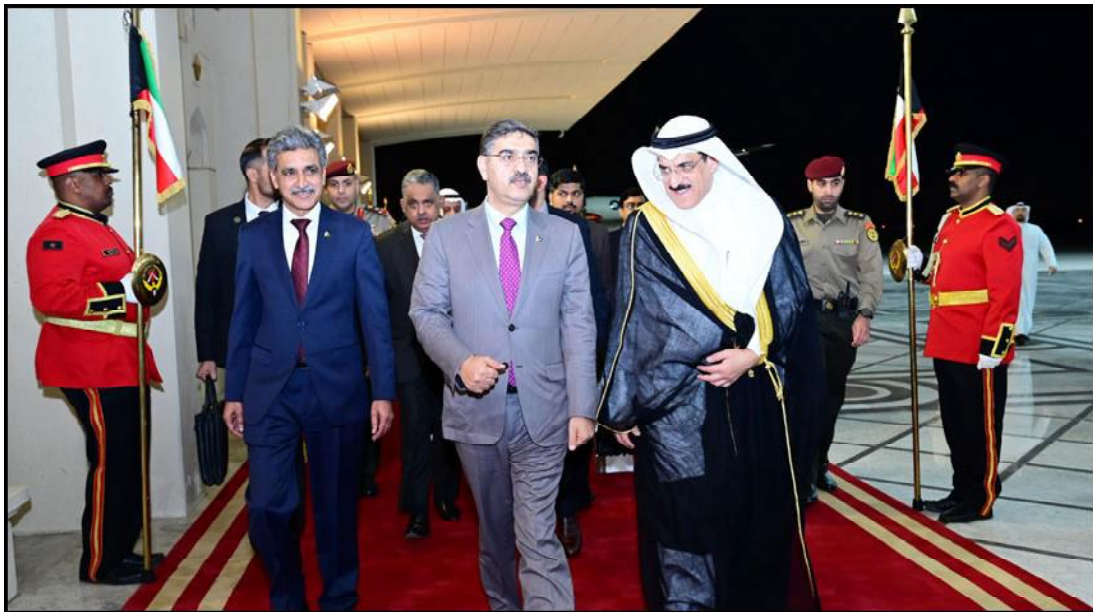
KUWAIT: Kuwait's Minister for Electricity, Water and Renewable Energy Dr Jassim Mohammed Abdullah Al-Ostad receiving Caretaker Prime Minister Anwaar-ul-Haq Kakar upon arrival of a two-day official visit to meet the Kuwaiti leadership

Ph: 2841470/2841473 Vol: XVI No. 180, Jamadi-ul-Awwal 14, 1445 AH Wednesday November 29, 2023, Pages 08, Price Rs.15