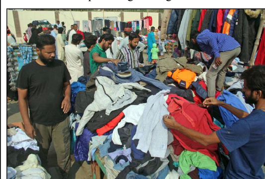
KARACHI: People are buying woolen clothes from vendors after increasing coldness.

While no humanitarian situation is comparable in terms of devastation, these disasters have all affected and continue to affect millions of people, exposing them to disease, hunger, and displacement, with women and children being the most vulnerable.