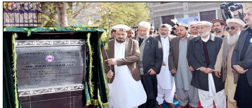
CHITRAL: Governor Khyber Pakhtunkhwa Haji Ghulam Ali performed ground breaking ceremony of the University of Chitral main campus during his visit to district Chitral.