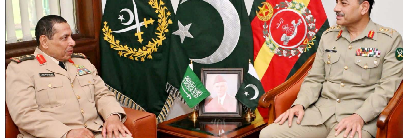
RAWALPINDI: Lieutenant General Fahd bin Abdullah Al-Mutair, Commander of the Royal Saudi Land Forces (RSLF) called on General Syed Asim Munir, NI (M), Chief of Army Staff (COAS) at GHQ.