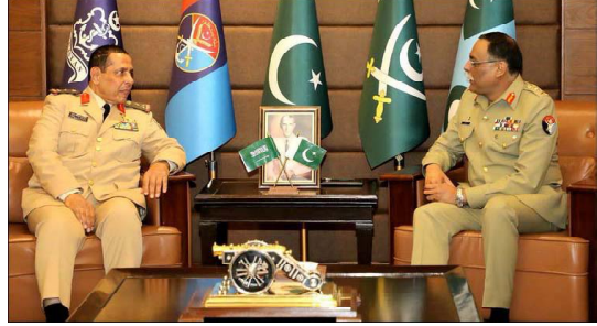
RAWALPINDI: Lieutenant General Fahad Bin Abdullah Muhammad Al Mutair, Commander of the Royal Saudi Land Forces called on General Sahir Shamsah Mirza, Chairman Joint Chiefs of Staff Committee, at Joint Staff Headquarters, Rawalpindi.

On the occasion, he also penned down his expressions in the visitors' book placed in the embassy.