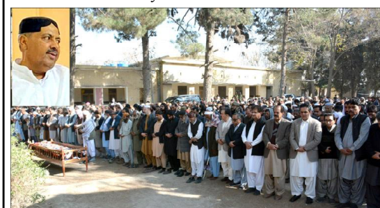
QUETTA: Funeral prayers of BAP leader Mir Ismail Lehri being offered.

It further said that the Government should take all necessary steps to utilize the amount allocated for the construction of roads, schools, and other facilities in the affected areas in consultation with local elders of Kohistan on a merit basis.