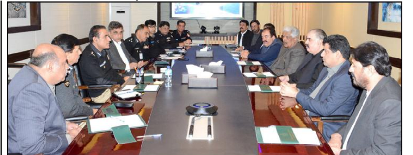
QUETTA: Central leader of Pakistan Peoples Party Nawab Sanaullah Zehri being briefed about security arrangements of PPP's 30th November public gathering during his visit to CPO.

Consonant with this responsibility Federal Ministry of Health has been striving to provide suitable platforms to ensure harmonization of various areas in health and population, particularly those which require a coordinated national approach and face common critical challenges.