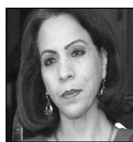
By Dr Farzana Bari

The recently released UNDP 2023 Gender Social Norms Index (GSNI) reveals the shocking persistence of gender biases globally. The index tracks people's attitudes towards women across four dimensions — political, education, economic and physical integrity in both lower and higher HDI countries.