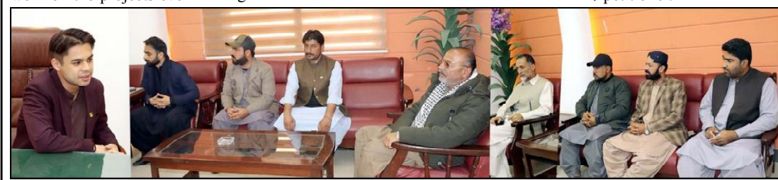
QUETTA: Different delegations meeting with Caretaker Sports and Culture Minister Nawabzada Jamal Khan Raisani.

He said that it is our priority to complete the development schemes in time so that the general public may benefit from them.