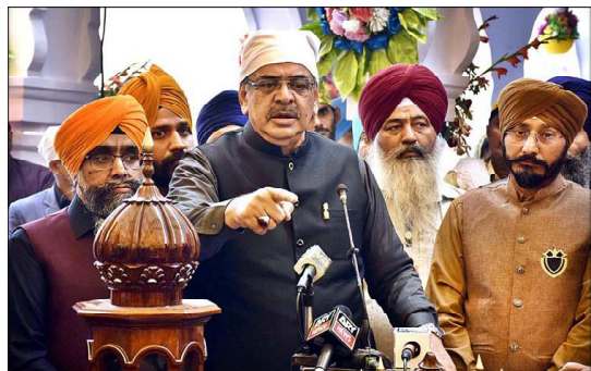
NANKANA SAHIB: Caretaker Federal Minister for Religious Affairs and Interfaith Harmony, Aneeq Ahmed addressing on the occasion of 554th birth anniversary of Guru Nanak Dev.

This platform would also promote the culture of praise and recognition of services of others.