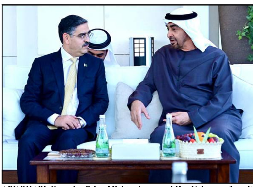
ABU DHABI: Caretaker Prime Minister Anwaar-ul-Haq Kakar meeting with President of the United Arab Emirates Sheikh Mohamed bin Zayed Al Nahyan

QUETTA (APP): Pakistan People's Party (PPP) is set to observe its 56th Youth-e-Tasees (Foundation Day) in Quetta on Thursday (November 30) for which the leadership and workers of the Balochistan Chapter finalized the preparations. "The main function will be held in Quetta for the first time, where Chairman PPP Bilawal Bhutto Zardari and other party leadership will address a grand rally," party sources told APP here on Monday. They said that the Chairman PPP has directed all party leadership and workers to observe the Foundation Day enthusiastically by organizing public meetings across the country. It is pertinent to men-