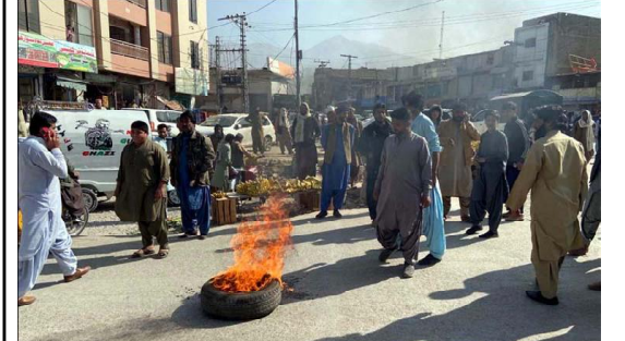
QUETTA: Residents of Satellite Town are blocked road and burn tires as they are holding protest demonstration against low pressure of sui gas in their area.