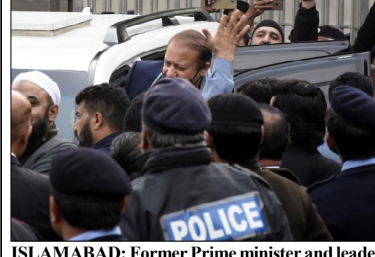
ISLAMABAD: Former Prime Minister and leader of PML N Mian Muhammad Nawaz Sharif leaving after his hearing at Islamabad High Court in Federal Capital.

The EOC sources said that it was the third day of campaign concluded in Quetta, Pishin and Killa Abdullah. The anti-polio campaign was started in these districts on November 24, 2023. According to EOC, it has been targeted to vaccinate over 2.5 million children below five years of age during the campaign being run all over the province. More than 1100 teams have been formed to vaccinate the children during the campaign.