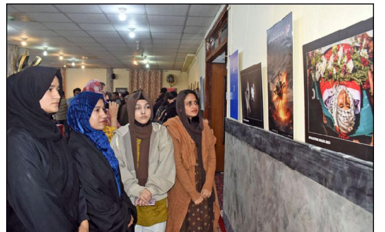
LAHORE: People are taking interest in paintings during exhibition regarding the "Ghaza" at Khana-e-Farhang (Iran) in Provincial Capital.

The chief minister also directed KPK Inspector General of Police for immediate arrest of all the culprits involved in the gory incident.